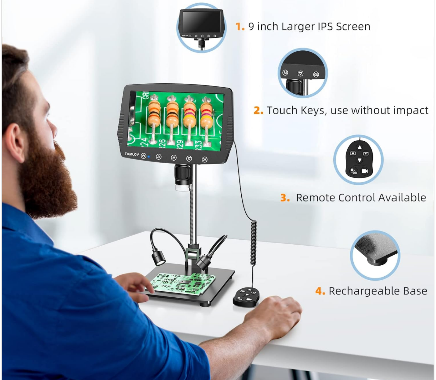
Image: A user setting up the TOMLOV DM04 microscope, demonstrating the assembly of the stand and placement of the microscope unit.