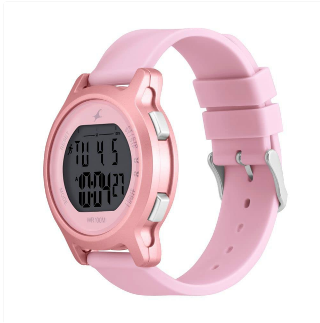
Figure 2: Angled view of the watch, showcasing the comfortable pink silicone strap and the sturdy watch case.