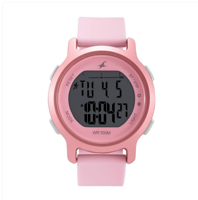
Figure 1: Front view of the Fastrack Street Line Digital Watch, highlighting its digital display and control buttons.

Your Fastrack Street Line Digital Watch (Model NR68027PP02) is designed for durability and functionality, featuring a clear digital display and a comfortable silicone strap. It includes features such as time, date, alarm, stopwatch, and backlight, all within a 100M water-resistant casing.