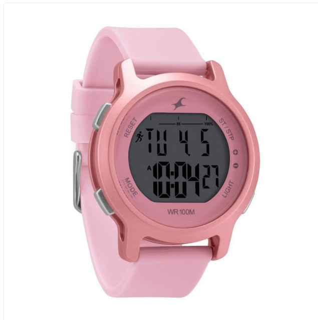
Figure 3: Watch face with labeled control buttons.

Familiarize yourself with the watch's buttons and their functions: