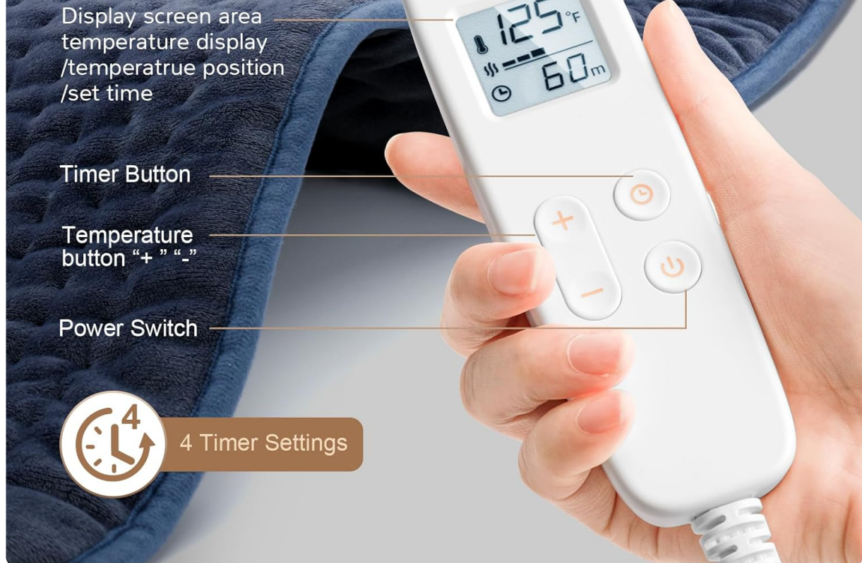
Image: Close-up of the multi-functional LED controller, highlighting the display screen, timer button, temperature buttons, and power switch.