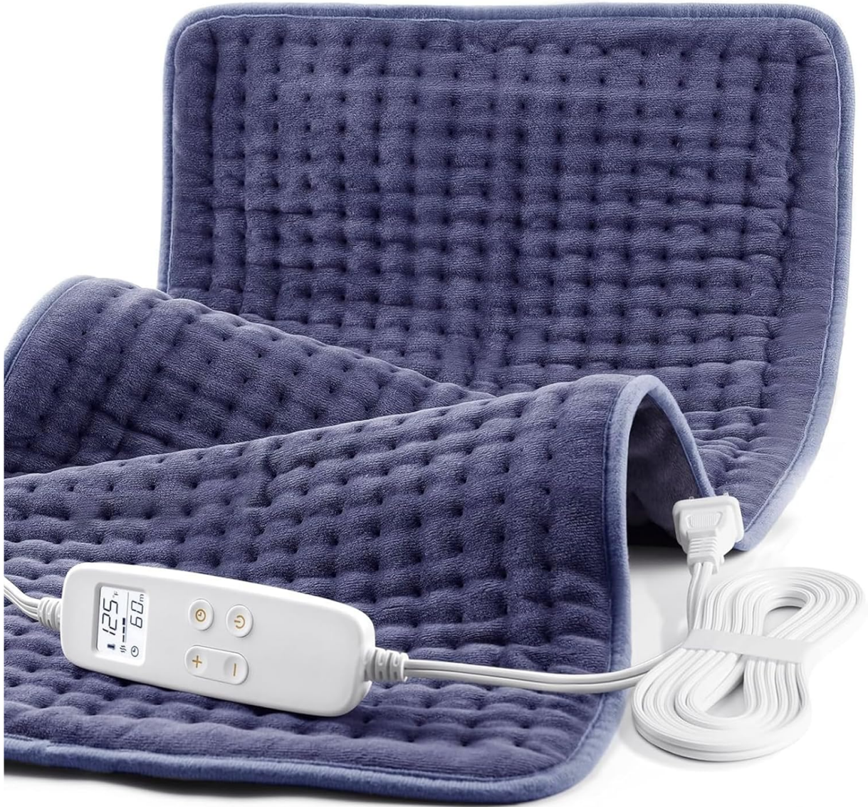
Image: The VAAGHANM 33x17 inch Electric Heating Pad in gray, showing the soft flannel material and the attached controller.