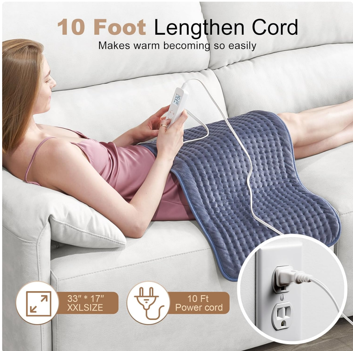
Image: A woman comfortably using the VAAGHANM heating pad on her lower back while seated on a couch, demonstrating its large size and flexible application.