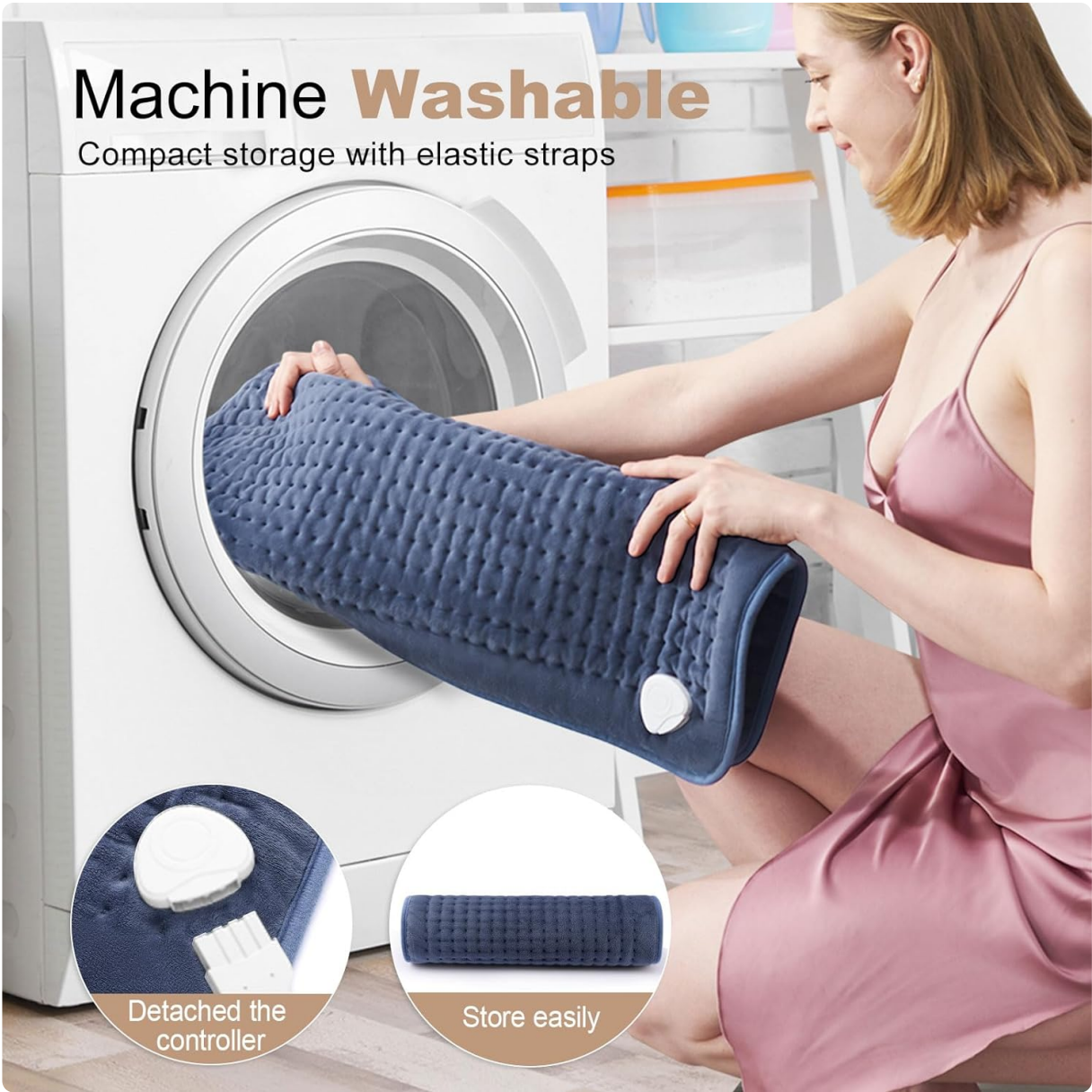
Image: A woman demonstrating how to place the VAAGHANM heating pad into a washing machine after detaching the controller, highlighting its machine-washable feature.