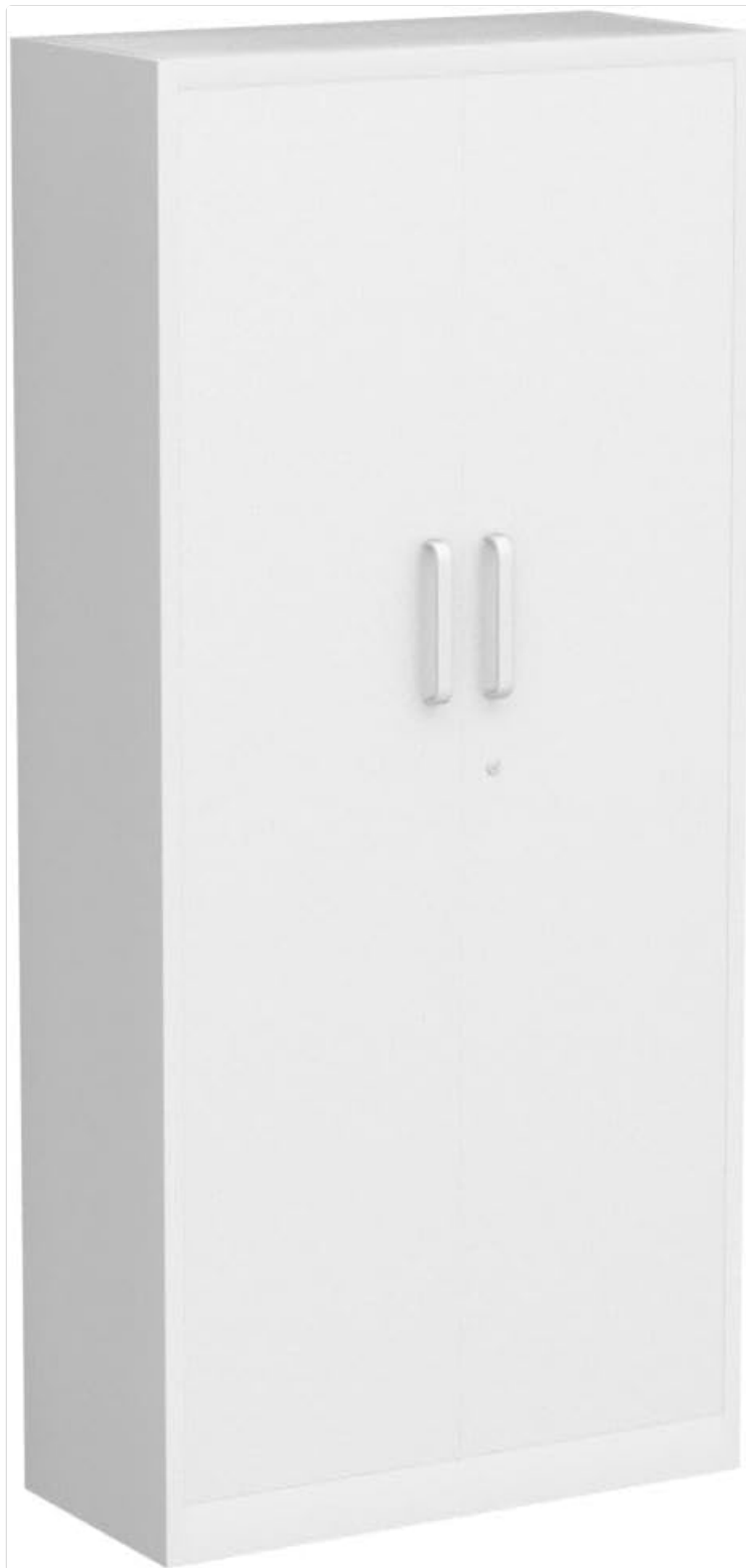
Figure 6: Dimensional overview of the Yizosh Metal Garage Storage Cabinet.