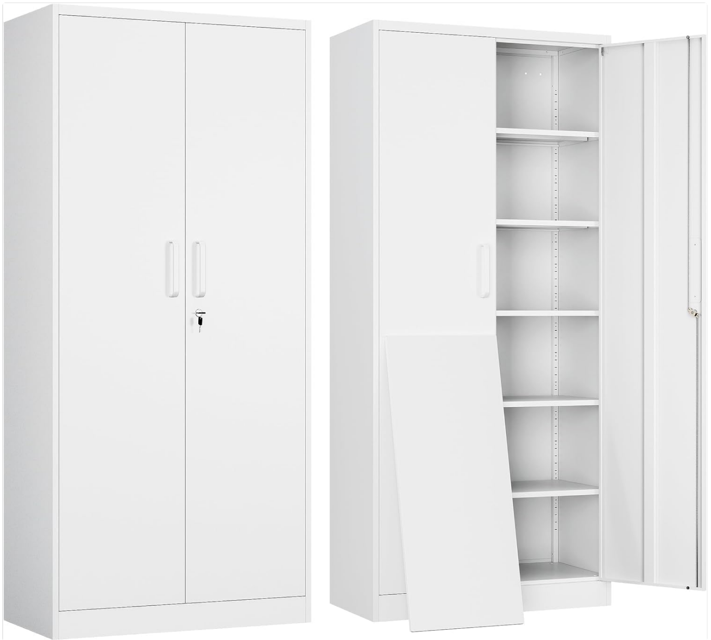
Figure 1: Front view of the Yizosh Metal Garage Storage Cabinet.