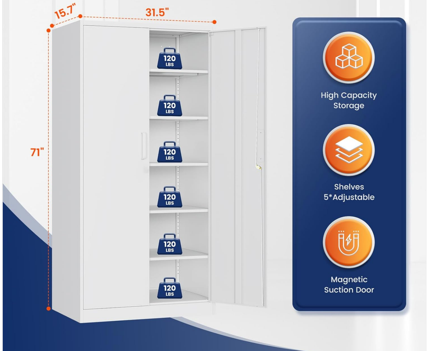
Figure 2: Cabinet with one door open, illustrating the adjustable shelves and interior space.