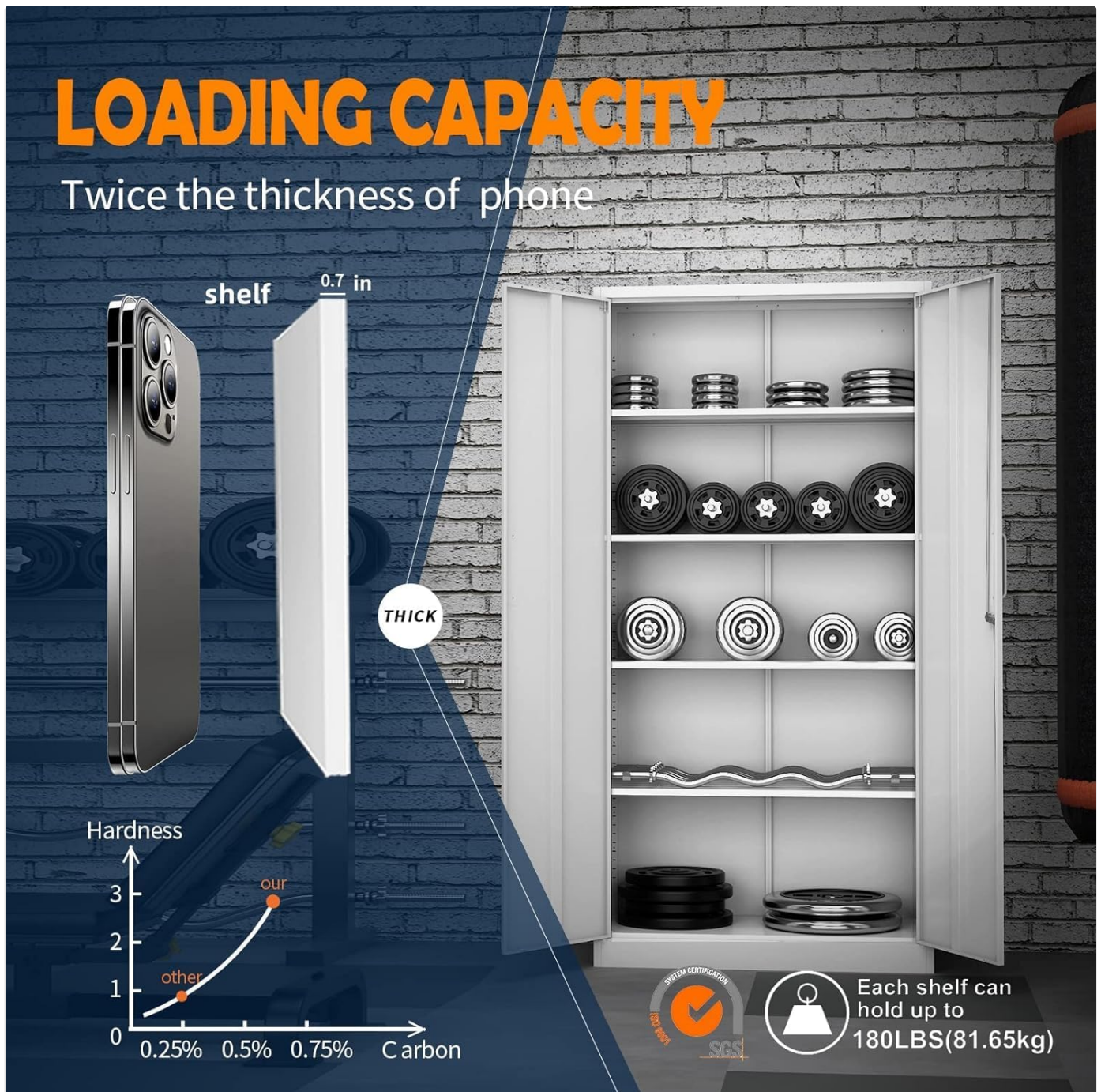
Figure 4: Illustration of the cabinet's loading capacity, showing each shelf can hold up to 180 lbs.