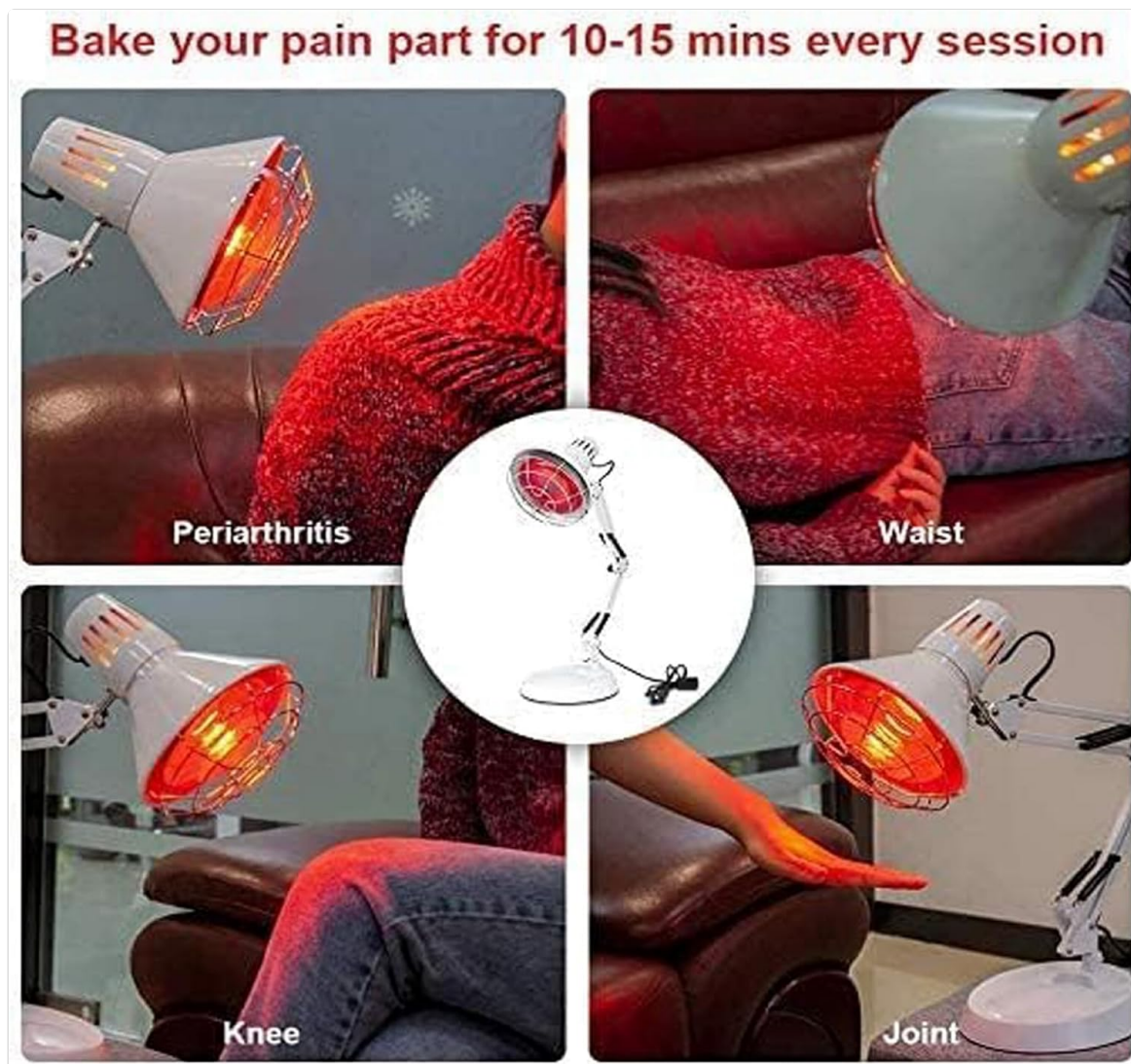
Image 5.3: Examples of targeted heat application on different body areas.

Video 5.2: Demonstration of turning on the lamp, adjusting temperature, and setting the timer.