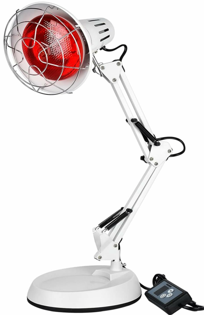
Image 1.1: Overview of the Relassy 150W Infrared Heat Lamp, showing its adjustable arm and integrated control panel.