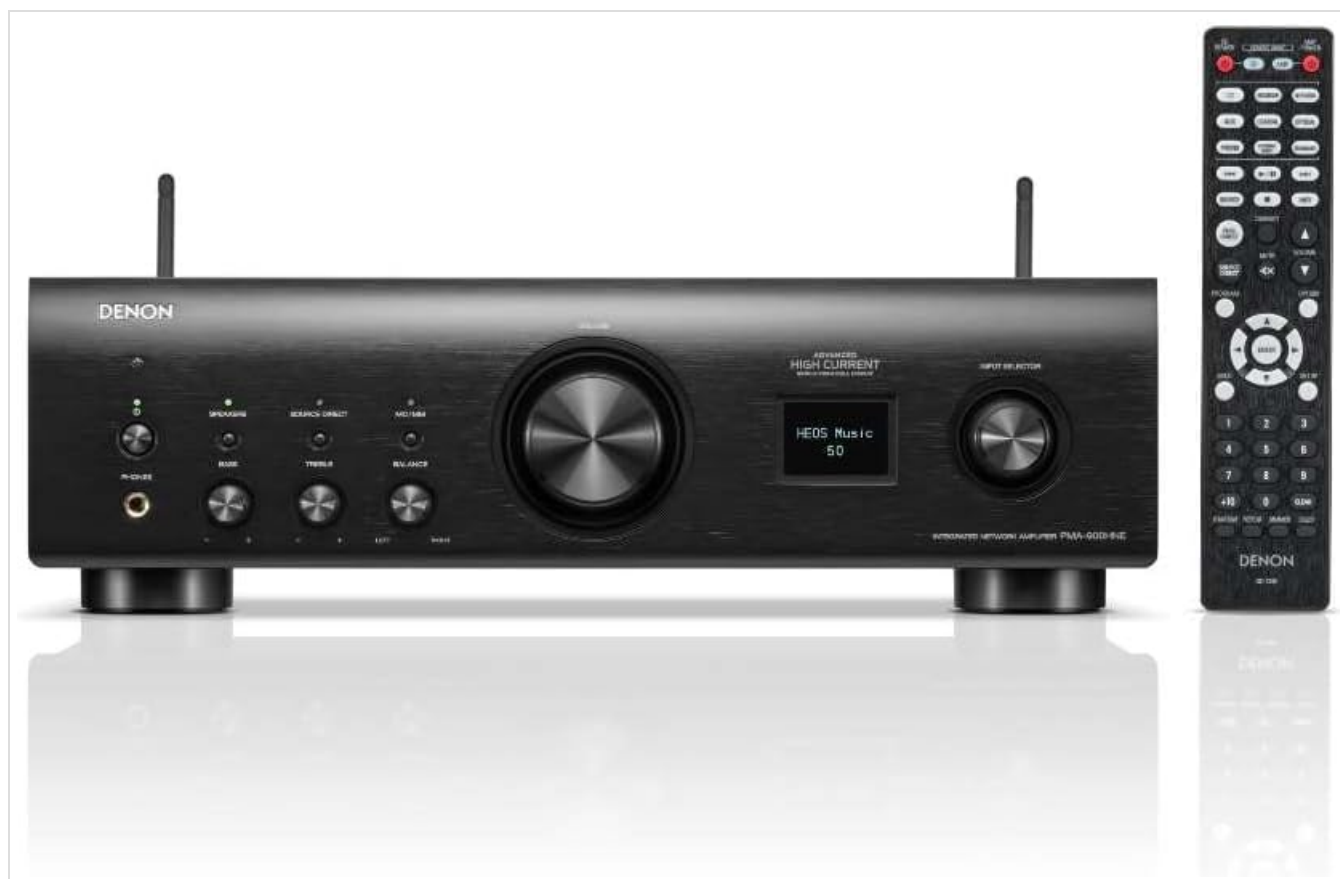
Figure 2: Denon PMA-900HNE amplifier shown with its remote control.