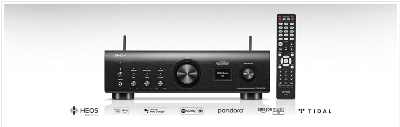
Figure 5: The PMA-900HNE supports various streaming services and voice control platforms.