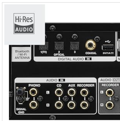
Figure 4: Detailed view of the digital audio input section on the rear panel.