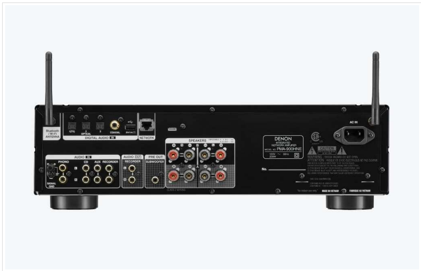
Figure 3: Rear panel connections of the Denon PMA-900HNE, including speaker outputs, analog, digital, and phono inputs.