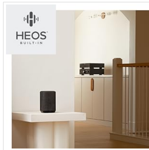
Figure 6: The HEOS Built-in feature enables multi-room audio experiences.