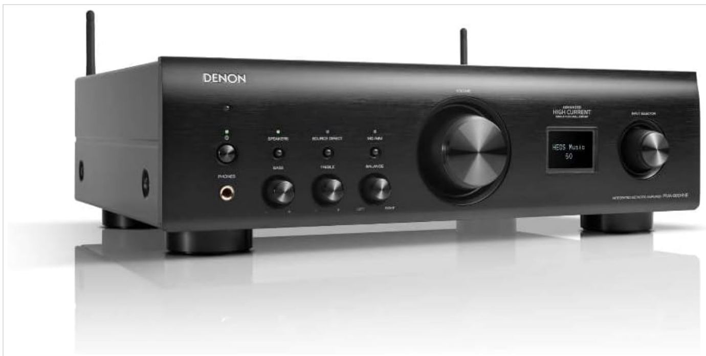
Figure 1: Front view of the Denon PMA-900HNE Integrated Stereo Amplifier.

The Denon PMA-900HNE is an integrated network amplifier designed to deliver high-fidelity audio performance from both analog and digital sources. It features advanced high current (AHC) circuitry, built-in HEOS technology for multi-room audio streaming, and compatibility with various voice assistants. This manual provides essential information for setting up, operating, and maintaining your PMA-900HNE amplifier.