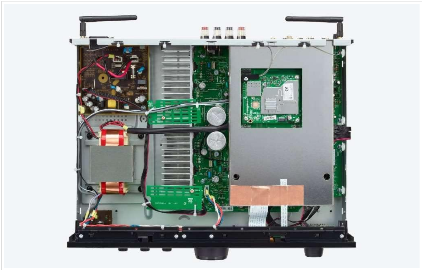
Figure 7: Internal components of the PMA-900HNE, highlighting its advanced circuitry.