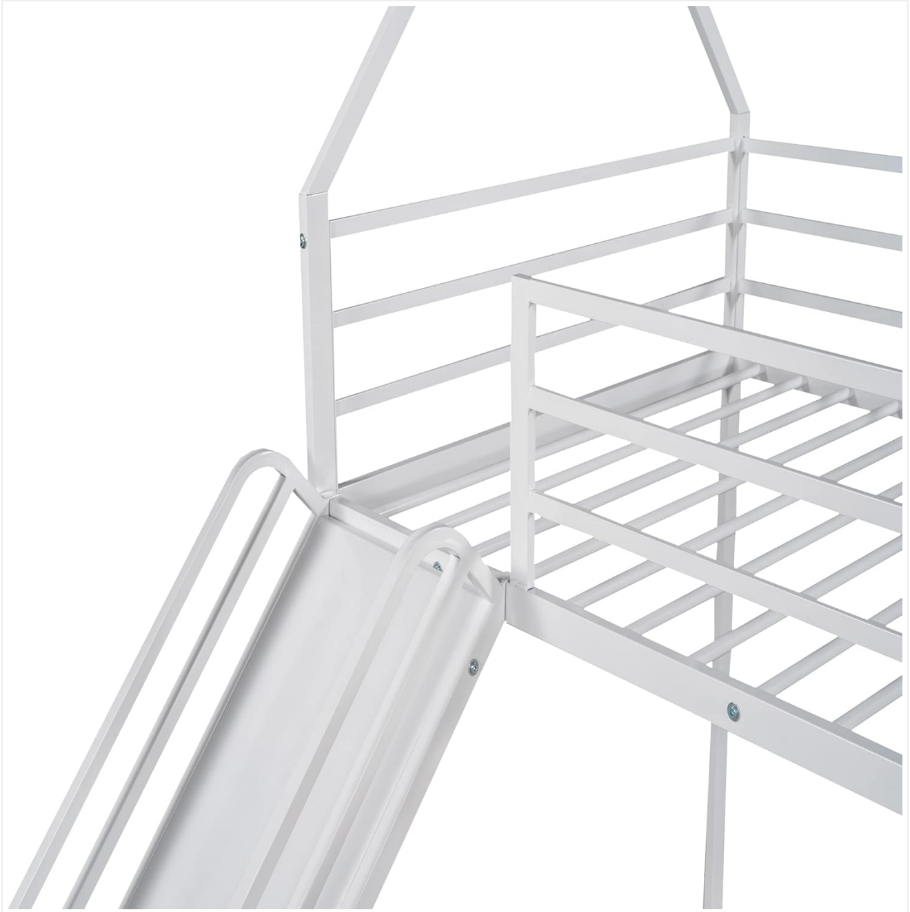
Image: A close-up view showing the attachment mechanism of the slide to the upper bunk frame, highlighting the secure connection points.