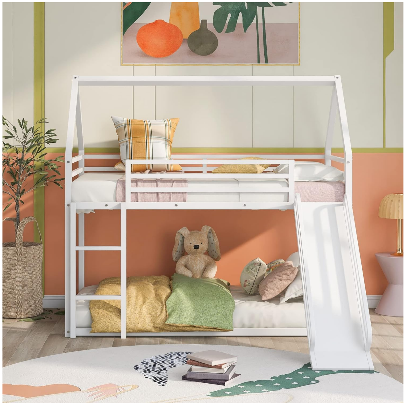
Image: The VilroCaz bunk bed with the slide and ladder positioned, demonstrating its functional layout within a child's room.