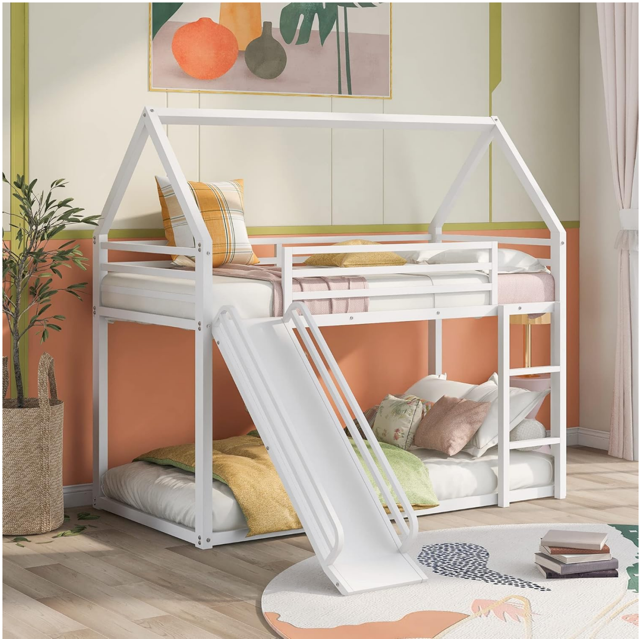
Image: The VilroCaz Modern Twin Over Twin House Bunk Bed in white, featuring a house-shaped roof, a slide, and a ladder. The bed is shown with mattresses and bedding in a room setting.