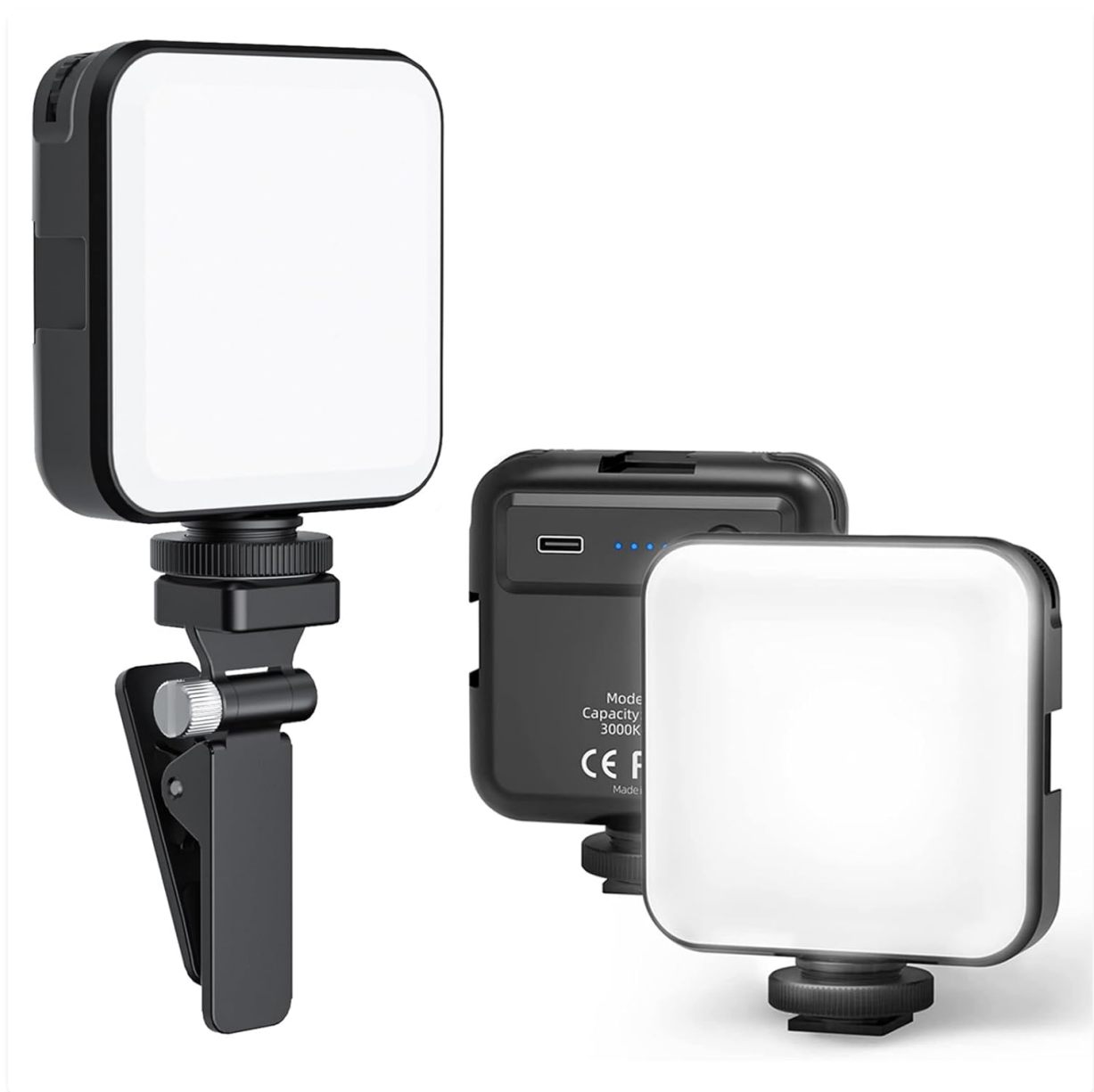
Image 1.1: MOBILIFE HTL001 LED Video Light with included accessories.