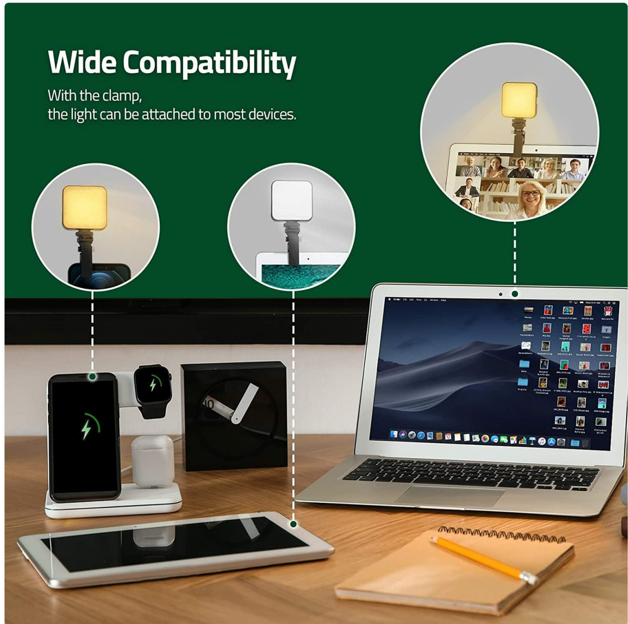
Image 3.2: The light's wide compatibility with laptops, phones, and tablets.