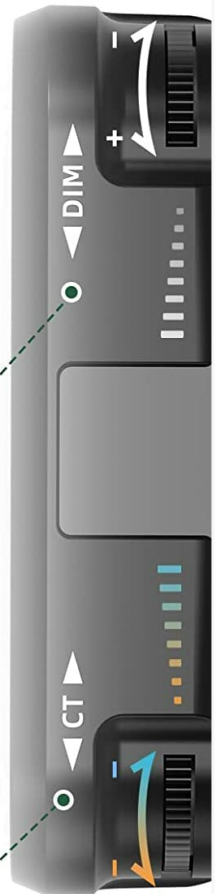
Image 4.1: Stepless adjustment rollers for precise control over light settings.