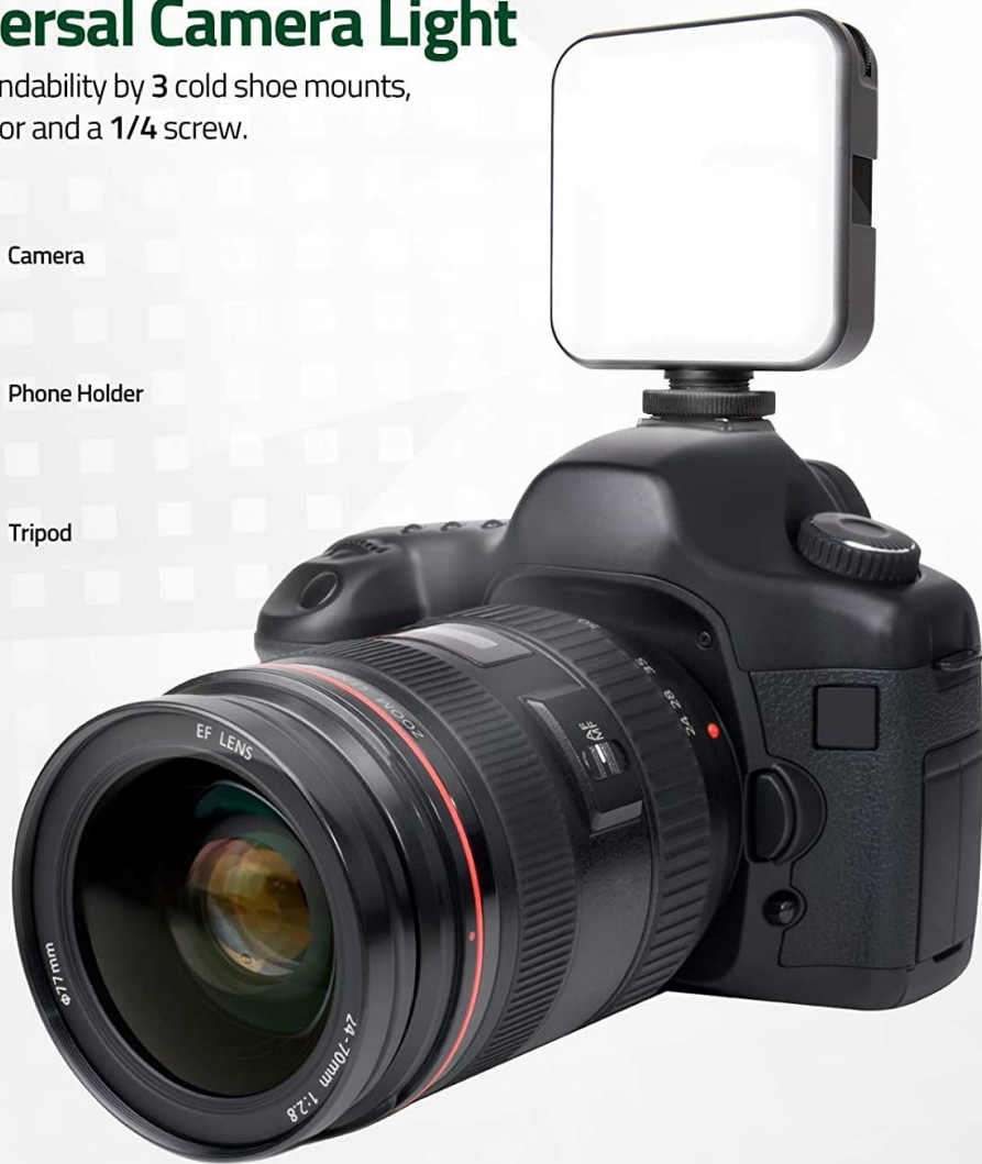
Image 3.3: The light attached to a DSLR camera, demonstrating universal camera compatibility.