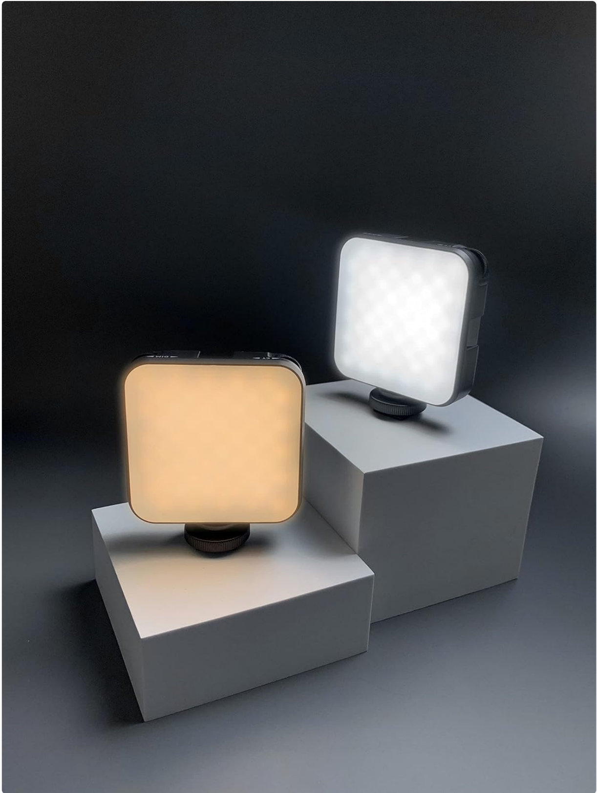
Image 4.2: Visual representation of warm and white color temperature options.