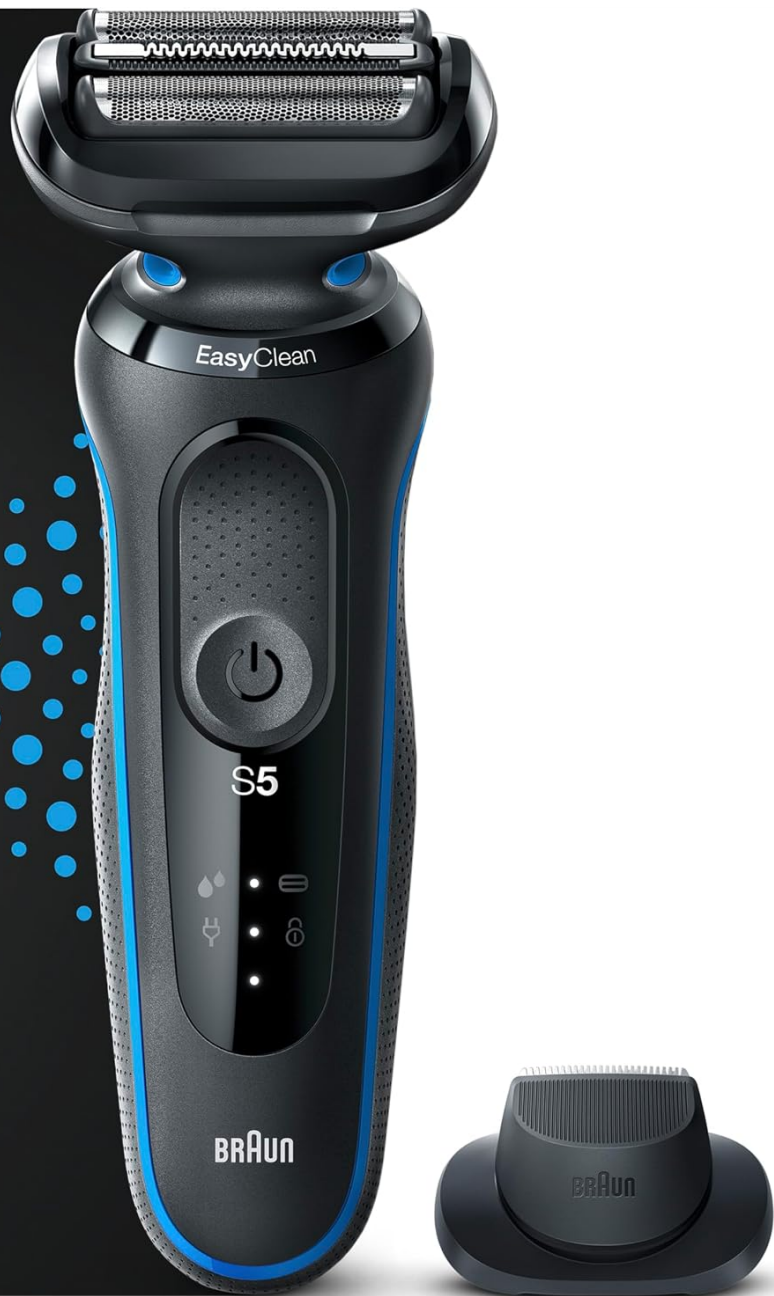
Image: The Braun Series 5 electric shaver in blue and black, shown with its packaging and the included precision trimmer attachment.