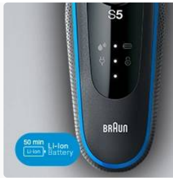
Image: Close-up of the Braun Series 5 shaver's battery indicator lights, showing its Li-Ion battery status.