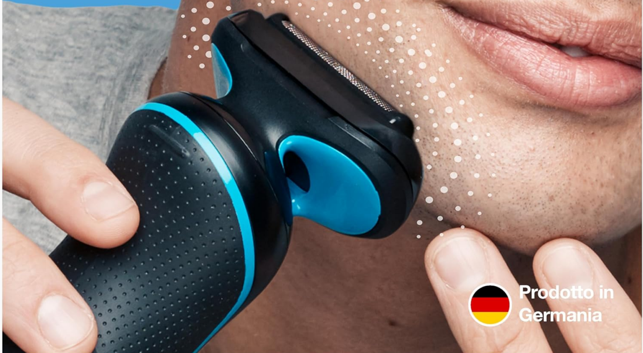
Image: A close-up of the Braun Series 5 shaver in use, highlighting the AutoSense technology that adapts to beard density.

Rileva e si adatta alla densità della barba, catturando e tagliando molti peli ad ogni passata.