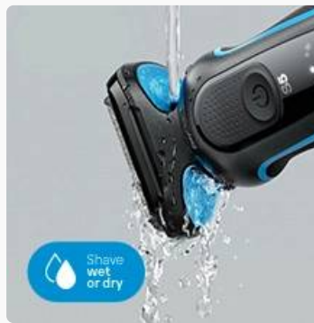
Image: The Braun Series 5 shaver head being rinsed under running water, demonstrating its Wet&Dry capability.