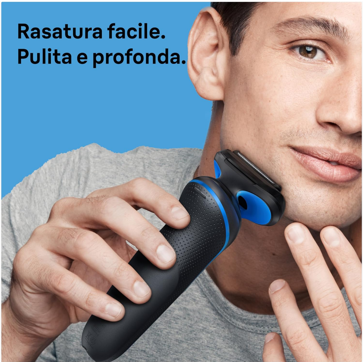
Image: A man using the Braun Series 5 shaver on his face, illustrating the ease of use for a clean and deep shave.