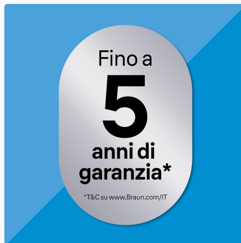
Image: An oval badge indicating "Up to 5 years warranty*" with a note to check T&C on Braun.com/IT.

Braun offers a warranty for the Series 5 shaver. Please refer to the official Braun website for detailed terms and conditions regarding the warranty, which can be up to 5 years. This product is designed for durability and is repairable, ensuring long-term use.