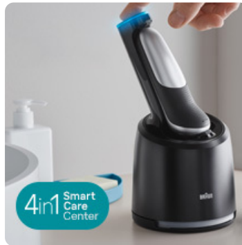
Image: The shaver positioned within the SmartCare Center, ready for its automated cleaning cycle.