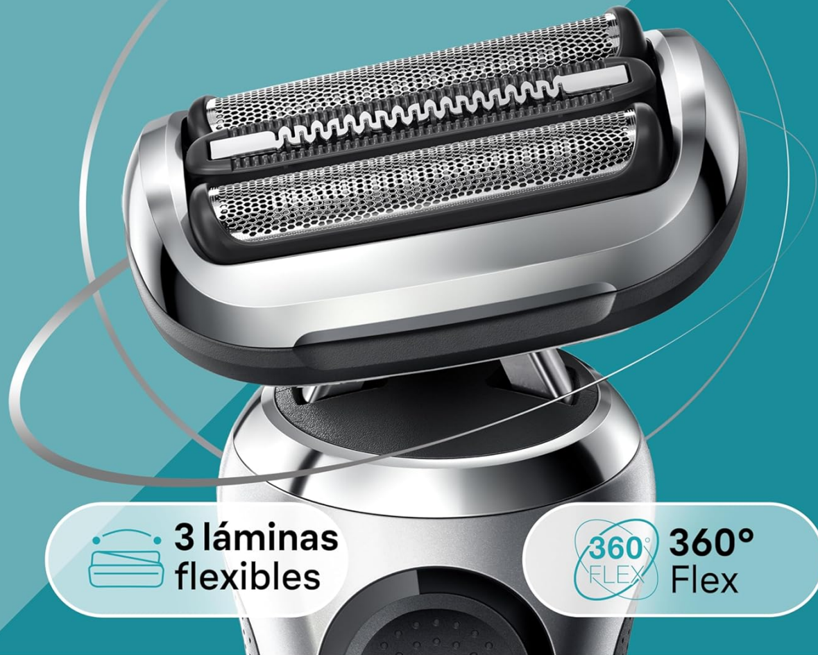
Image: A close-up view of the shaver head, highlighting its flexible design and three flexible blades for contour adaptation.

Se adapta a los contornos para un afeitado apurado, hasta en zonas complicadas.