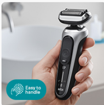
Image: A hand holding the shaver, emphasizing its ergonomic design and ease of handling during use.

The powerful Li-Ion battery provides up to 3 weeks of shaving (50 minutes of cordless shaving) on a full charge. A quick 5-minute charge is sufficient for one full shave.