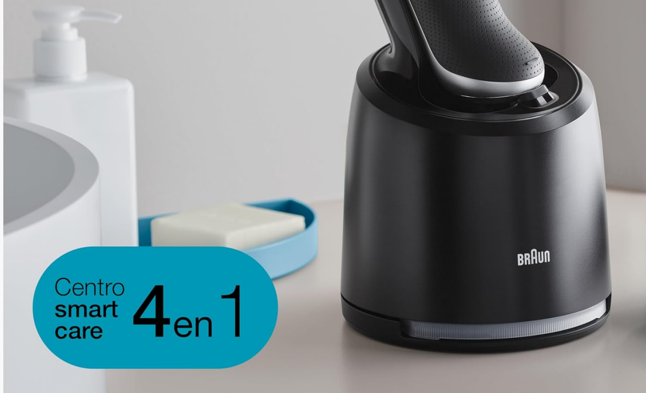
Image: The shaver docked in the SmartCare Center, illustrating its automatic cleaning and charging capabilities.

Para una afeitadora como nueva, cada día.