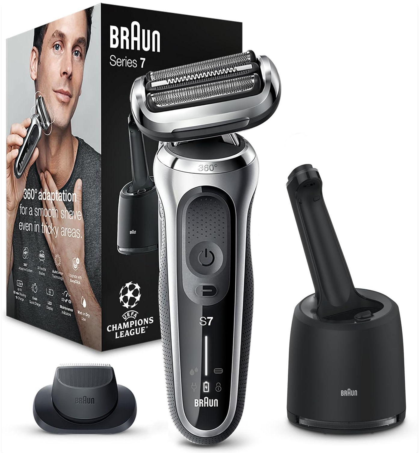
Image: The Braun Series 7 electric shaver, its SmartCare Center, and the precision trimmer attachment, showcasing the complete product package.