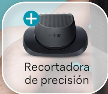
Image: The shaver shown with different EasyClick attachments, including a precision trimmer, demonstrating its versatility.