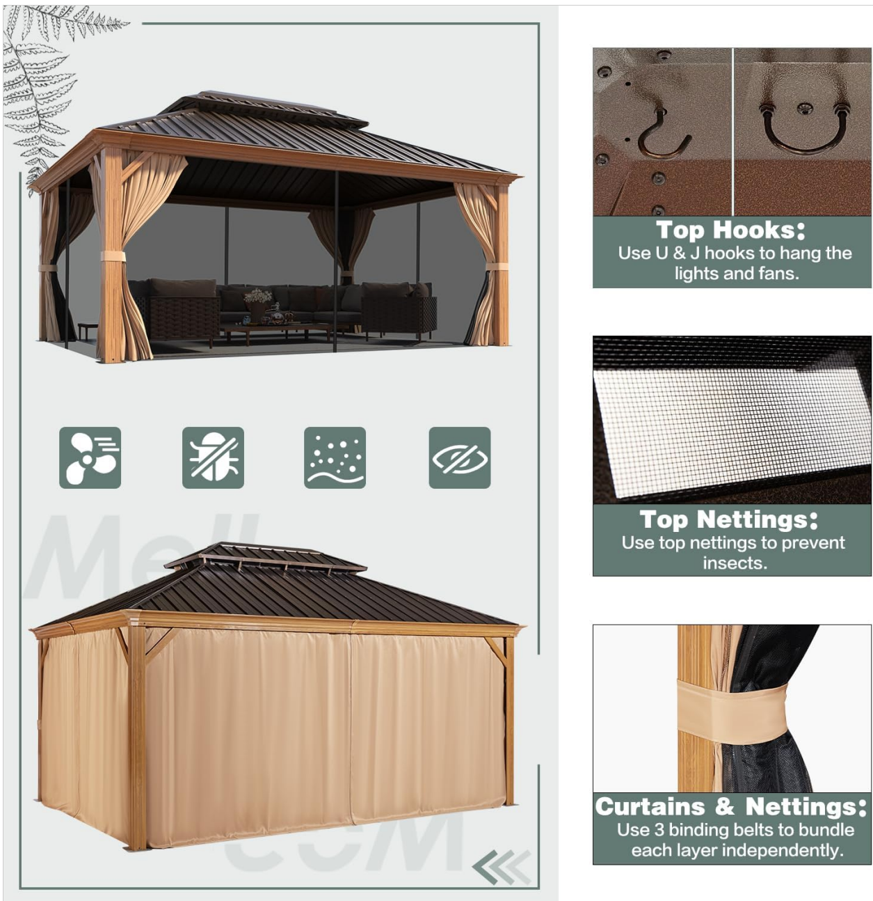
Figure 4: Curtains, Nettings, and Hooks