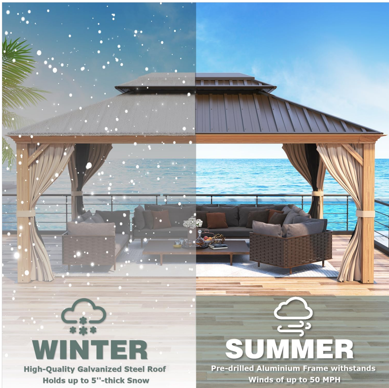
Figure 5: Gazebo in Winter and Summer Conditions