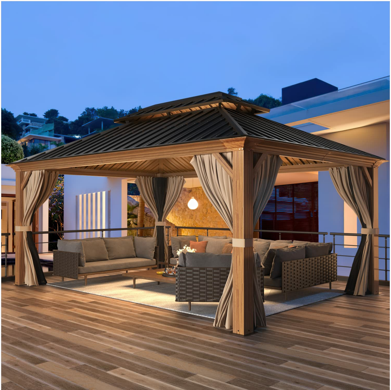
Figure 1: MELLCOM 12'x16' Hardtop Gazebo