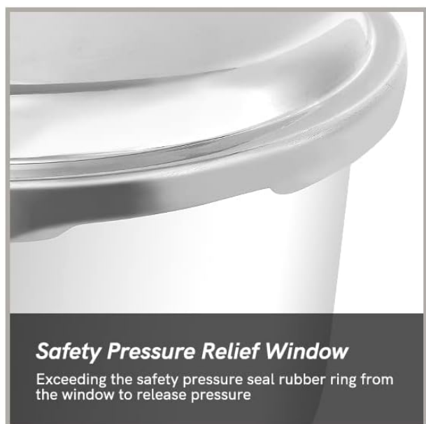
Image: Detailed view of BreeRainz 12 Quart Pressure Cooker safety features: heat-resistant handle, safety pressure limiting valve, anti-plug and anti-blocking cover, and safety pressure relief window.