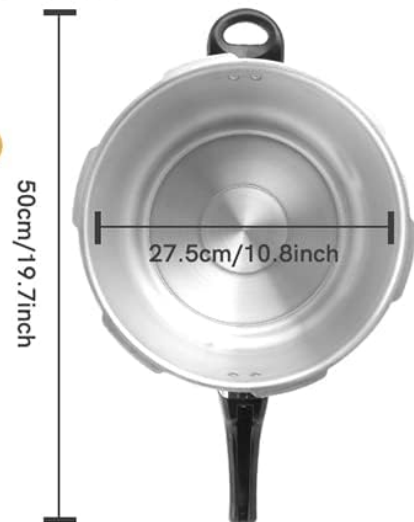
Image: Specifications and included items for the BreeRainz 12 Quart Pressure Cooker.