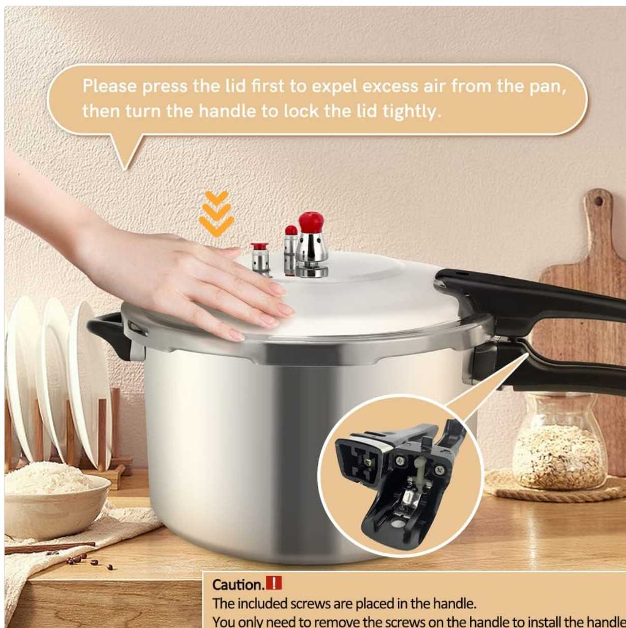
Image: Press the lid to expel excess air, then turn the handle to lock the lid tightly.