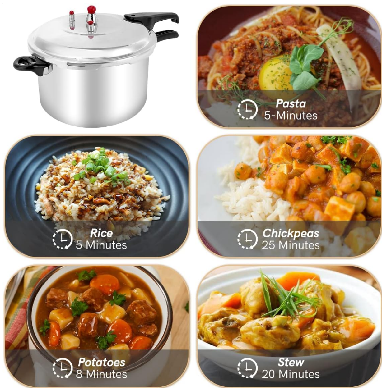
Image: Example cooking times for various foods in a pressure cooker.