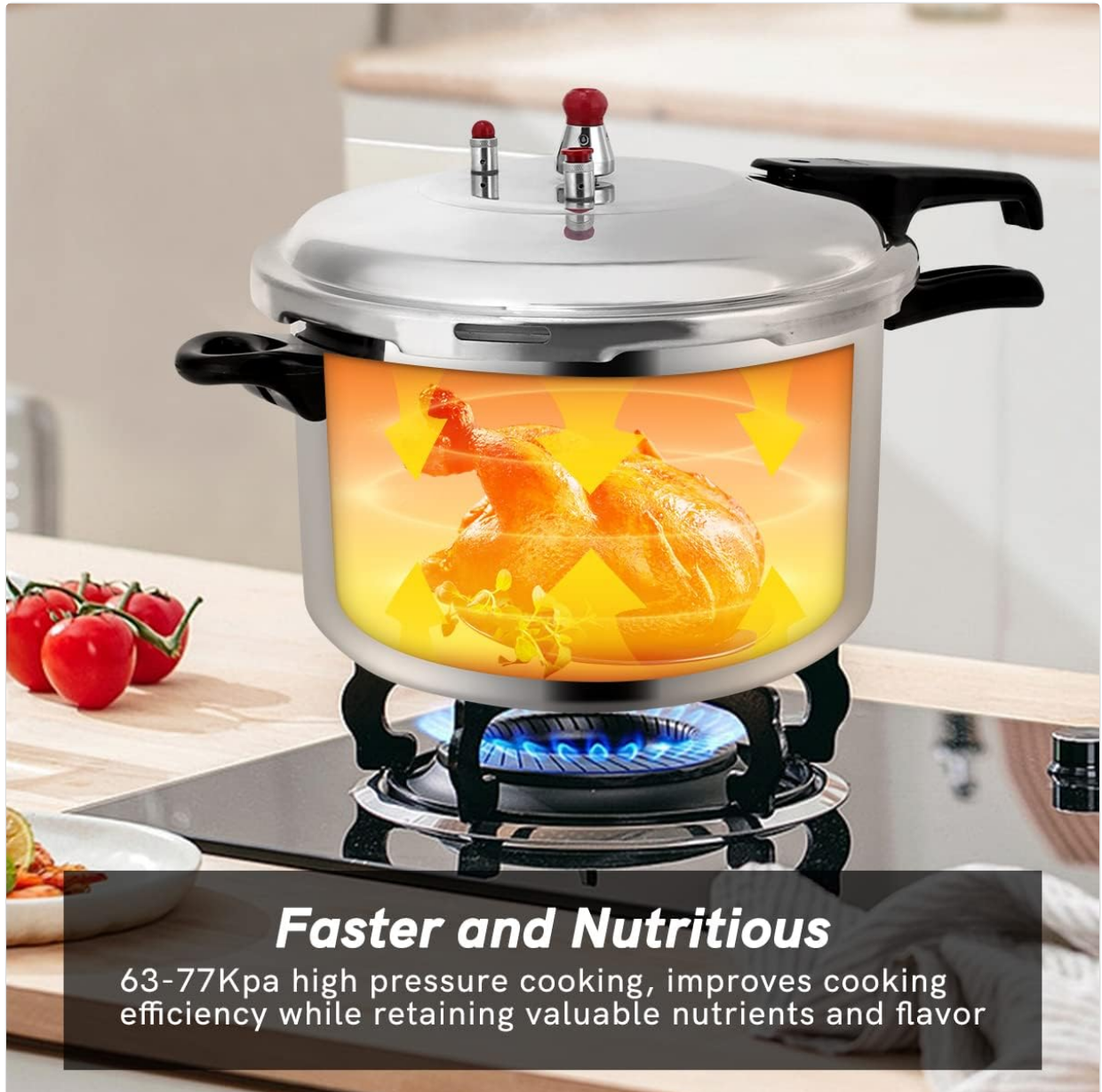
Image: BreeRainz 12 Quart Pressure Cooker on a stovetop, illustrating faster and nutritious cooking with 63-77 KPa high pressure.