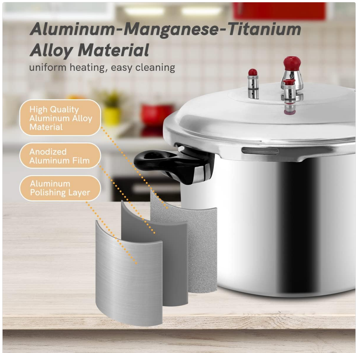
Image: BreeRainz 12 Quart Pressure Cooker construction showing aluminum-manganese-titanium alloy material layers for uniform heating and easy cleaning.

The pressure cooker is made of aluminum-manganese-titanium alloy, ensuring high rust resistance and durability. This material promotes uniform heating and is easy to clean.