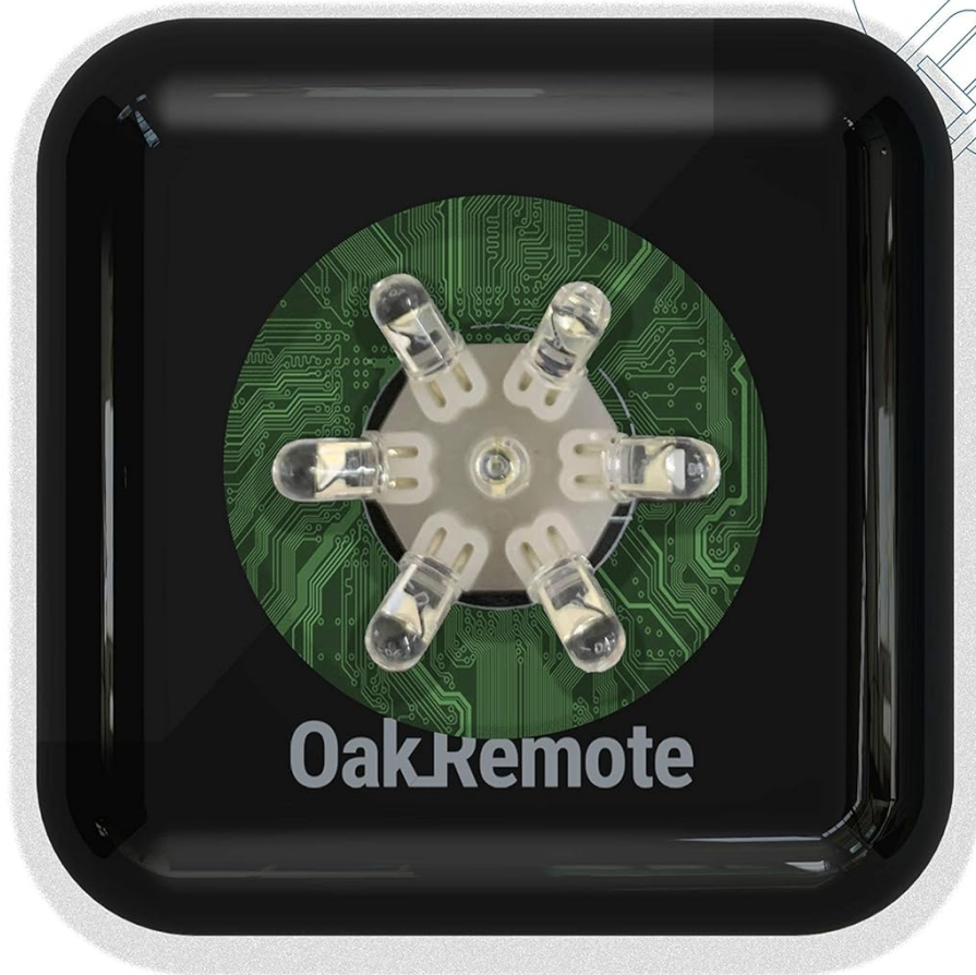
Image: The OakRemote device highlighting its 360-degree infrared coverage for comprehensive control.