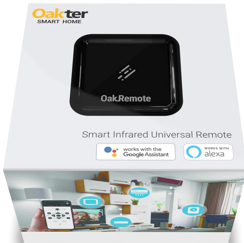
Image: The OakRemote device and its packaging, illustrating the product's appearance.