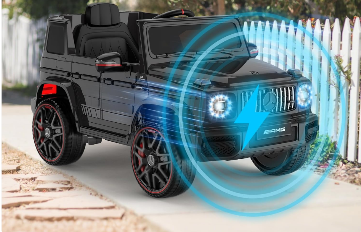
Image: An illustration showing the 12V 7Ah rechargeable battery and the car's speed range of 1.8-3.1 Mph, indicating power and performance.