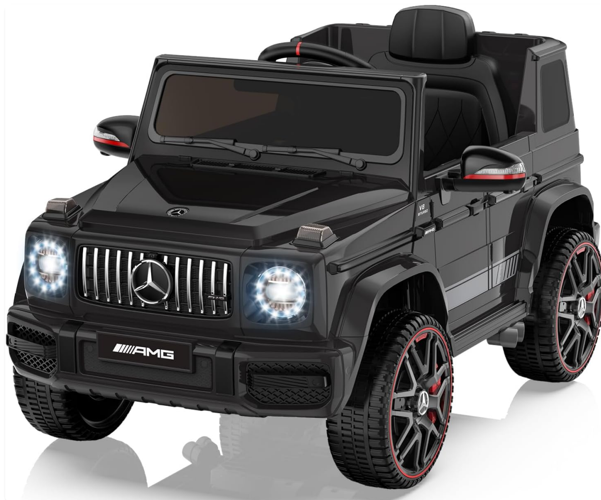
Image: Front view of the ANPABO Licensed Mercedes-Benz G63 Car, illustrating its design and features.

hour. Please follow the steps carefully.