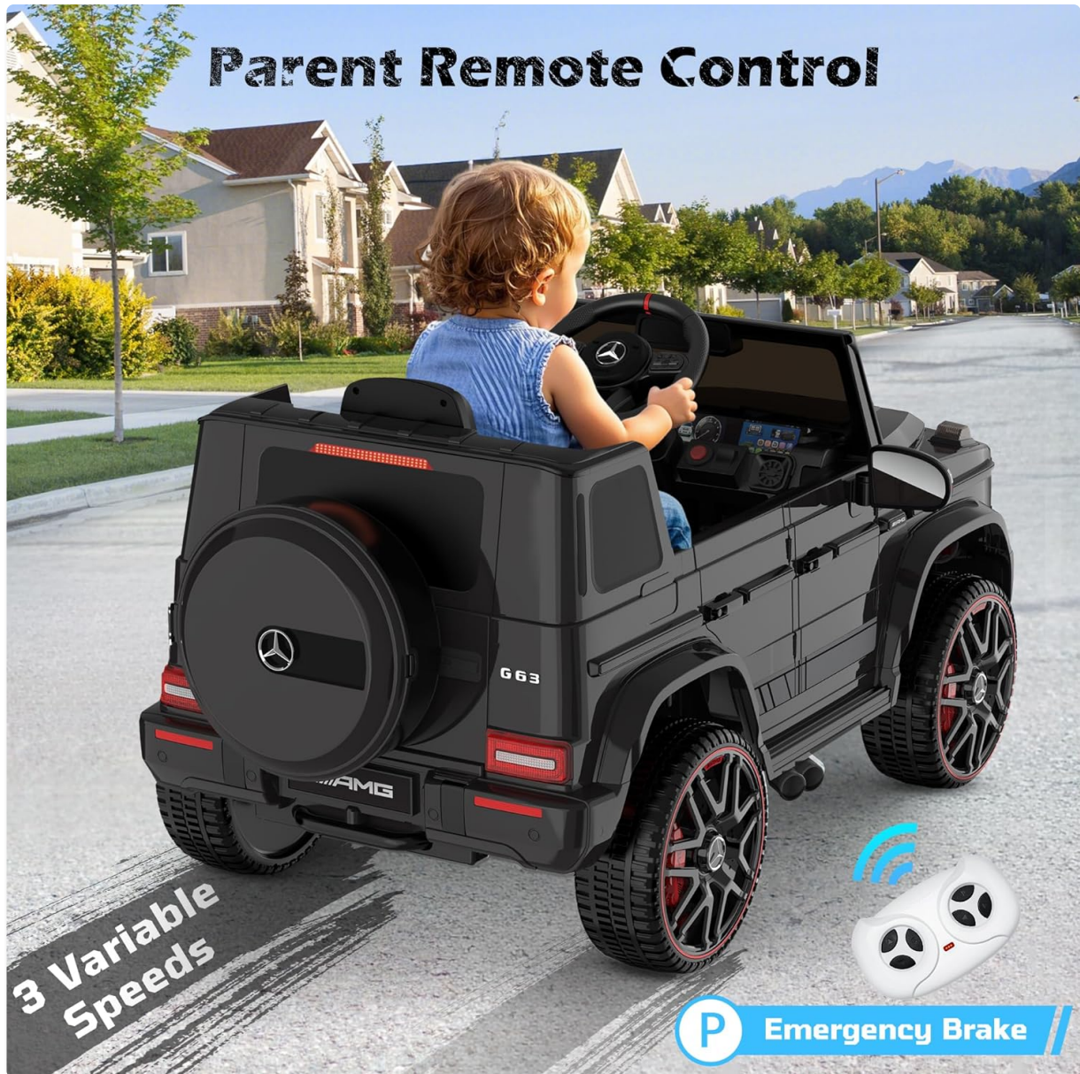
Image: A child seated in the ride-on car, with an illustration of the parent remote control and its functions, including variable speeds and emergency brake.