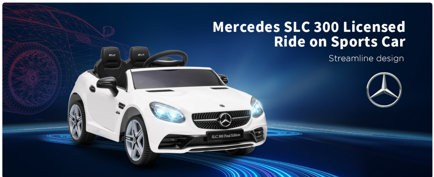
Image: The Aosom Mercedes SLC 300 Kids Electric Car, highlighting its streamlined design.

This instruction manual provides essential information for the safe and proper use of your Aosom Mercedes SLC 300 Licensed Kids Electric Car. Please read all instructions carefully before assembly and operation. Retain this manual for future reference.