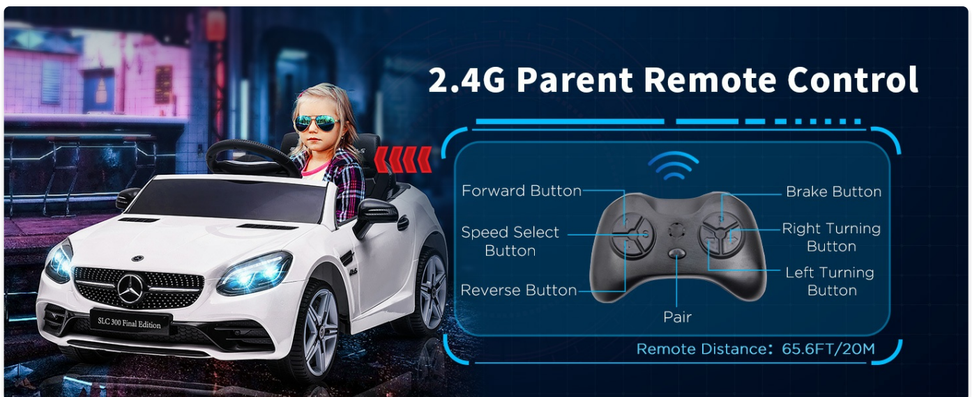
Image: The 2.4G parental remote control, detailing its functions for safe guidance.