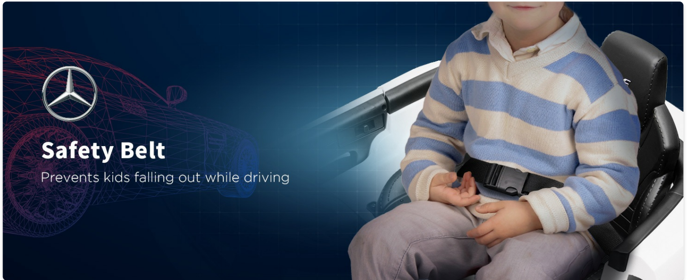
Image: A child properly secured with the safety belt in the electric car, emphasizing safety.