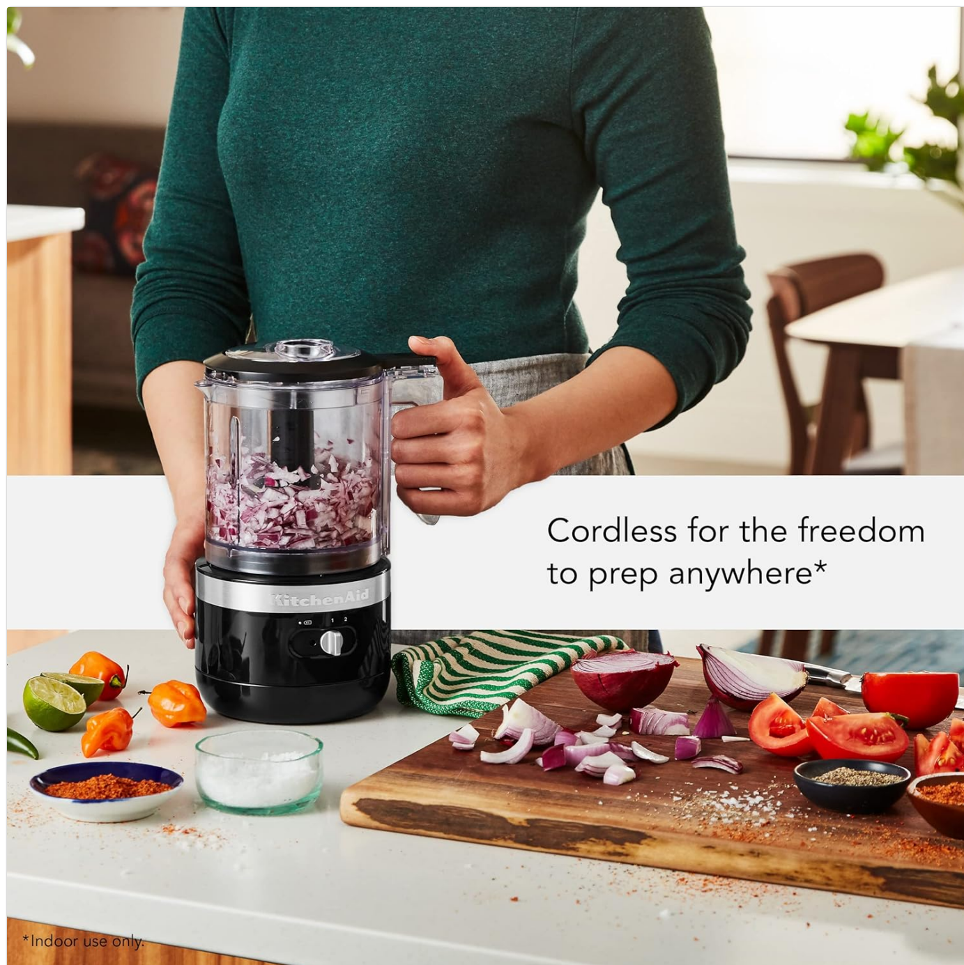
Image 3: A user operating the KitchenAid Cordless 5 Cup Food Chopper to chop onions, demonstrating its portability.

The KitchenAid Cordless 5 Cup Food Chopper features a simple control dial for operation.