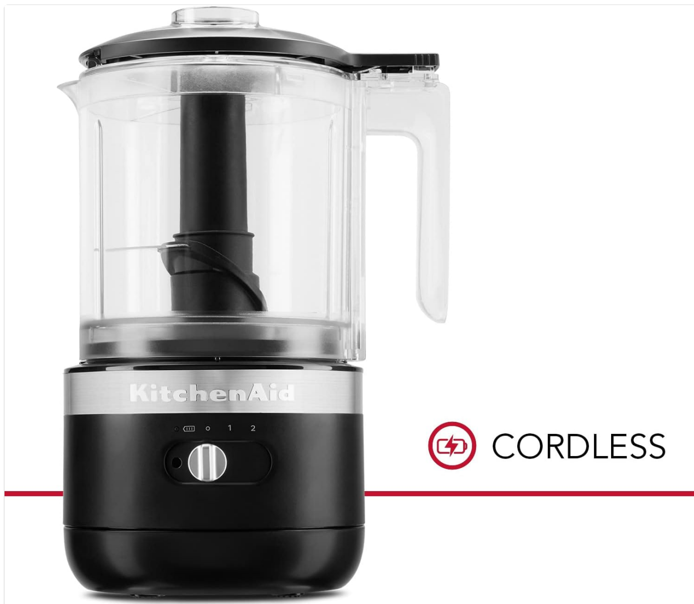
Image 2: Side view of the KitchenAid Cordless 5 Cup Food Chopper, highlighting its cordless design.