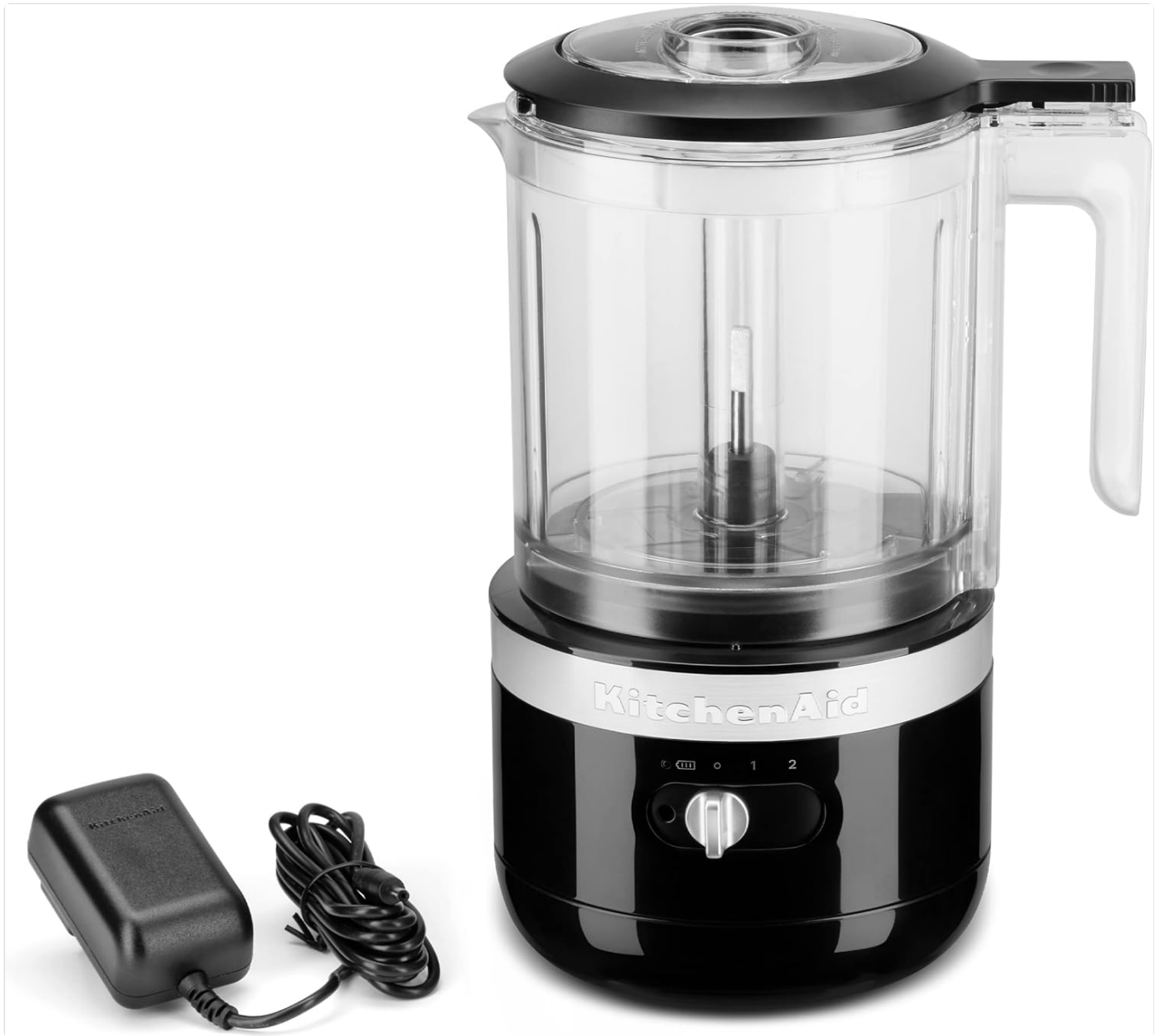
Image 1: The KitchenAid Cordless 5 Cup Food Chopper, showing the main unit, work bowl, lid, and the included charger.