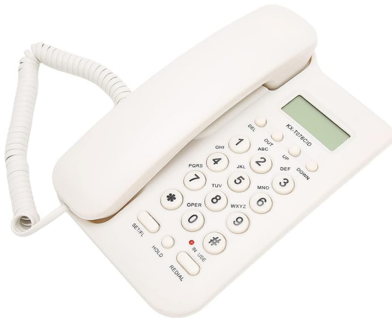
Figure 2: Telephone Unit Assembly. This image shows the main telephone unit with the handset connected via its coiled cord, positioned on a flat surface.

30 groups of 12 digits call storage function 10 groups of 12 digits number dialing and call time recording