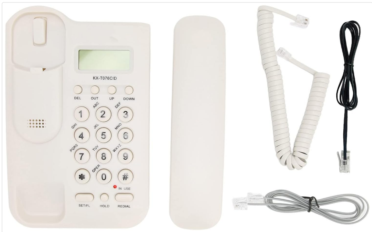
Figure 1: Package Contents. The image displays the main telephone unit, the handset, a coiled cord connecting the handset to the base, and two separate telephone line cords.