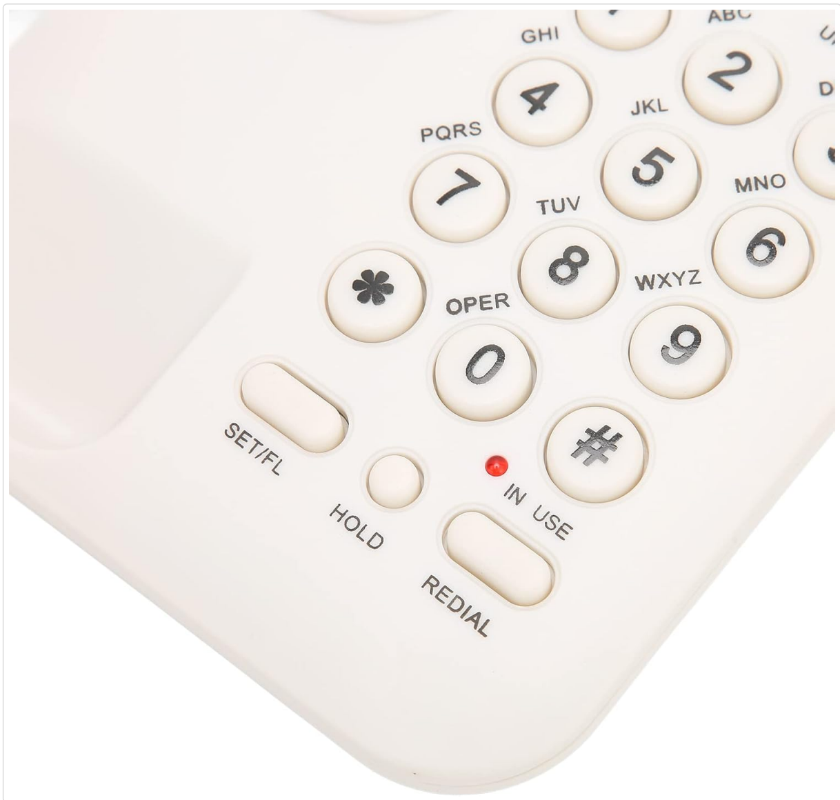
Figure 3: Keypad Layout. This image provides a detailed view of the telephone's keypad, showing all numerical and function buttons.