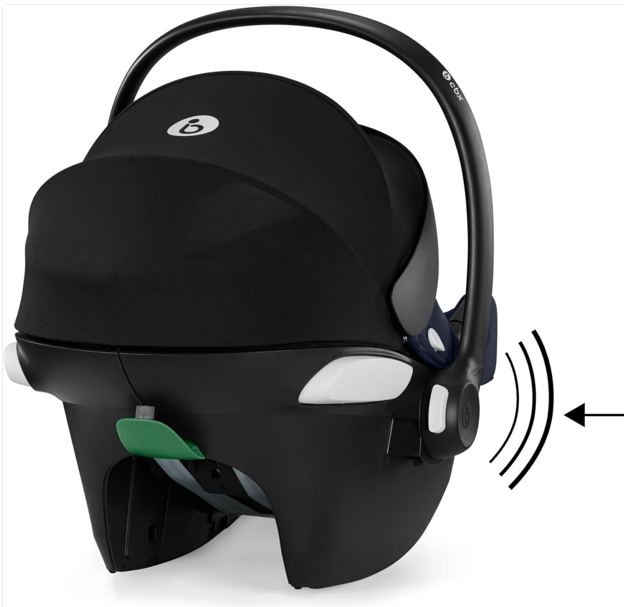
Image: Close-up of the car seat's side, indicating the location and function of the Linear Side-impact Protection (L.S.P.) system.