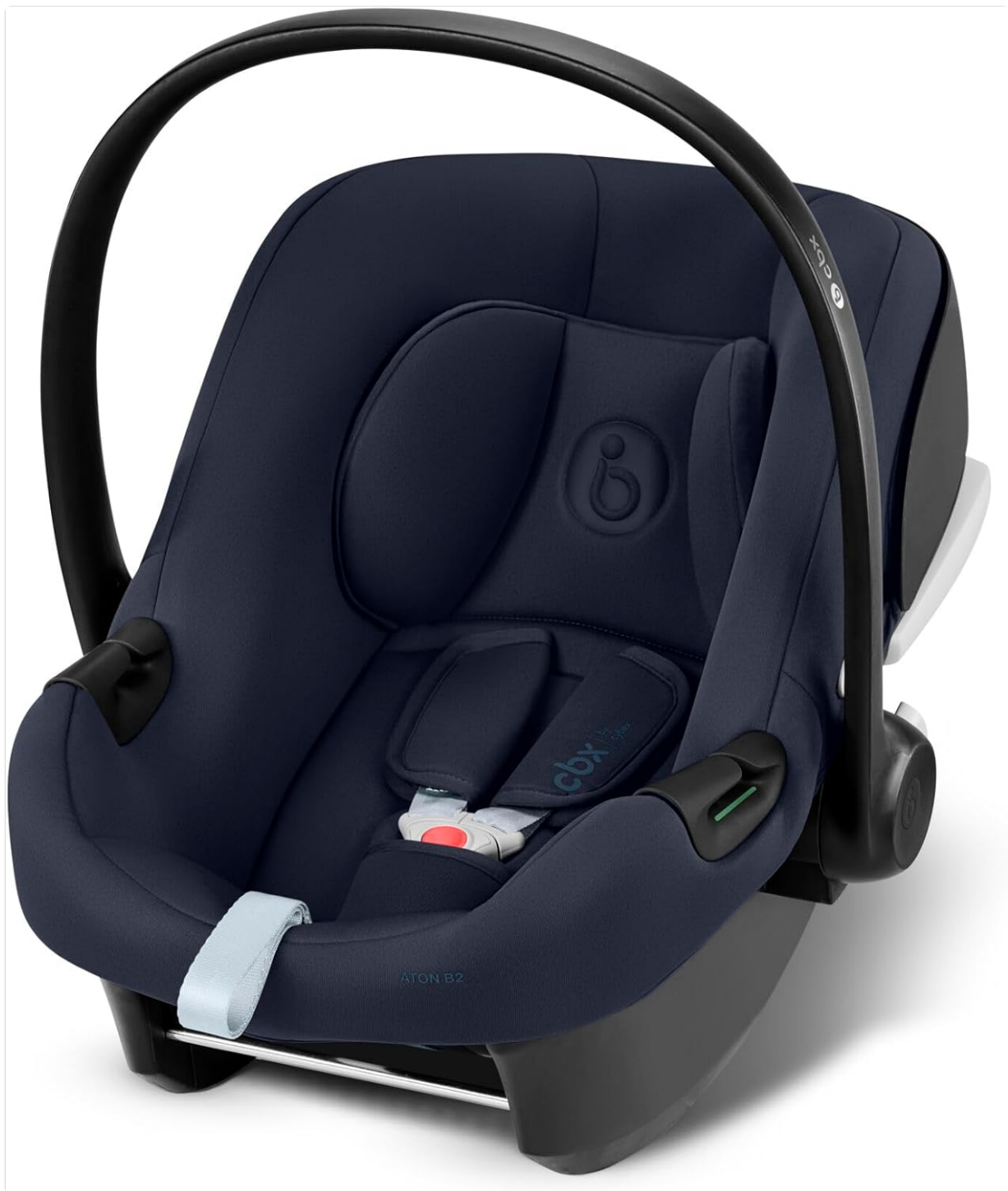
Image: The CYBEX Aton B2 i-Size infant car seat in Bay Blue, featuring its ergonomic design and integrated harness system.