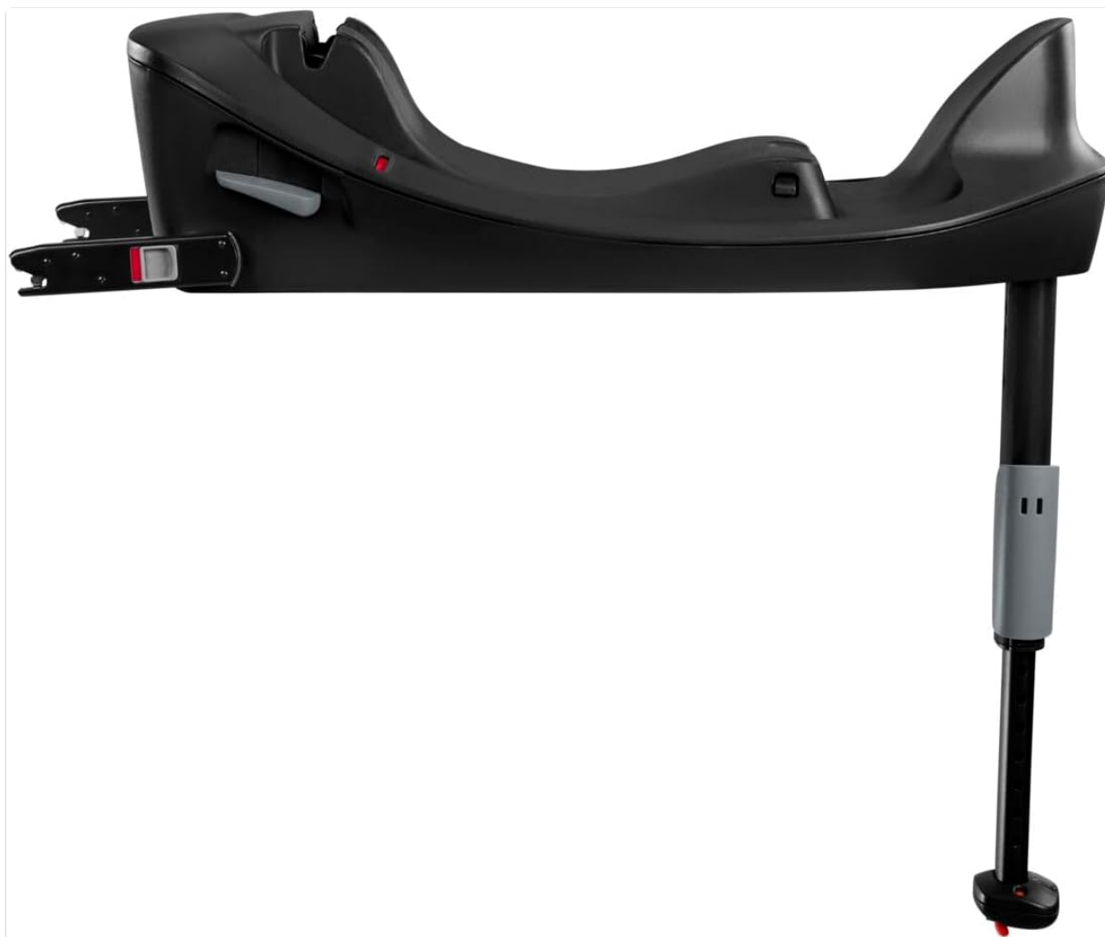
Image: Front view of the Base One, highlighting the ISOFIX connectors and the adjustable support leg.