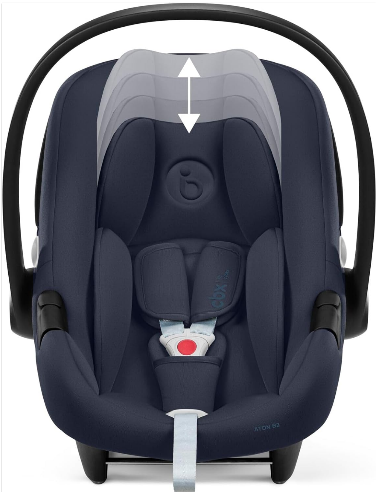
Image: Illustration showing the vertical adjustment of the headrest and integrated harness system.

To adjust, locate the adjustment lever at the back of the headrest. Squeeze the lever and slide the headrest up or down to the desired height. Release the lever to lock it in place. The harness will automatically adjust with the headrest.