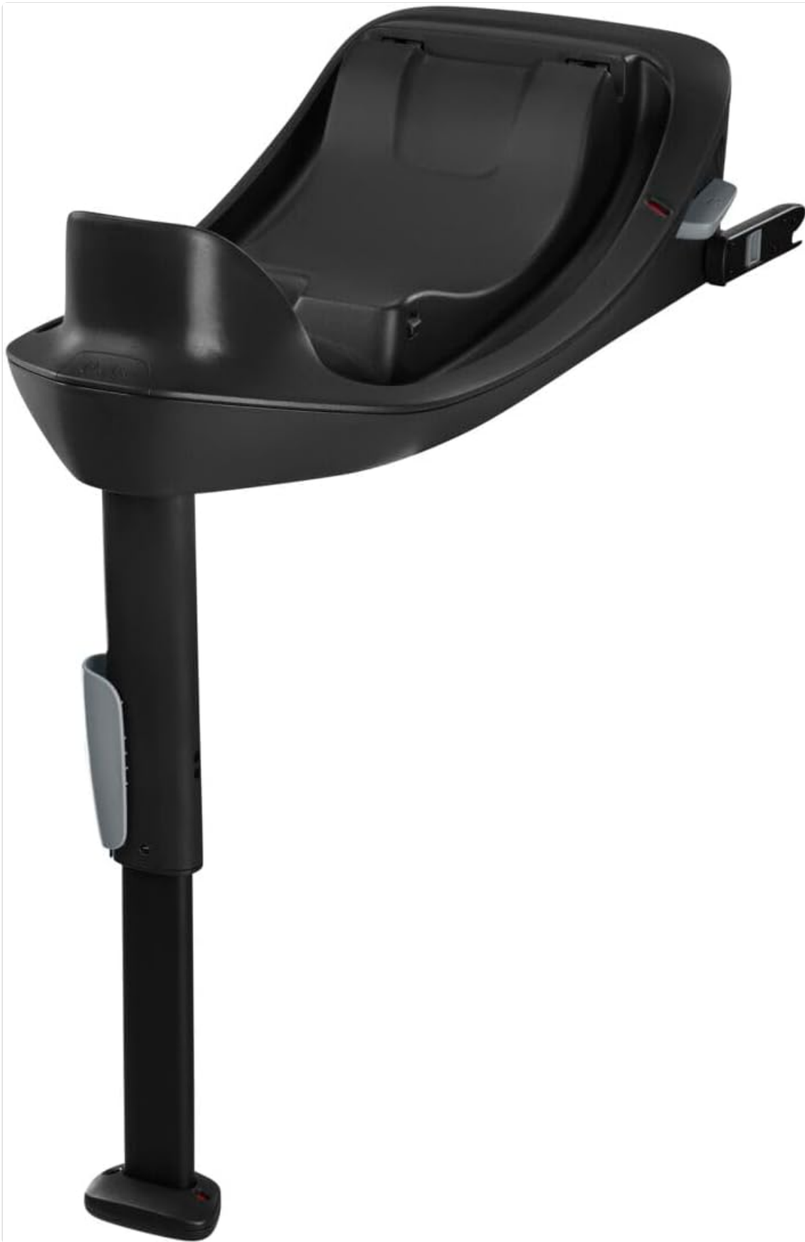
Image: The Base One ISOFIX, showing its adjustable support leg and ISOFIX connectors for secure vehicle installation.