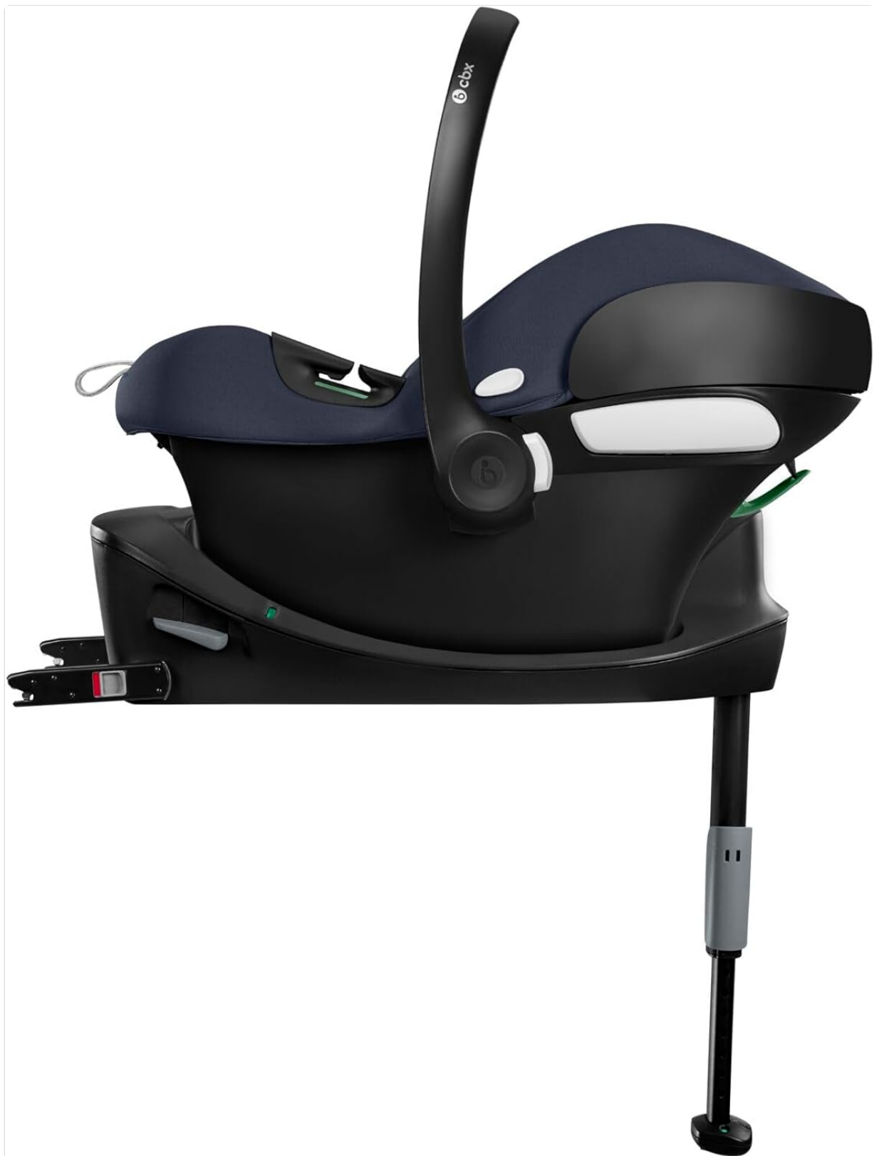
Image: The Aton B2 i-Size car seat securely attached to the Base One, demonstrating the combined unit's profile.