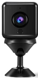
The Ebarsenc 4K UHD WiFi Wireless Mini Camera, showcasing its compact size and design.