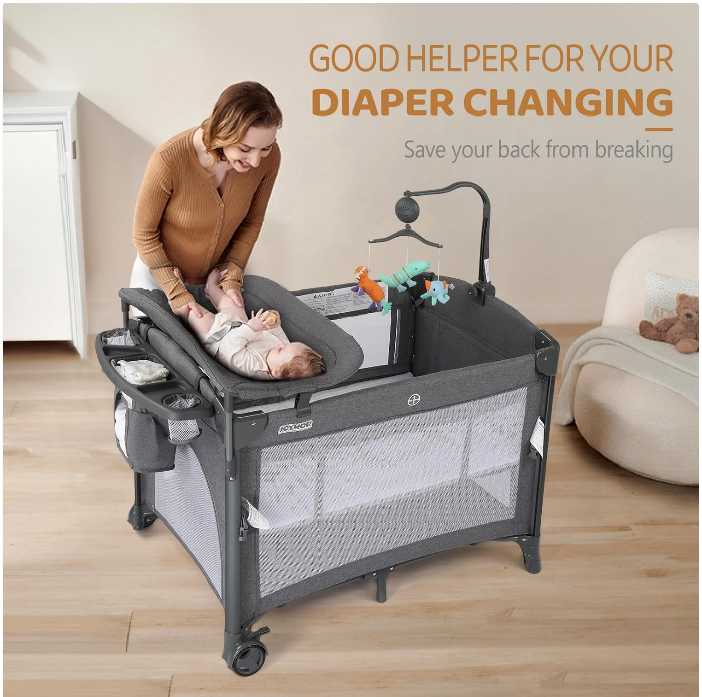
Figure 7: Changing Table in Use

This image shows a parent using the detachable changing table feature, with a baby lying on it. The changing table is positioned conveniently on top of the playard.