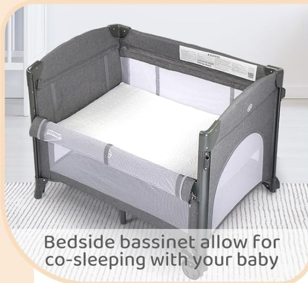
Bedside bassinet allow for co-sleeping with your baby