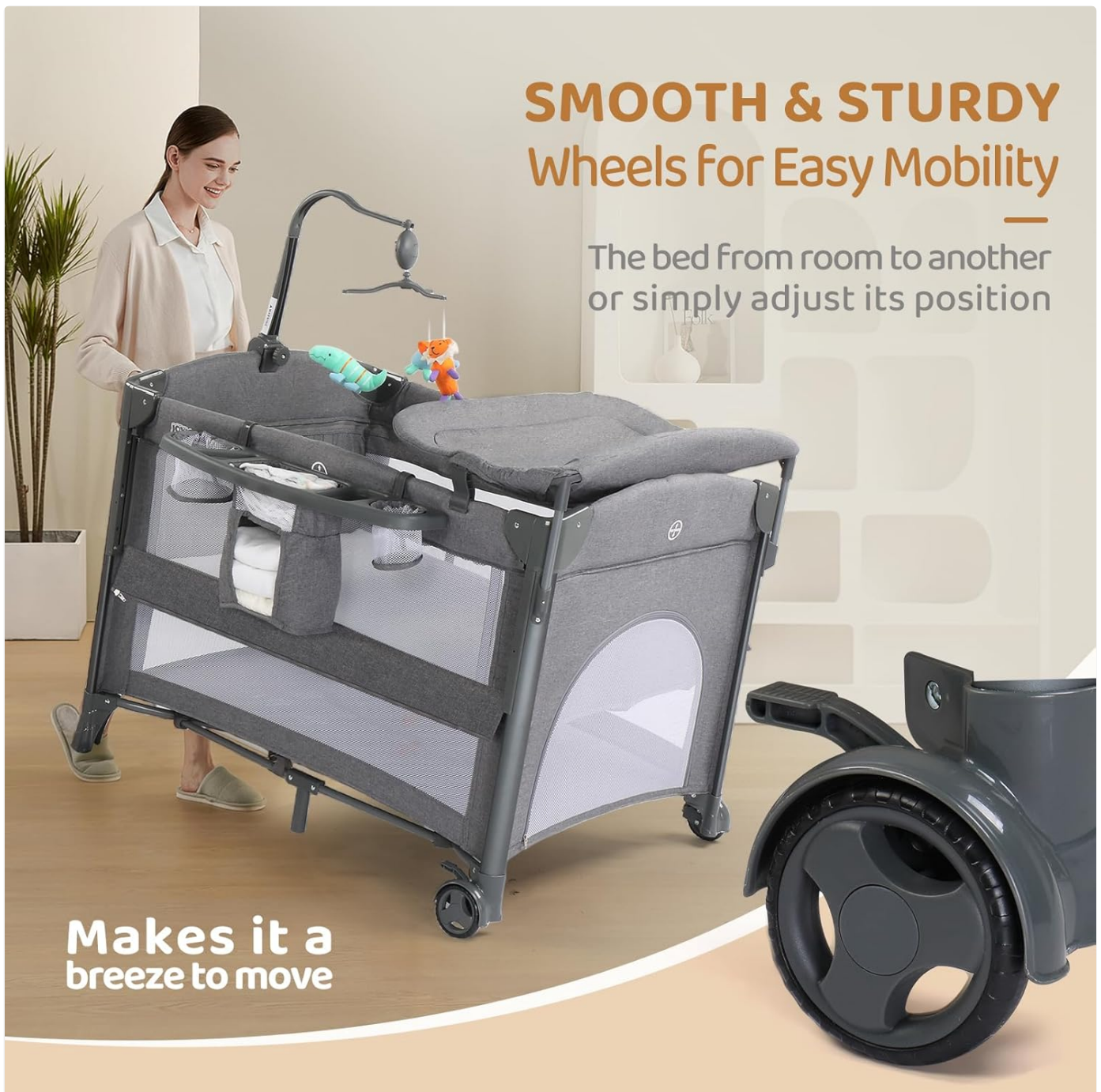
Figure 9: Wheels for Mobility

This image highlights the smooth and sturdy wheels of the playard, demonstrating how a parent can easily move the unit from one room to another.