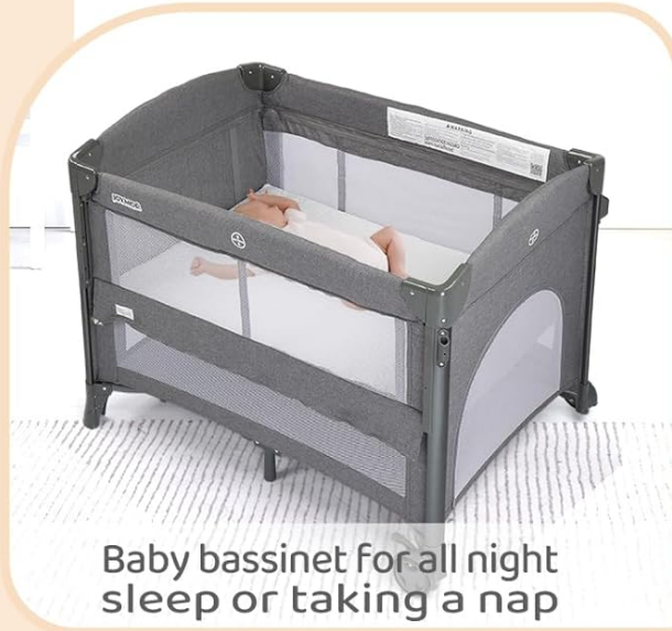
Baby bassinet for all night sleep or taking a nap