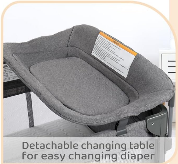
Detachable changing table for easy changing diaper