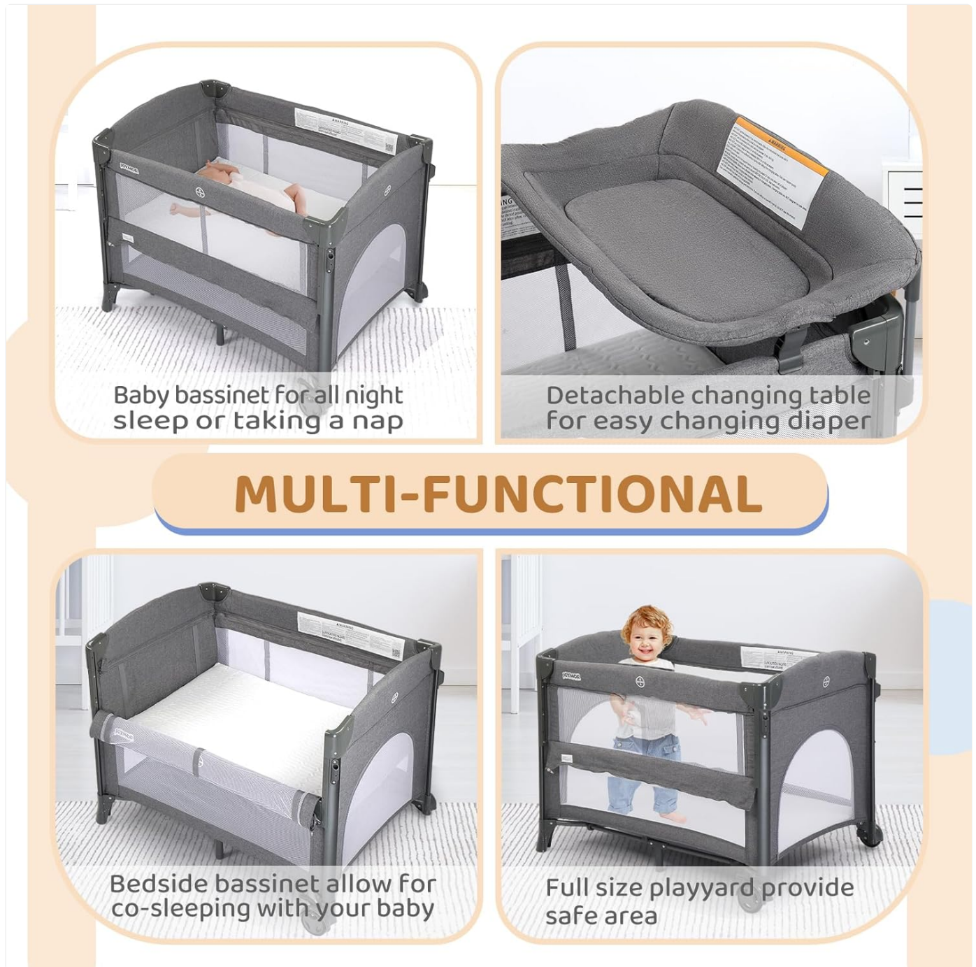
Figure 5: Bassinet Mode

This image displays the bassinet mode, showing an infant sleeping comfortably within the elevated bassinet insert, suitable for newborns.