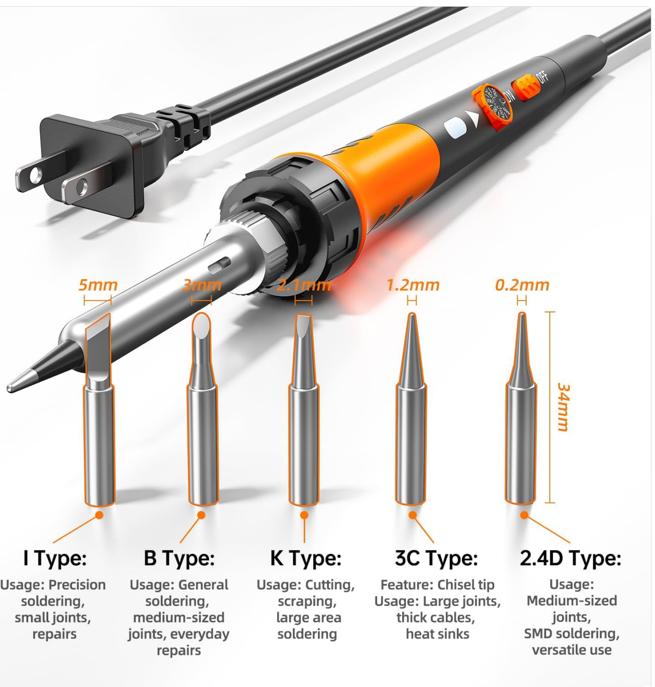
Figure 3: Different types of soldering tips for various applications

Your browser does not support the video tag.