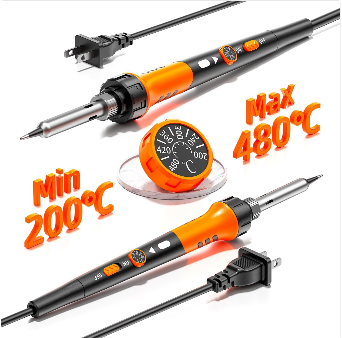
Figure 4: Temperature adjustment knob and range