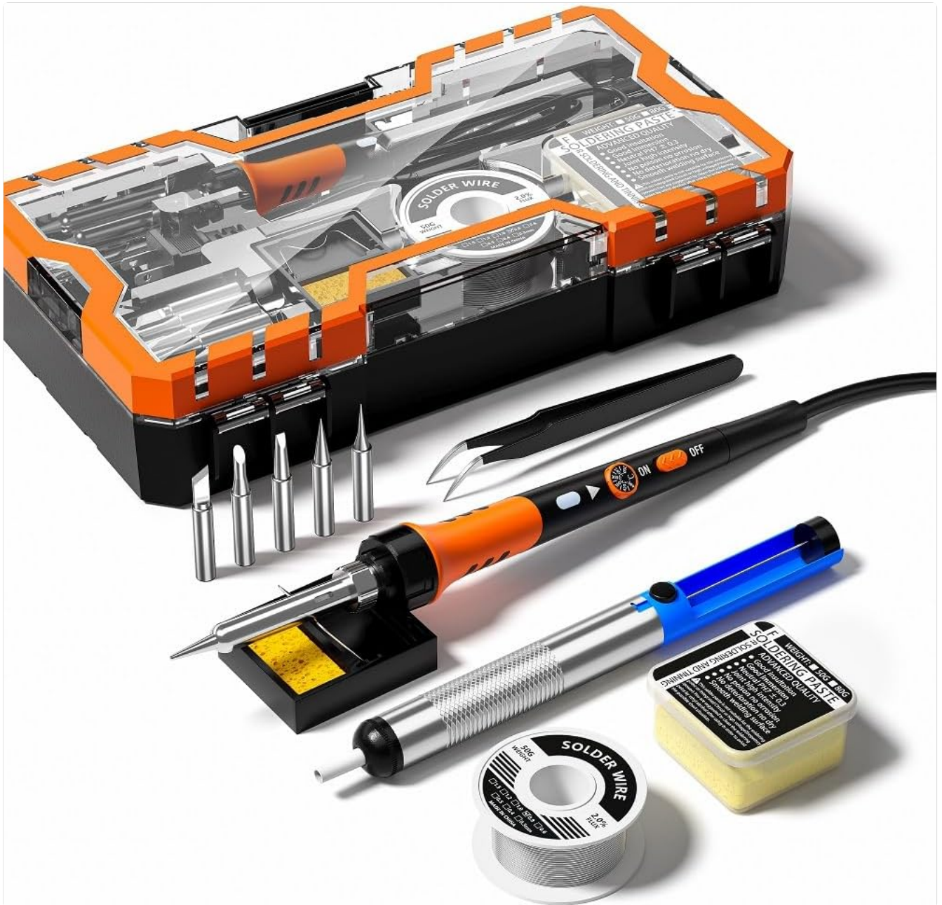
Figure 1: Complete MEAKEST Soldering Iron Premium Kit