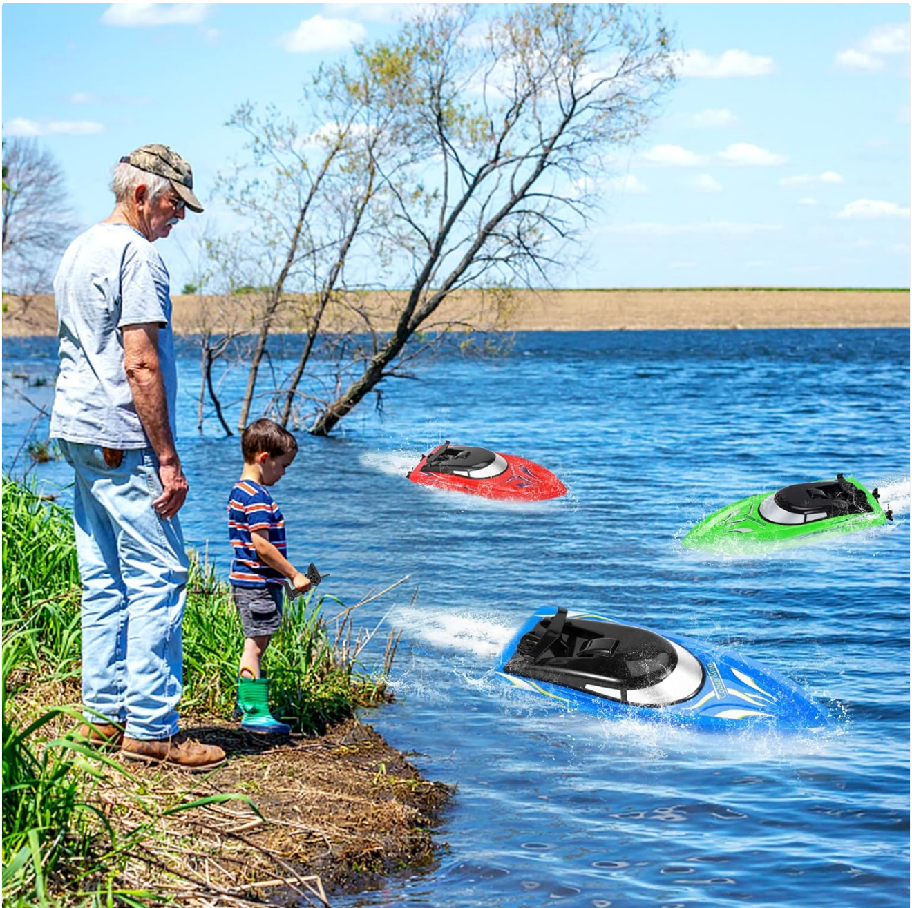
An adult and a child enjoying the RC boats in a natural water setting, demonstrating the product's appeal for various age groups.