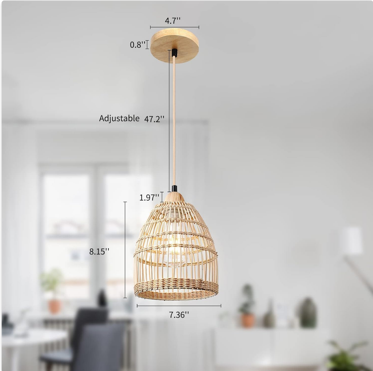
Image: Product dimensions for planning installation.

Video: Official product video demonstrating the Rattan Handwoven Pendant Light. This video showcases the light's design and how it appears in various settings, providing a visual guide to its aesthetic and potential applications.