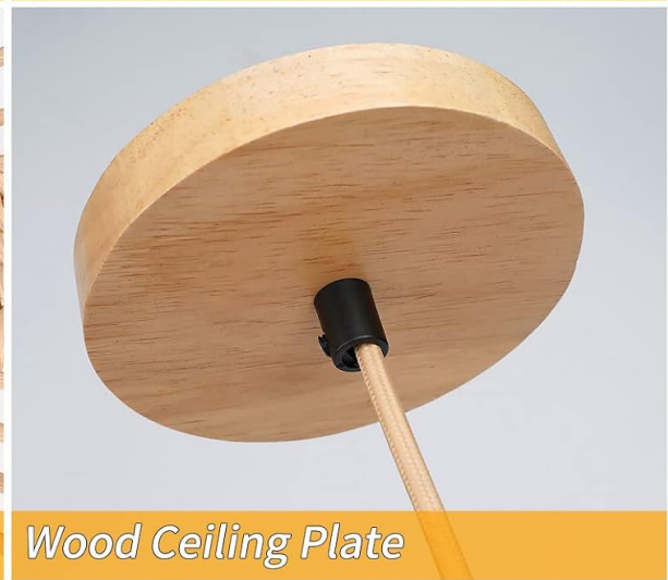
Wood Ceiling Plate

Image: Detailed view of the pendant light's components and craftsmanship.