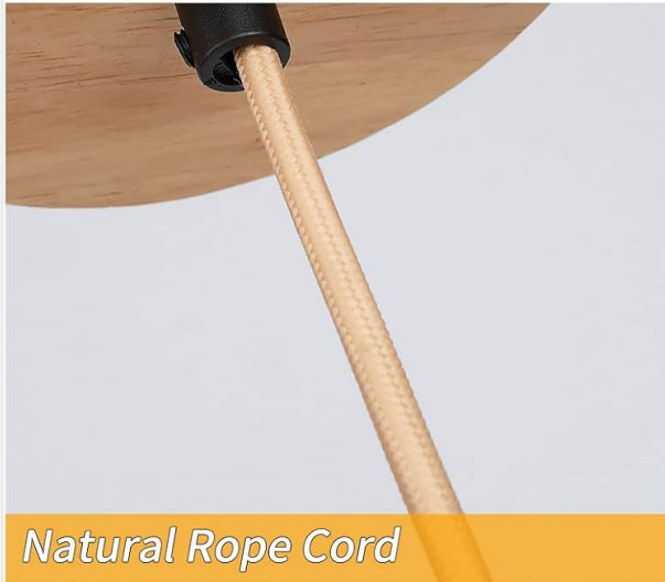
Natural Rope Cord