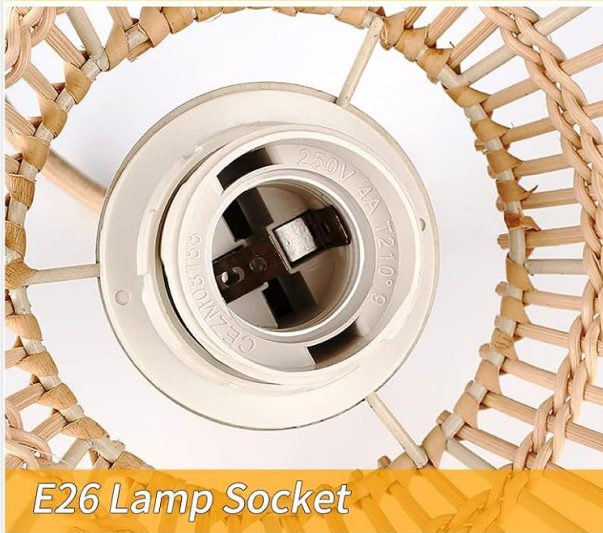
E26 Lamp Socket