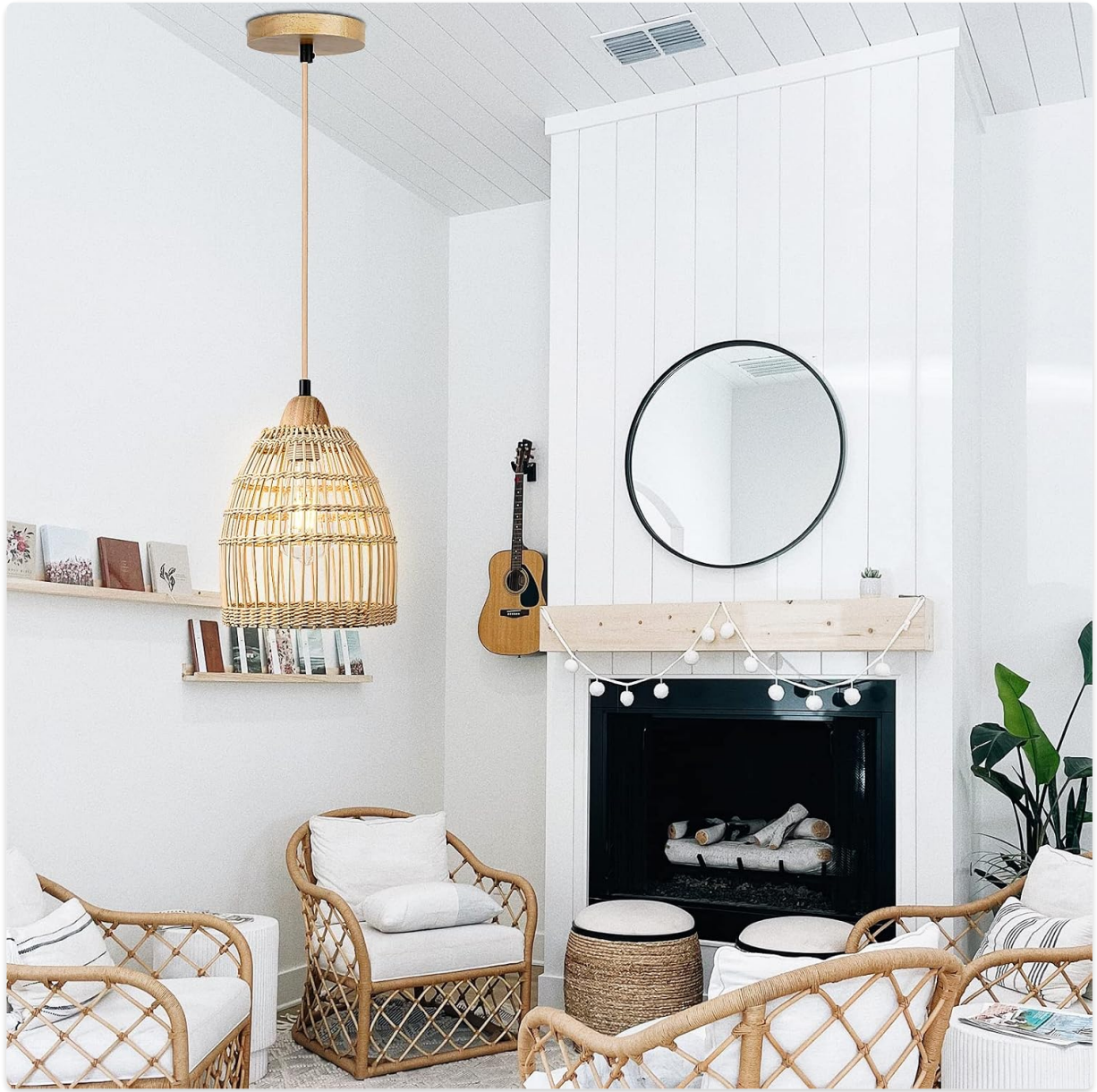
Image: FRIDEKO HOME Rattan Pendant Light Fixture installed in a living room setting.

This hand-woven rattan pendant light is designed to provide both targeted and ambient light, creating a warm and inviting atmosphere. Its natural bamboo and wicker construction makes it a versatile addition to various interior styles, including farmhouse, bohemian, coastal, and minimalist.