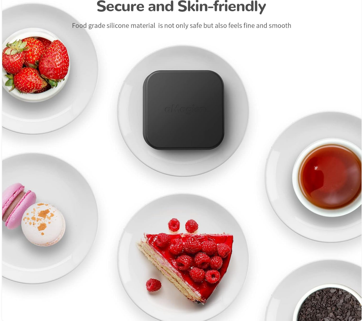
Figure 3.5: The material is safe and pleasant to touch.

Food grade silicone material is not only safe but also feels fine and smooth