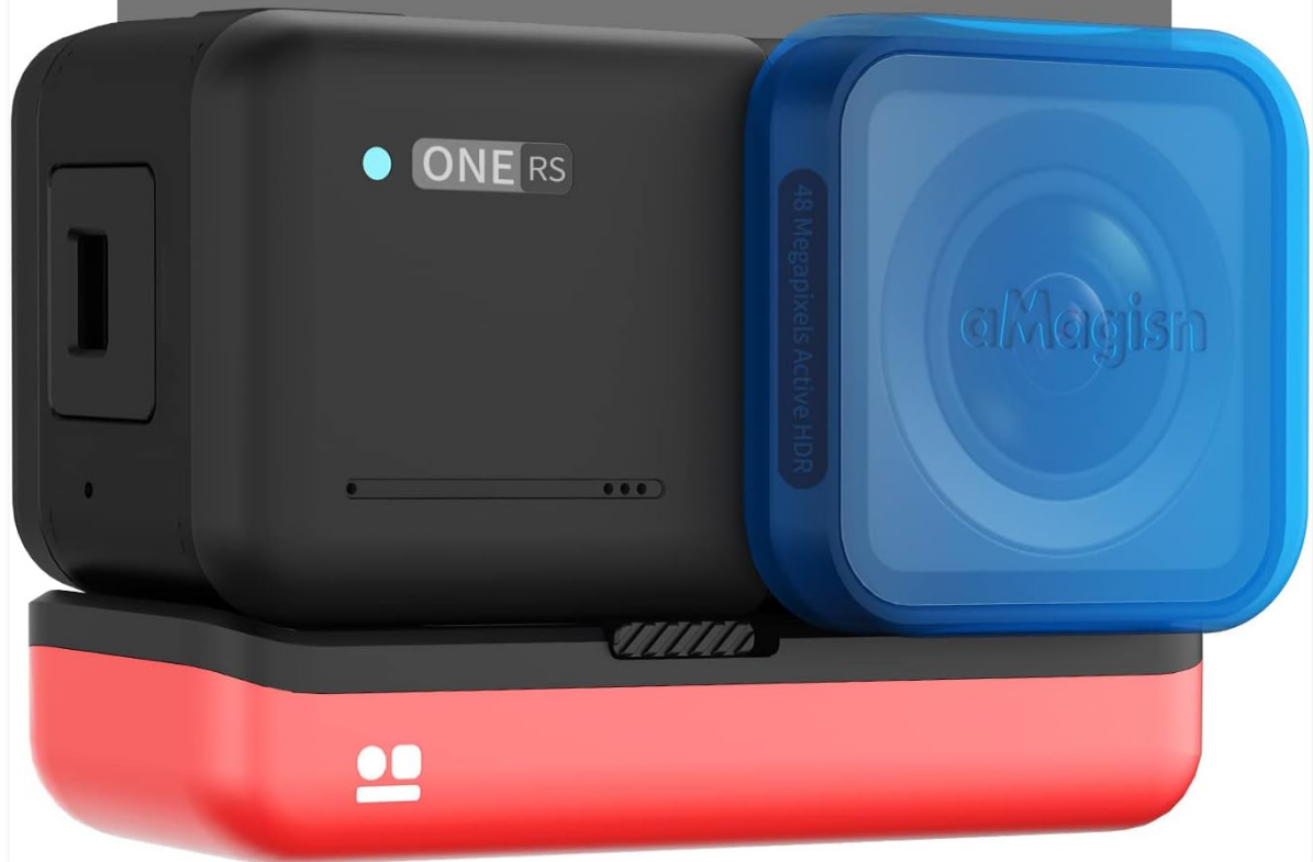
Figure 3.3: The cover is designed for a precise and secure fit.

Modeled on real machine with precise size, the lens cap can fully and tightly wrap the lens without dust entry and provide all around protection for your lens.