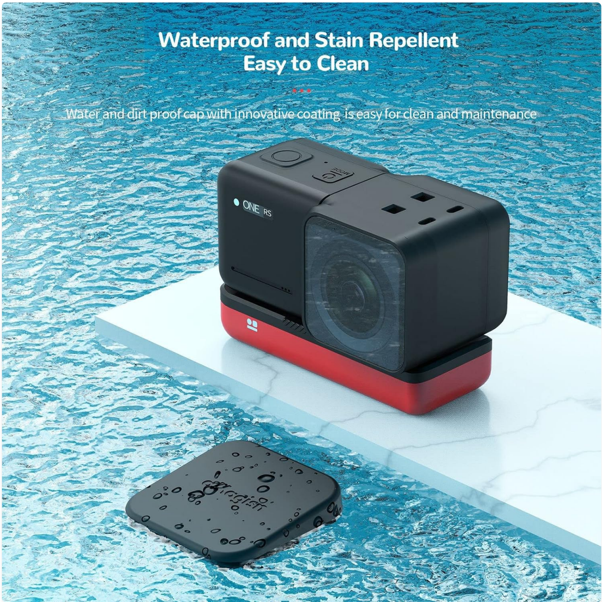
Figure 3.2: The cover's surface is designed to resist water and stains.

Water and dirt proof cap with innovative coating is easy for clean and maintenance