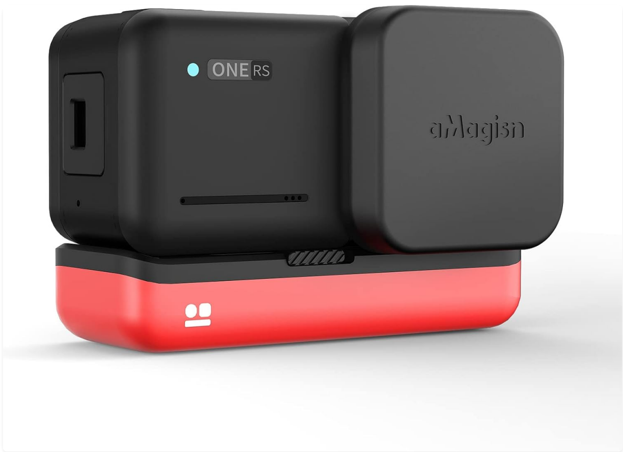
Figure 2.1: The aMagis lens cover securely fitted onto the Insta360 ONE RS 4K Boost Lens.