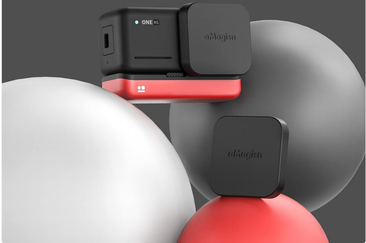
Figure 3.1: The silicone material provides robust protection against impacts.

Insta360 ONE RS Silicone Lens Cap for 4K Boost Lens