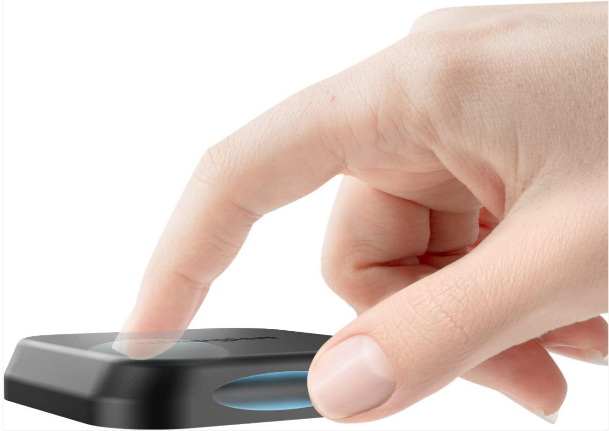
Figure 4.1: The groove design aids in easy mounting and dismounting.

Groove design of the upper and down side of the lens cap allows for user friendly mounting and dismounting, which makes the finger operation more flexible