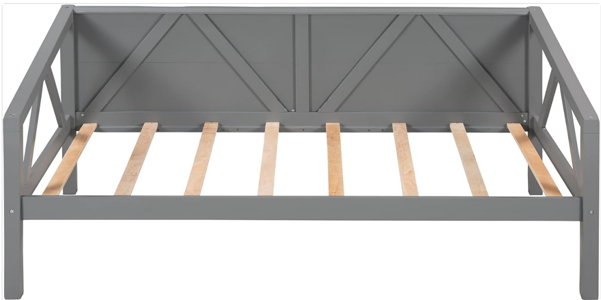
Image: Front view of the daybed frame, highlighting the back panel and side rails.