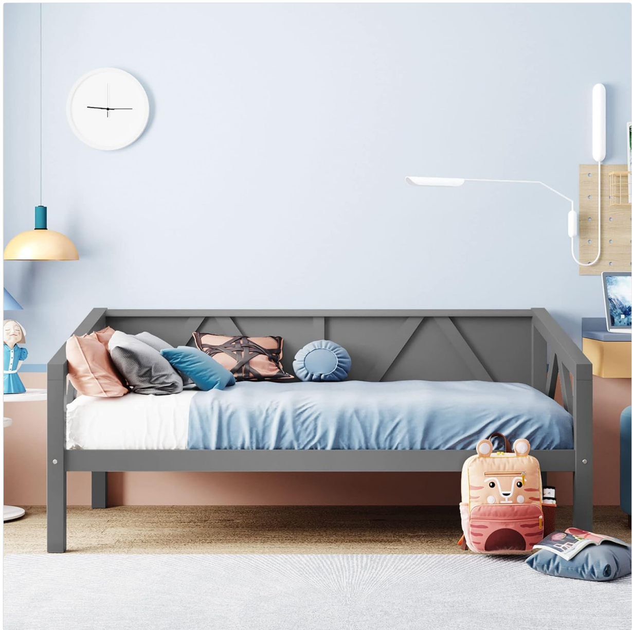
Image: The daybed configured with a mattress and bedding, demonstrating its use as a sleeping area.