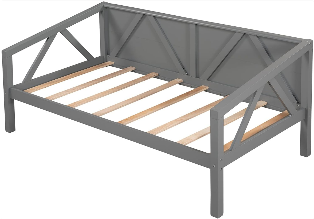
Image: Angled view of the daybed frame after initial assembly, showing the slat supports.