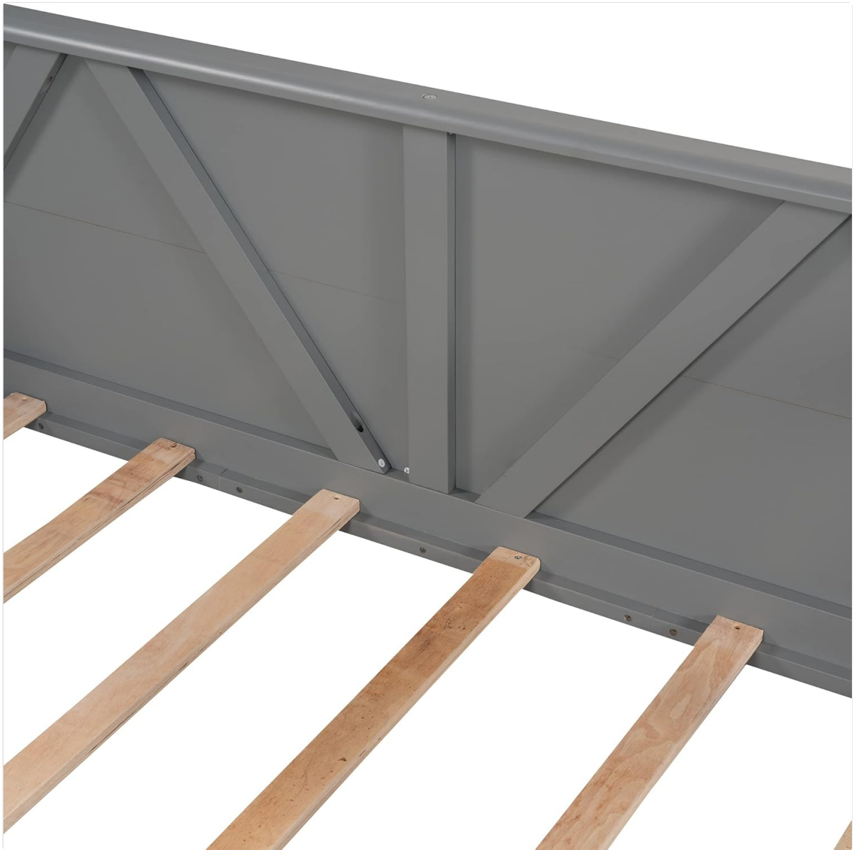
Image: Close-up view of the wooden slats and the connection points to the back panel, illustrating the slat support system.