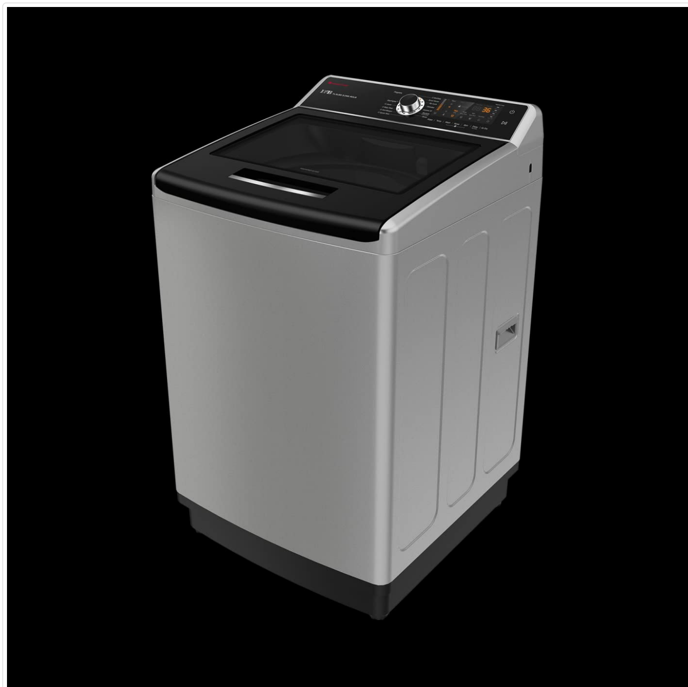
Image: Top view of the washing machine with the lid open, revealing the stainless steel drum where laundry is loaded.