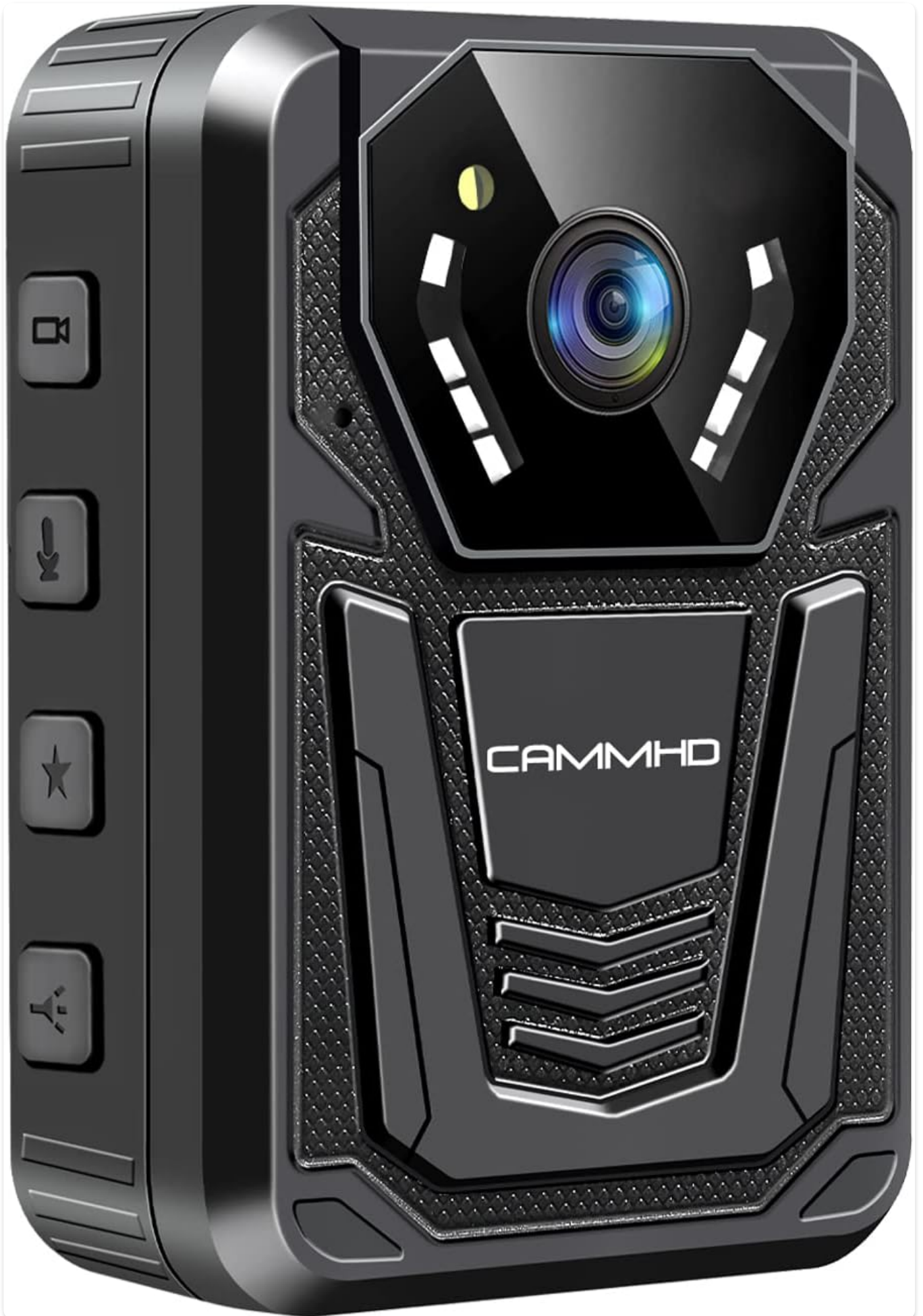
Front view of the CAMMHD F6 4K Body Camera, showcasing its compact design and lens array.