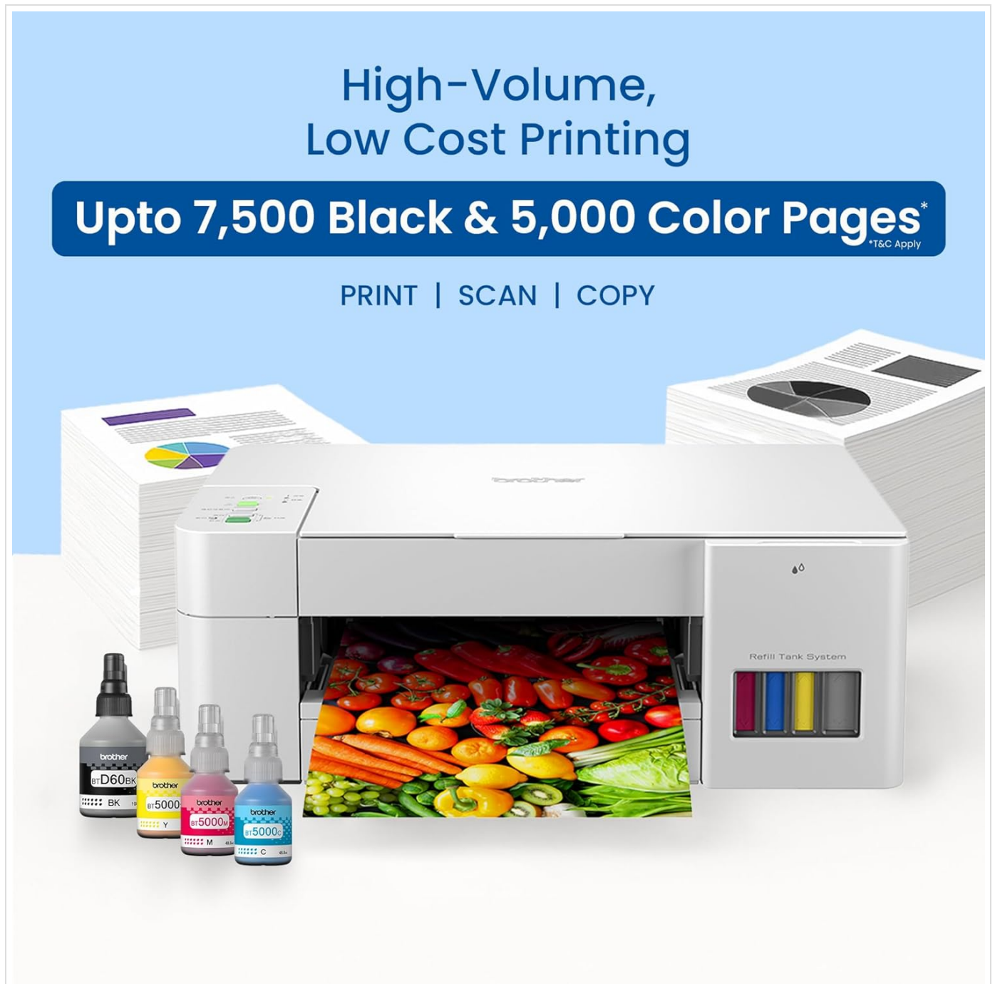
Image: The Brother DCP-T426W printer actively printing documents, demonstrating its high-volume, low-cost printing capability.