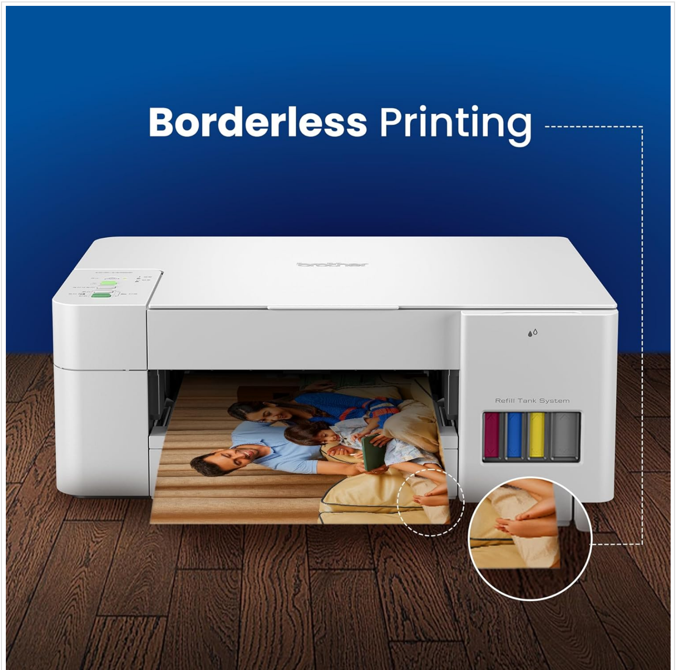
Image: Close-up view of the Brother DCP-T426W's refillable ink tank system, showing the four color tanks and ink bottles.