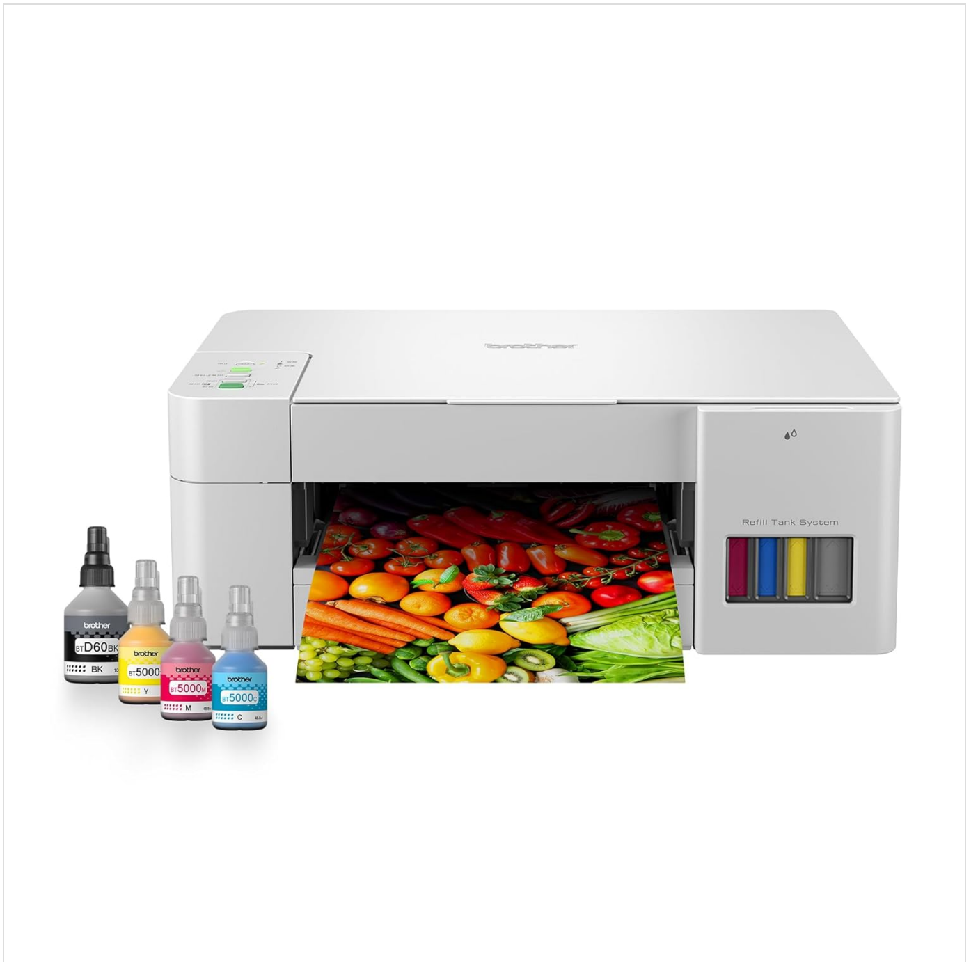
Image: The Brother DCP-T426W printer shown with its accompanying ink bottles, illustrating the refillable ink tank system.