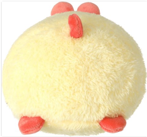
Figure 2: Back view of the plush toy. The back view of the plush toy, illustrating its rounded shape and soft texture, with small red accents visible.