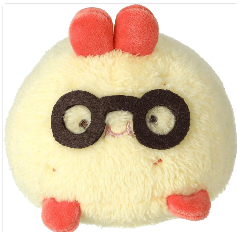
Figure 1: Front view of the plush toy. This image shows the front of the plush toy, highlighting its unique fried shrimp design with large, round, dark-rimmed eyes and a soft, yellow, textured body.