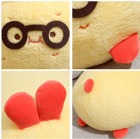
Figure 3: Close-up details. A collage of close-up images showing the toy's facial features, the soft fabric texture, and the small red appendages, emphasizing the quality of materials and stitching.