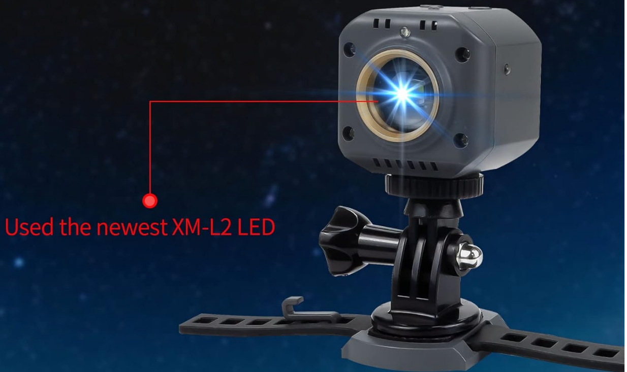
Figure 5.1: Direct installation method using the rubber strap.