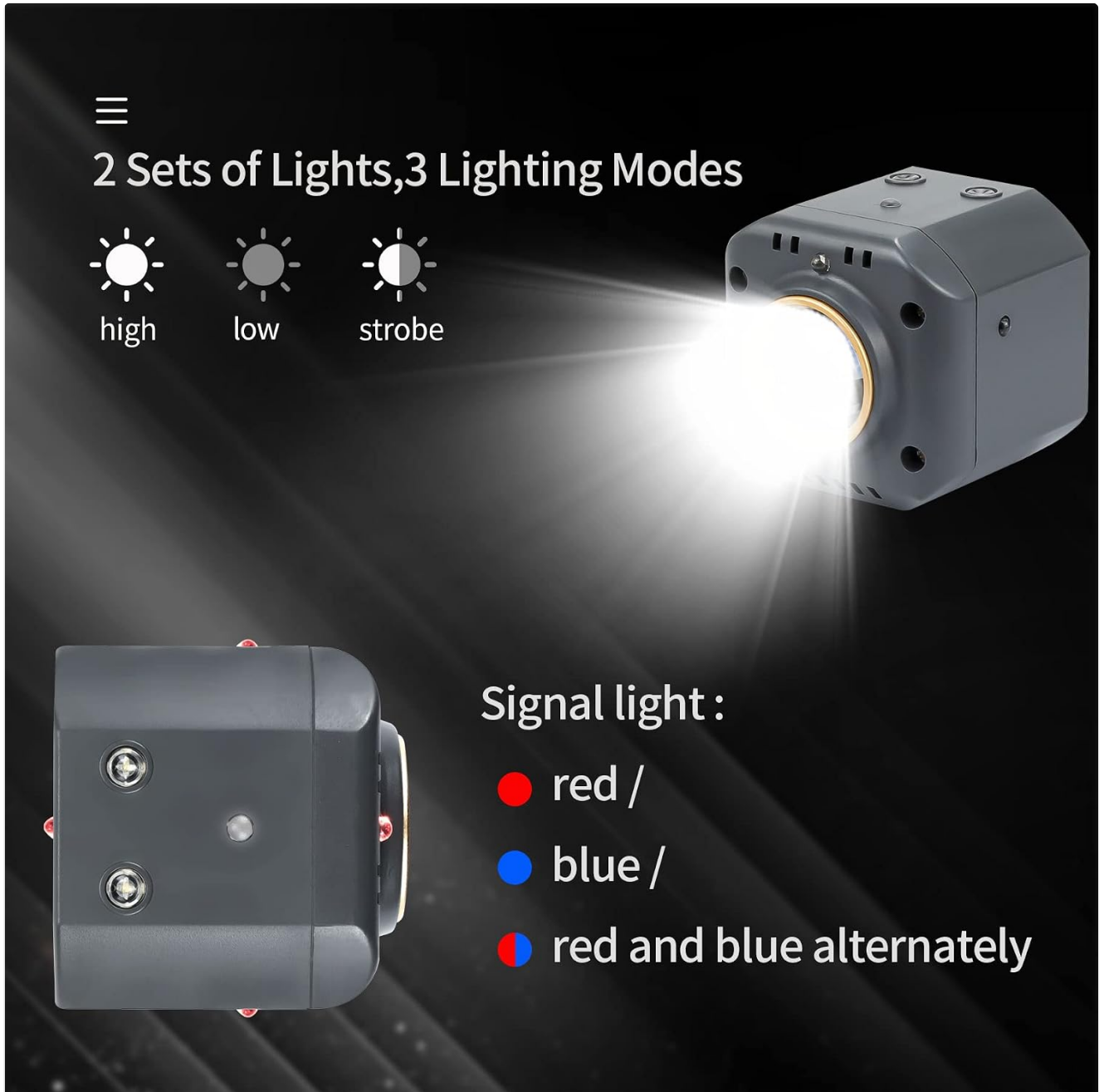
Figure 6.1: Illustration of the main searchlight and signal light modes.

To cycle through these modes, press the signal light button located on the device.