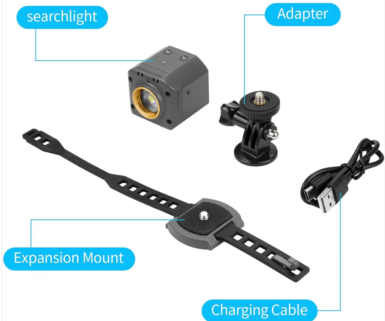
Figure 2.1: Included components: Searchlight, Adapter, Expansion Mount, and Charging Cable.