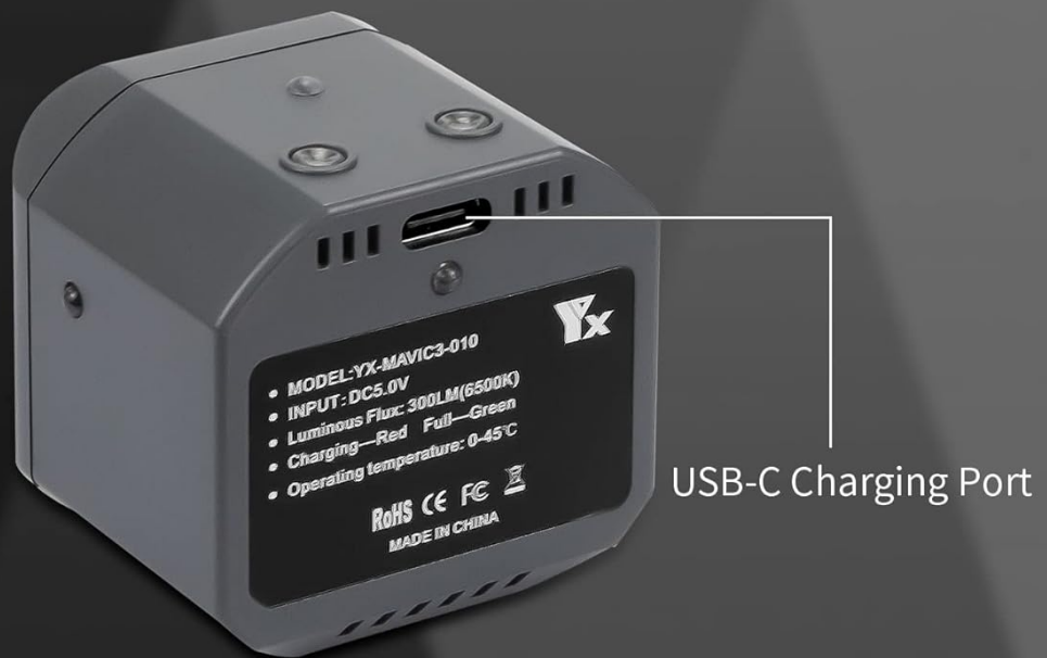
Figure 4.1: Detailed product parameters and location of the USB-C charging port.