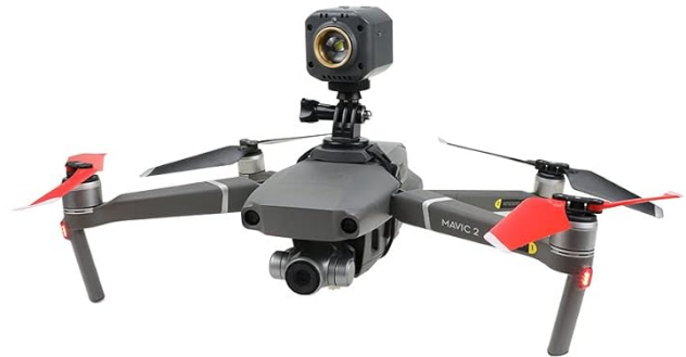
Figure 3.1: Visual representation of compatible DJI drone models with the night flight light installed.