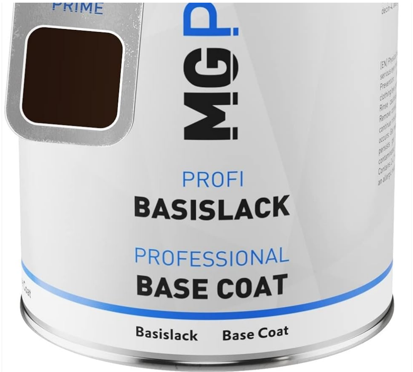
Image: Front view of the MG PRIME Professional Base Coat can, showing the brand logo, "Profi Basislack", "Professional Base Coat", and a tag indicating "für Buick WA204" with a color swatch of Deep Espresso Brown Metallic.