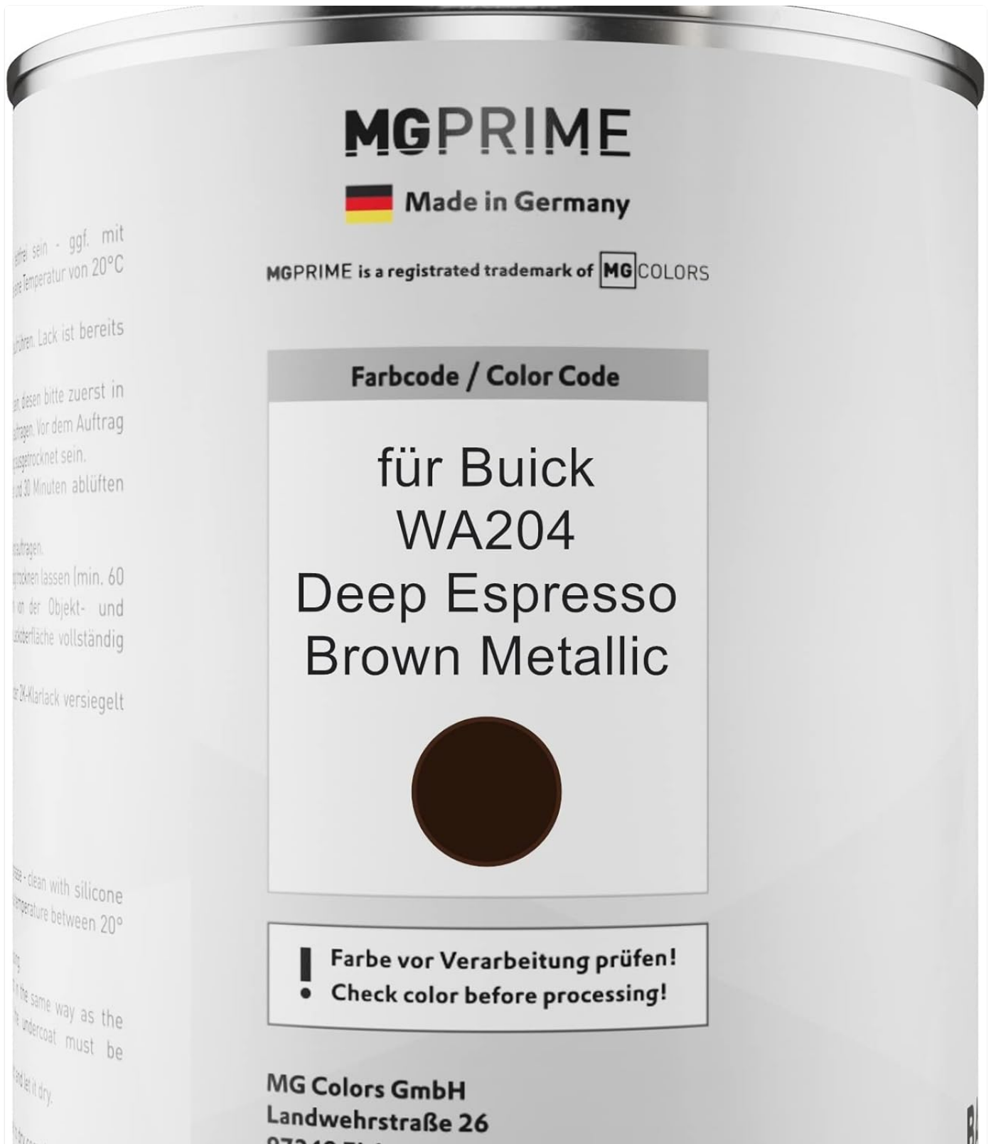
Image: Top view of the MG PRIME paint can, showing "Made in Germany" and a label with "Farbcode / Color Code", "für Buick WA204 Deep Espresso Brown Metallic", and a color swatch. A warning "Farbe vor Verarbeitung prüfen! Check color before processing!" is also visible.