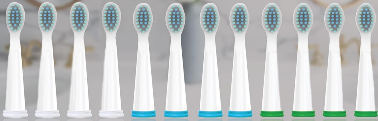
Image: A visual representation of the 12 brush heads included, emphasizing the long-term supply.