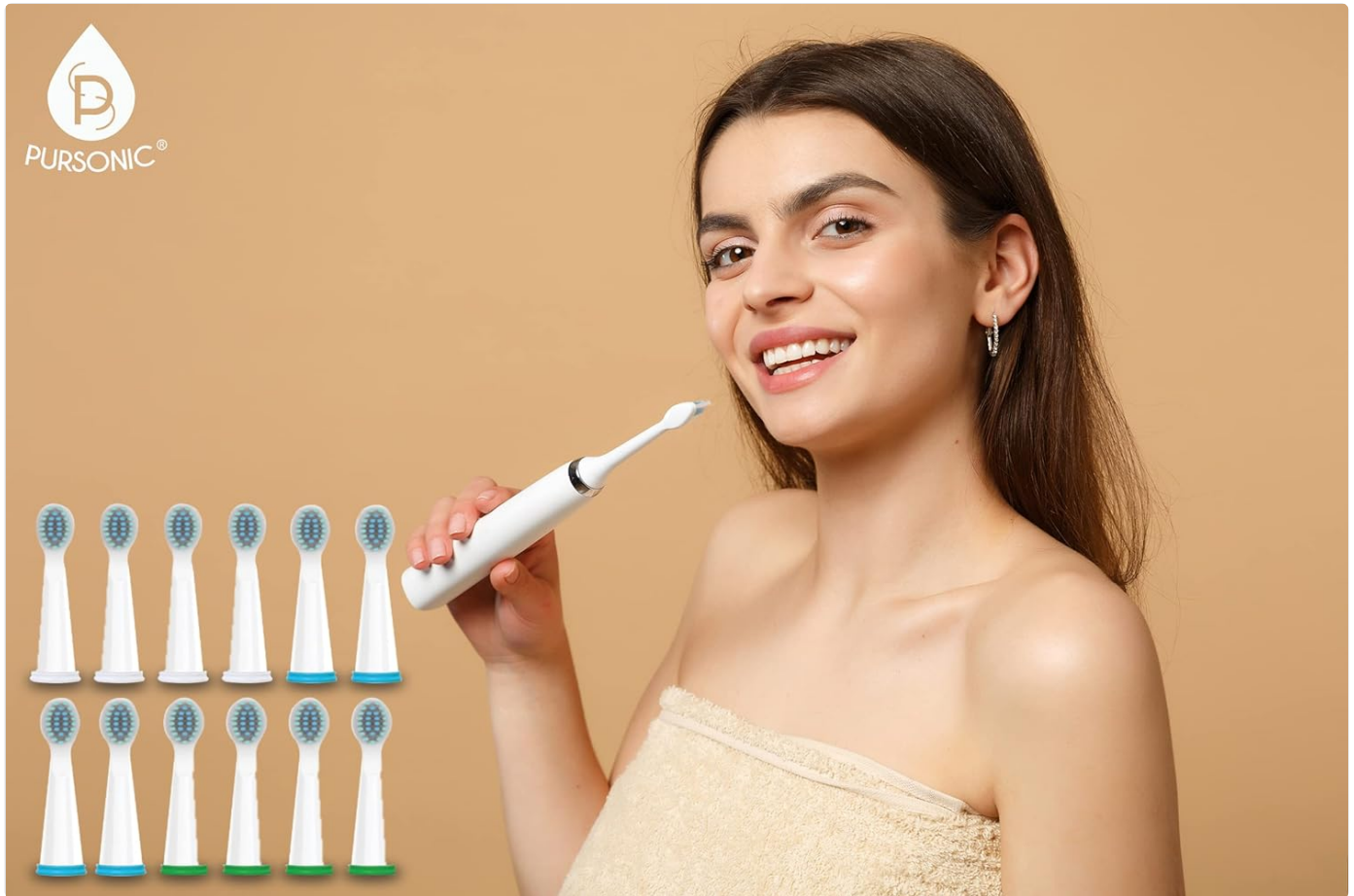
Image: A user demonstrating the proper way to hold and use the sonic toothbrush.