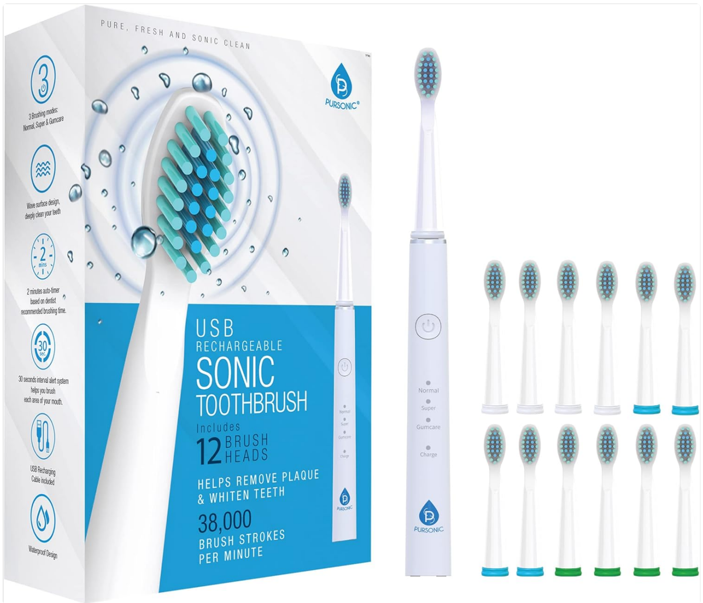
Image: The Pursonic Sonic Toothbrush, its packaging, and the included 12 brush heads.