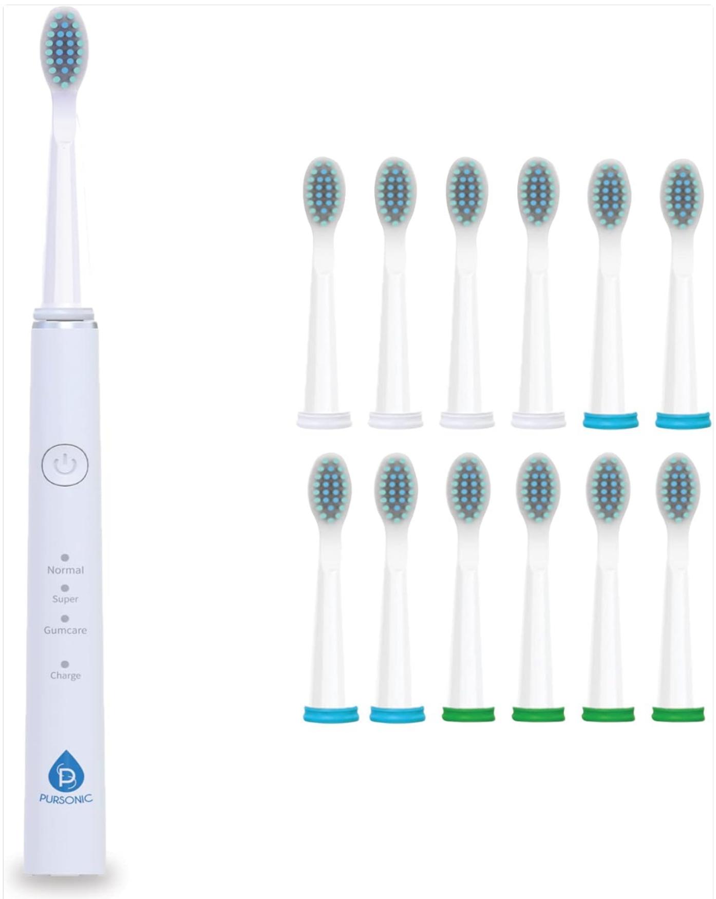
Image: The toothbrush handle alongside the included 12 brush heads, ready for attachment.