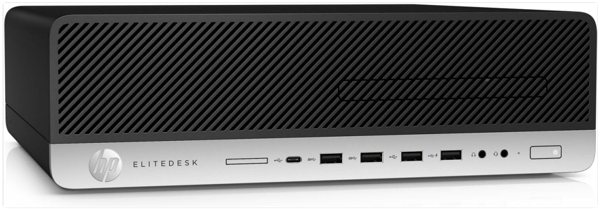
Image: Front panel of the HP EliteDesk 800 G5-SFF, highlighting accessible USB ports, headphone/microphone jacks, and the power button.