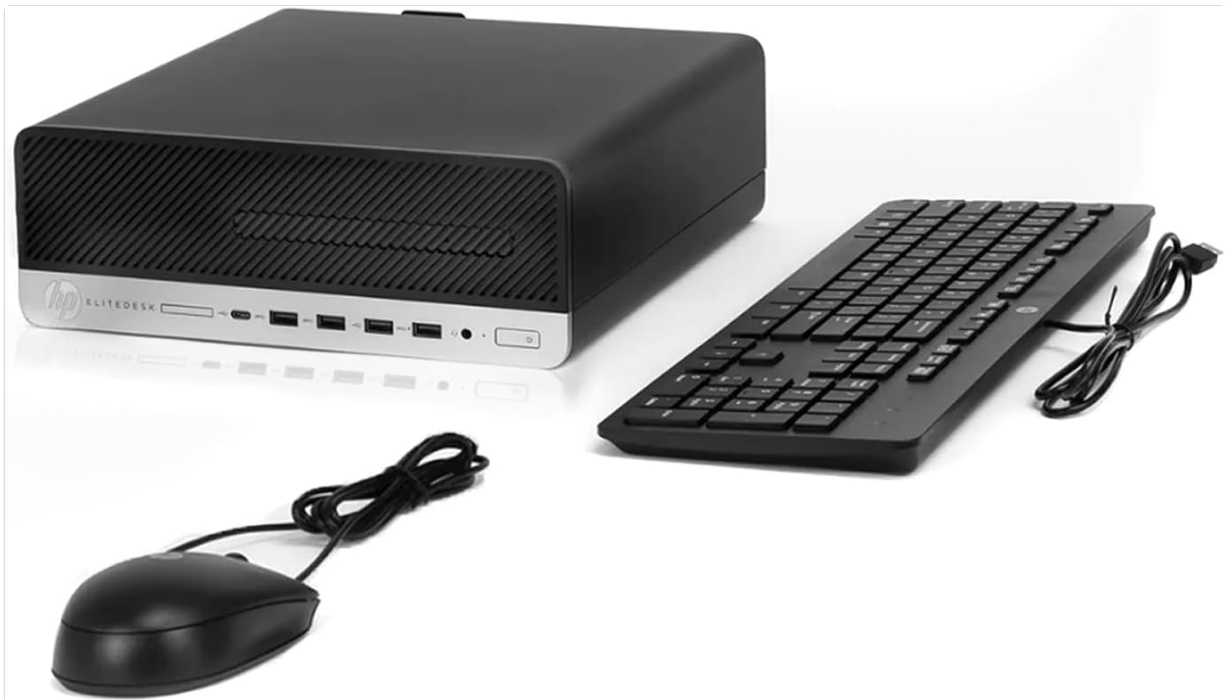
Image: The HP EliteDesk 800 G5-SFF desktop computer shown with its accompanying wired keyboard and mouse.