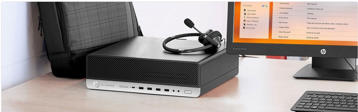
Image: A complete desktop setup featuring the HP EliteDesk 800 G5-SFF, a monitor, keyboard, and mouse.