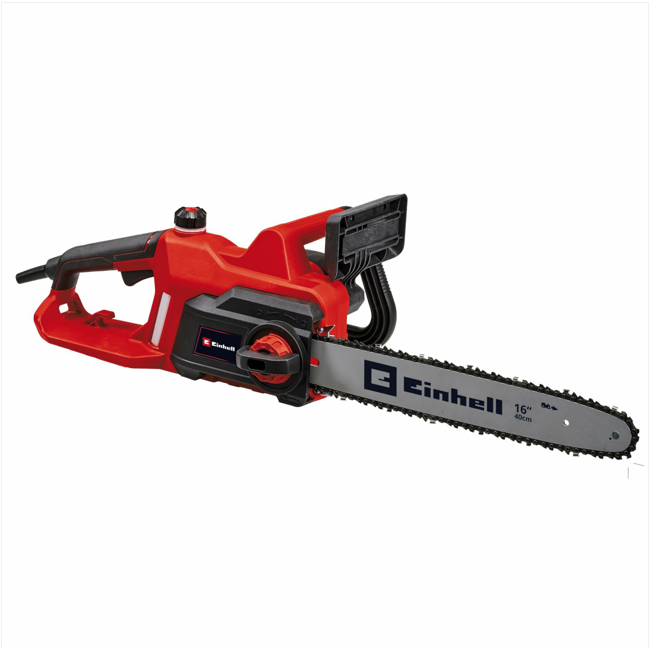
Close-up view of the 40 cm (16 inch) Oregon guide bar and chain.