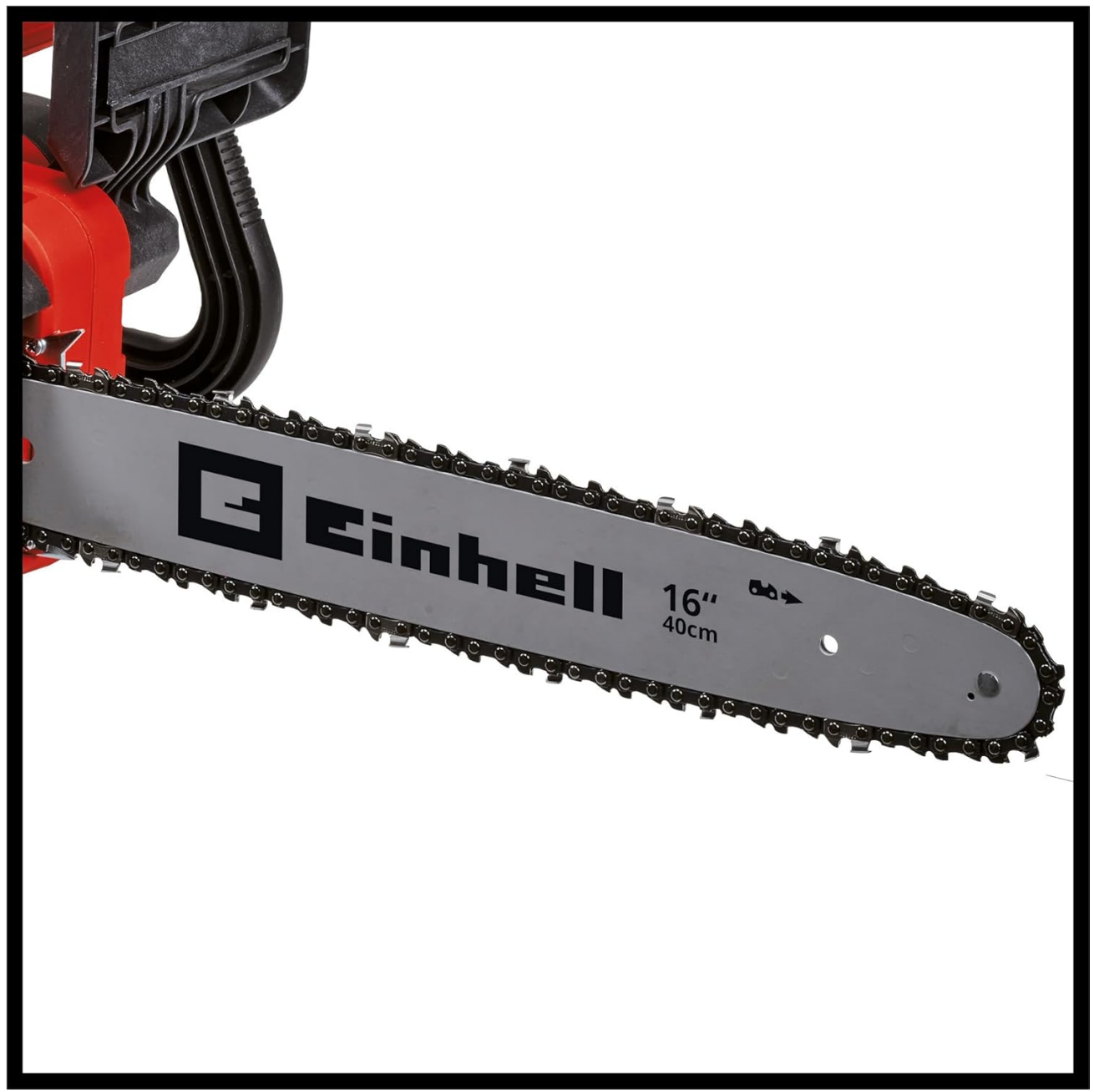
Front view of the Einhell Electric Chainsaw GC-EC 2040, showcasing its compact design.

The Einhell Electric Chainsaw GC-EC 2040 is a powerful and reliable tool designed for cutting firewood, thinning, and felling small trees. It features a robust 2000 W motor and a high-quality Oregon guide bar and chain for optimal cutting performance.