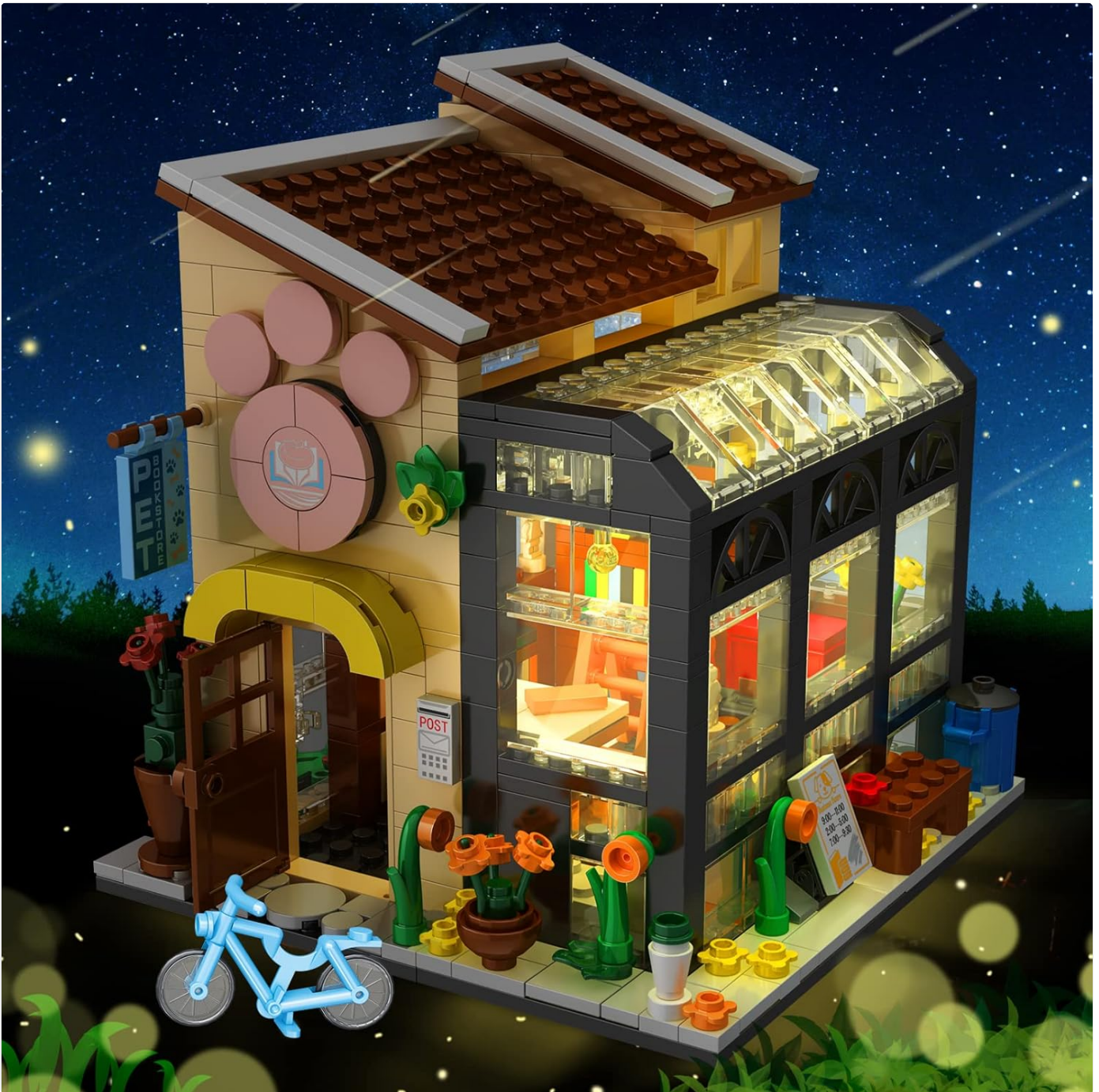
Figure 4: The QLT Book Store Building Set illuminated at night, highlighting the functional lighting feature that enhances its display appeal.