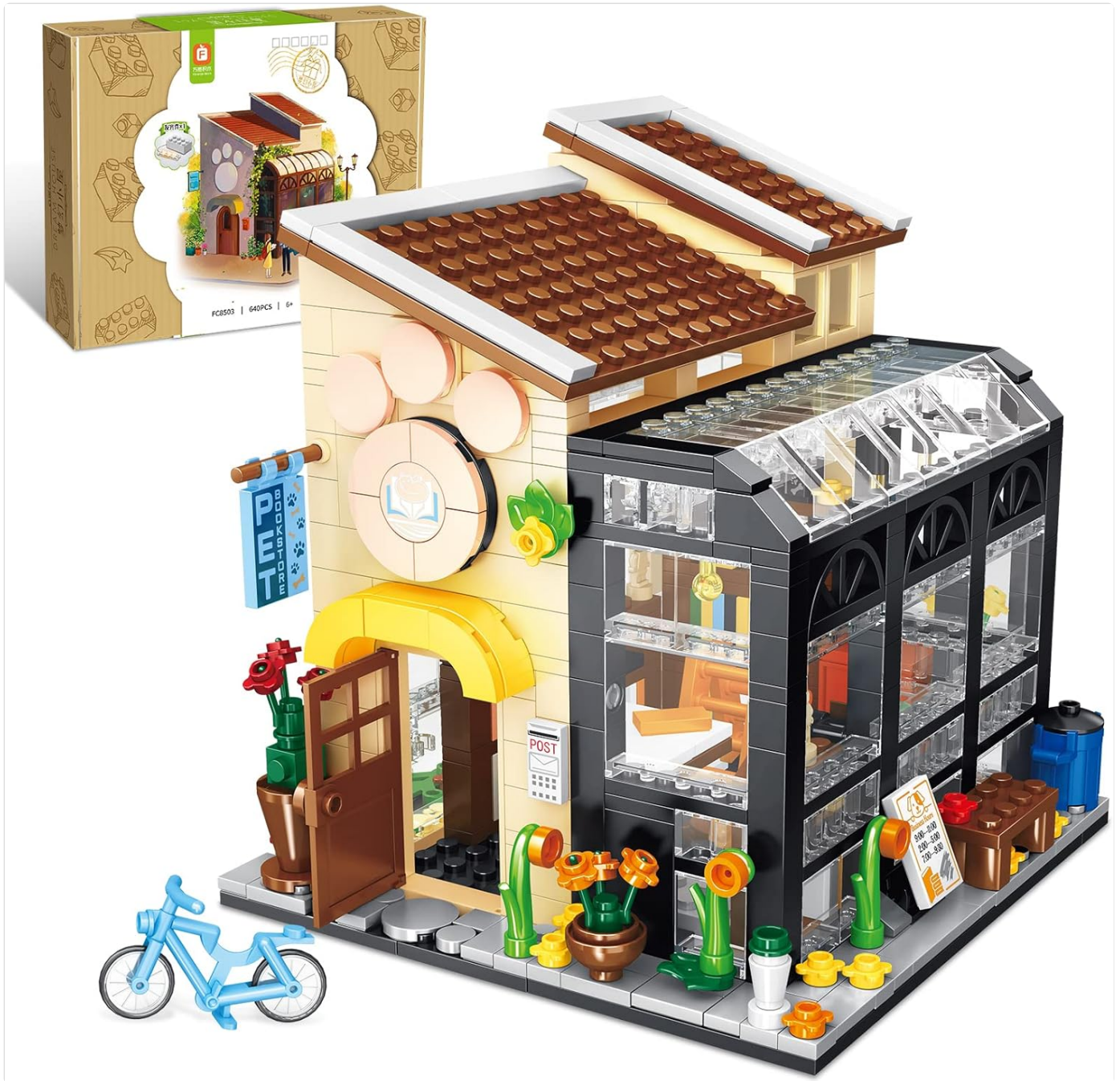
Figure 1: The complete QLT Book Store Building Set, showcasing its intricate details and overall design, alongside its packaging.

8. Add exterior details such as the bicycle, flowers, and signage to complete the model.