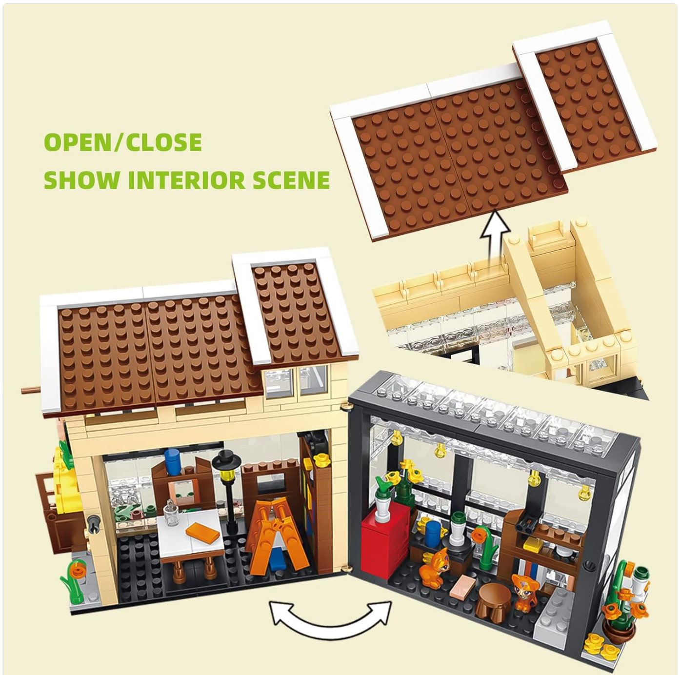
Figure 3: The Book Store Building Set demonstrating its open/close feature, revealing the detailed interior layout of both the book store and the adjacent greenhouse.