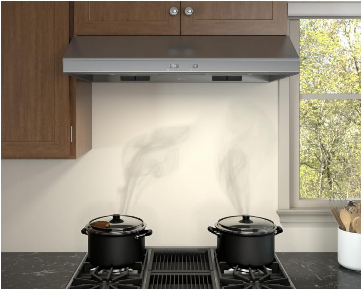
Image: The range hood effectively extracting steam from cooking pots, demonstrating its customizable airflow from 290-600 CFM. The range hood offers an adjustable blower with an airflow capacity of 290-600 CFM, allowing for perfect ventilation tailored to your cooking intensity.

Adjustable blower for perfect ventilation — from light simmering to intense grilling.