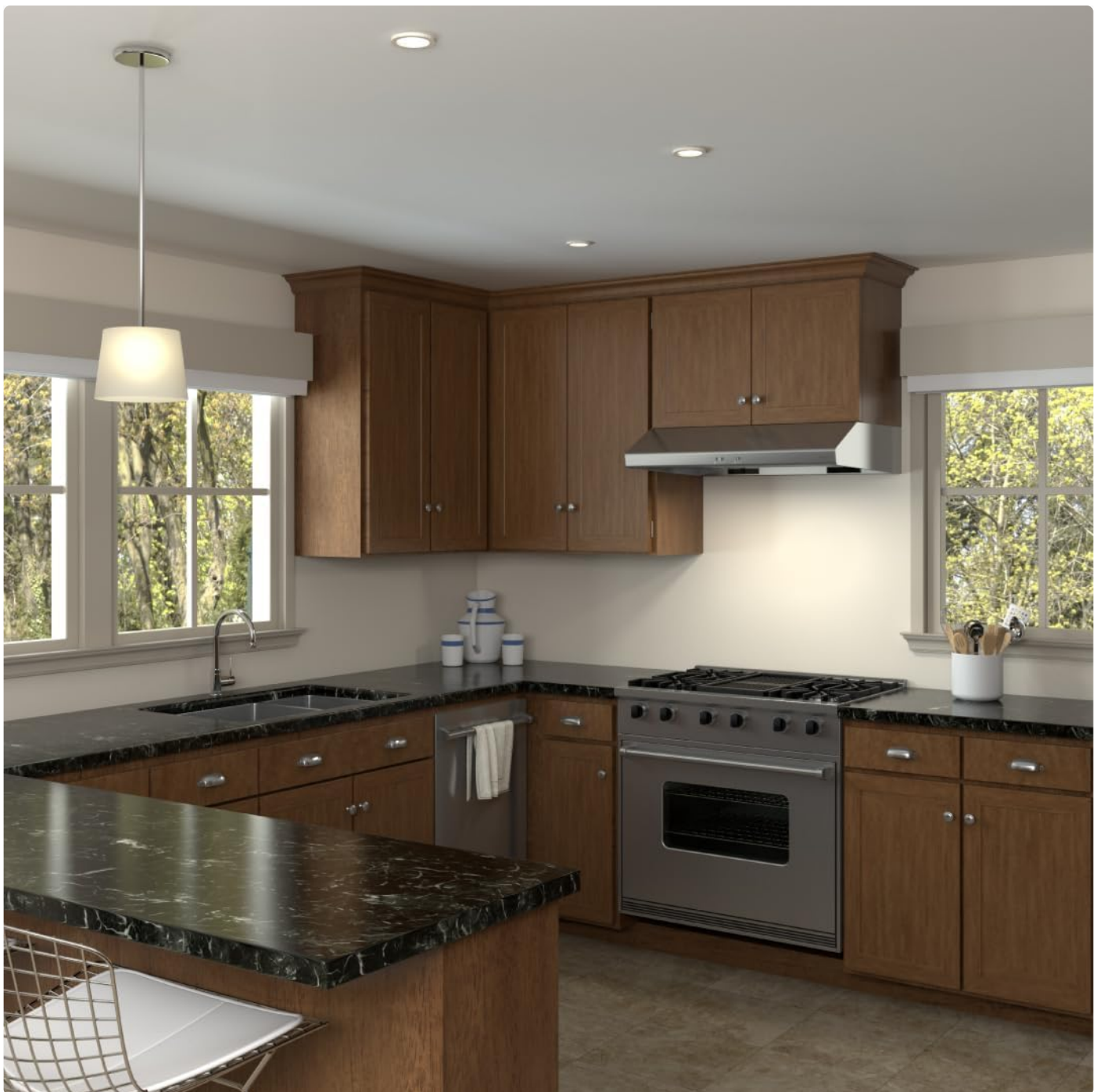
Image: Zephyr Cyclone Range Hood in a kitchen setting, demonstrating its under-cabinet installation and sleek design.