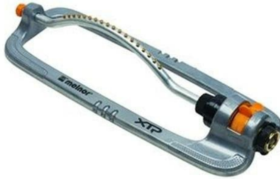
Image: The Melnor 4000 Sq.Ft. Turbo Metal Oscillating Lawn Sprinkler, Green, ready for connection.