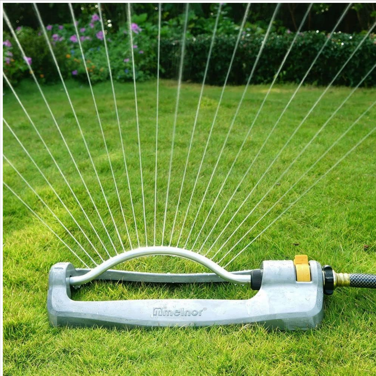
Image: The Melnor oscillating sprinkler distributing water across a lawn.