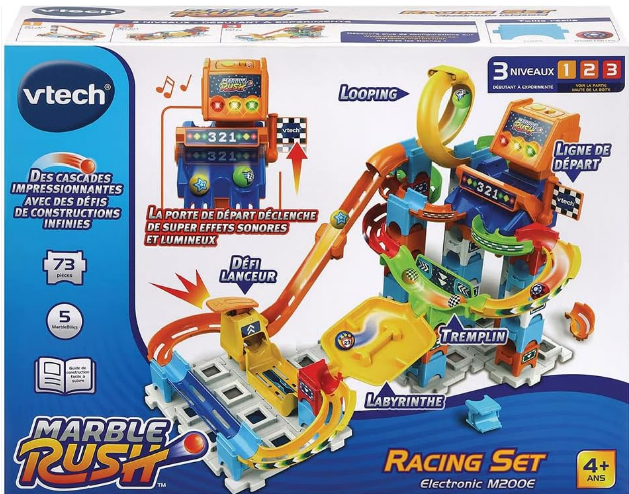
Figure 1: Product box illustrating the main components and features such as the Looping, Starting Gate, Launcher Challenge, Trampoline, and Labyrinth.