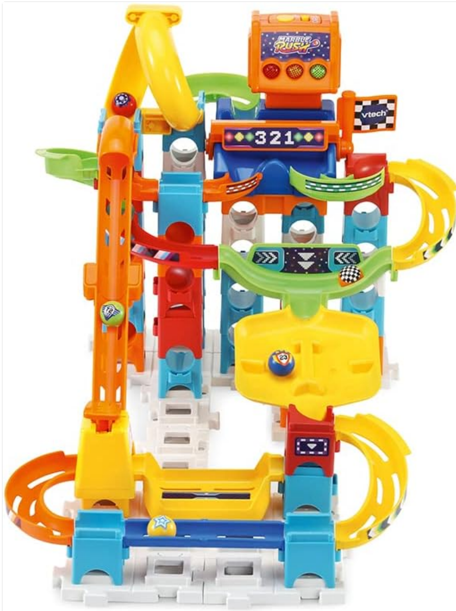
Figure 4: A front view of the assembled racing set, showing marbles in motion on the track.