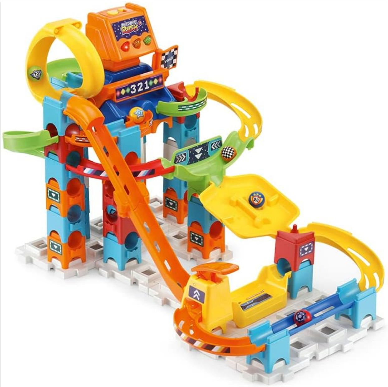
Figure 3: A different perspective of the assembled Marble Rush Racing Set, showcasing its multi-level design and various track components.