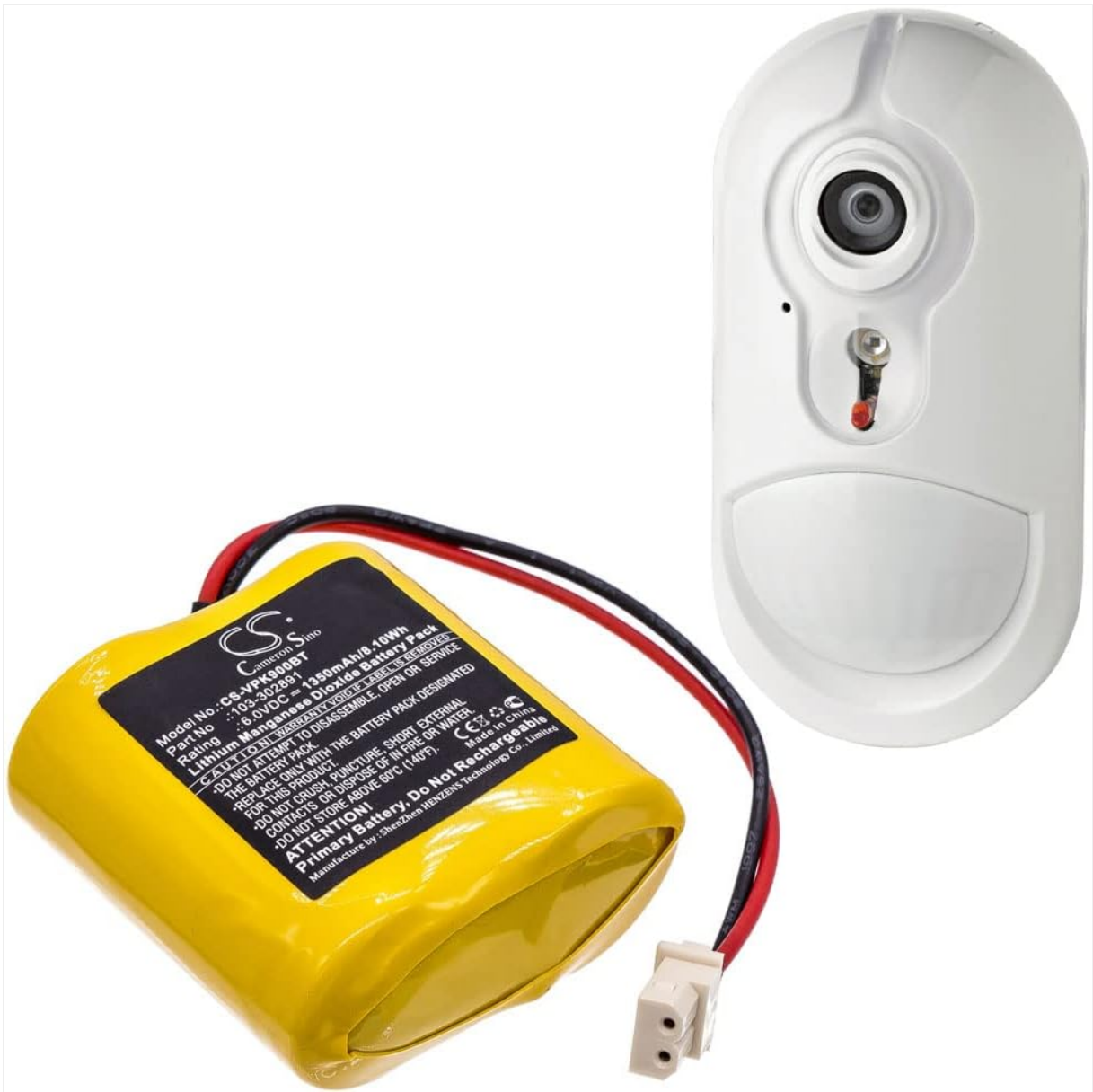
Figure 2.1: Cameron Sino CS-VPK900BT battery shown alongside a compatible Visonic Next CAM device, illustrating its intended use.