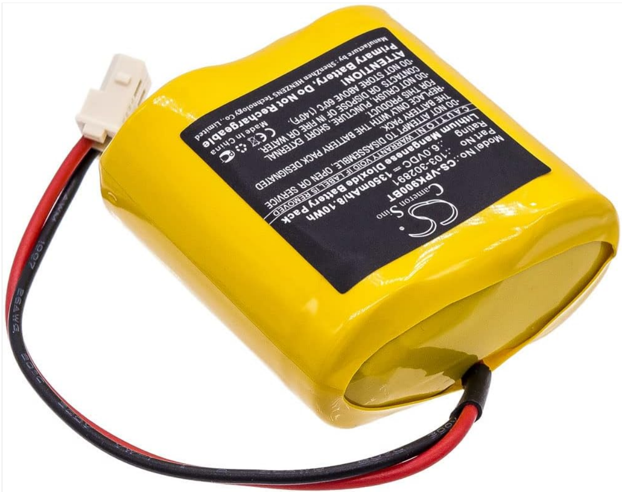
Figure 4.1: Front view of the Cameron Sino CS-VPK900BT battery, showing important safety warnings and specifications printed on its label.