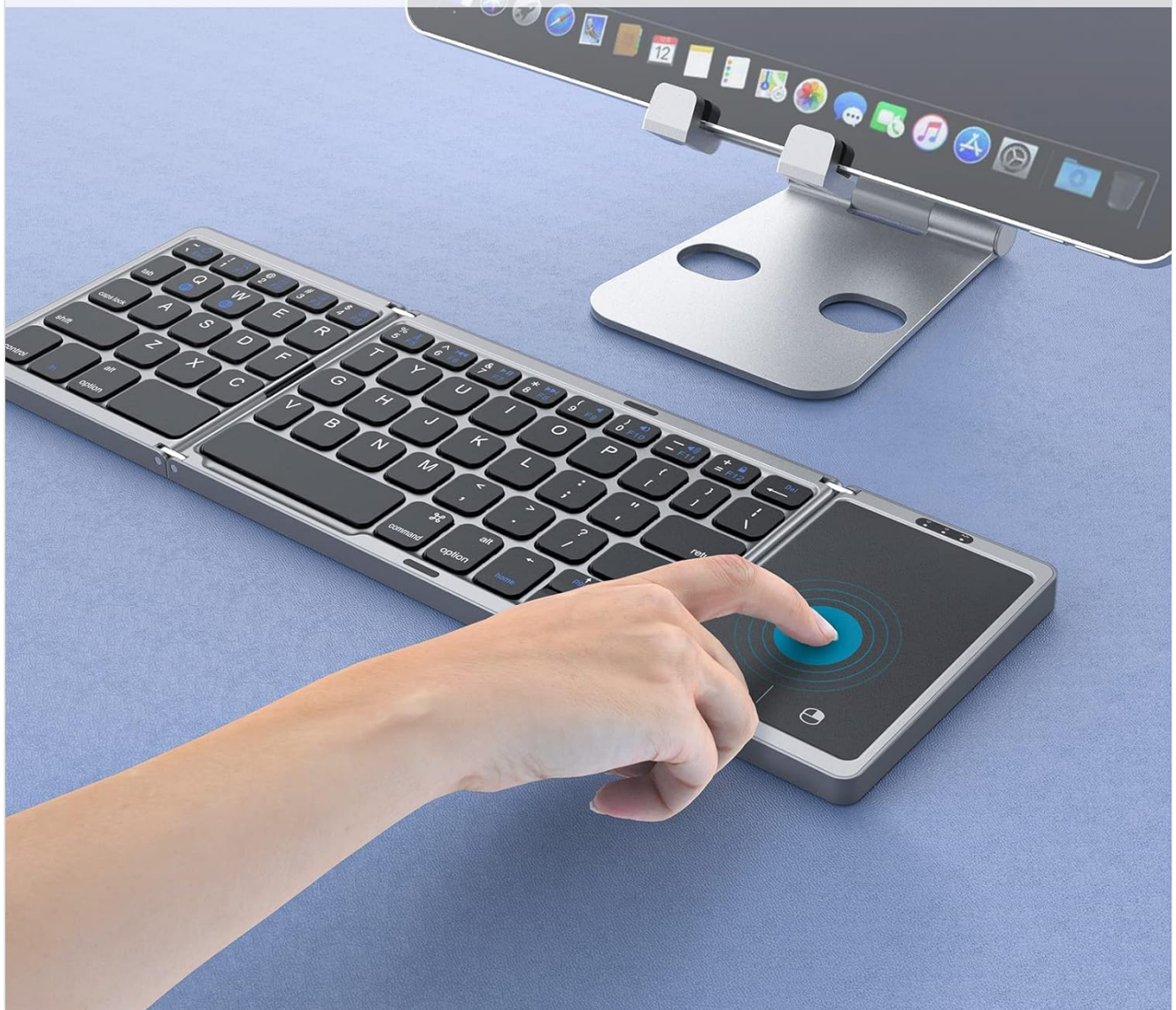
Image: A hand demonstrating the use of the updated, larger, high-sensitivity touchpad on the keyboard, emphasizing its gesture control and mouse functionality.

Sensitive trackpad with GUESTURE CONTROL and mouse button Enjoy keyboard + mouse function with ONE keyboard