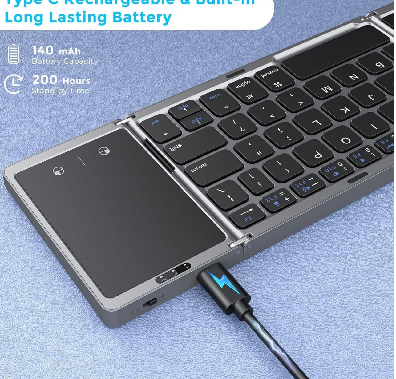
Image: A close-up view of the keyboard's USB-C charging port with a charging cable inserted, highlighting its rechargeable feature and built-in long-lasting battery.