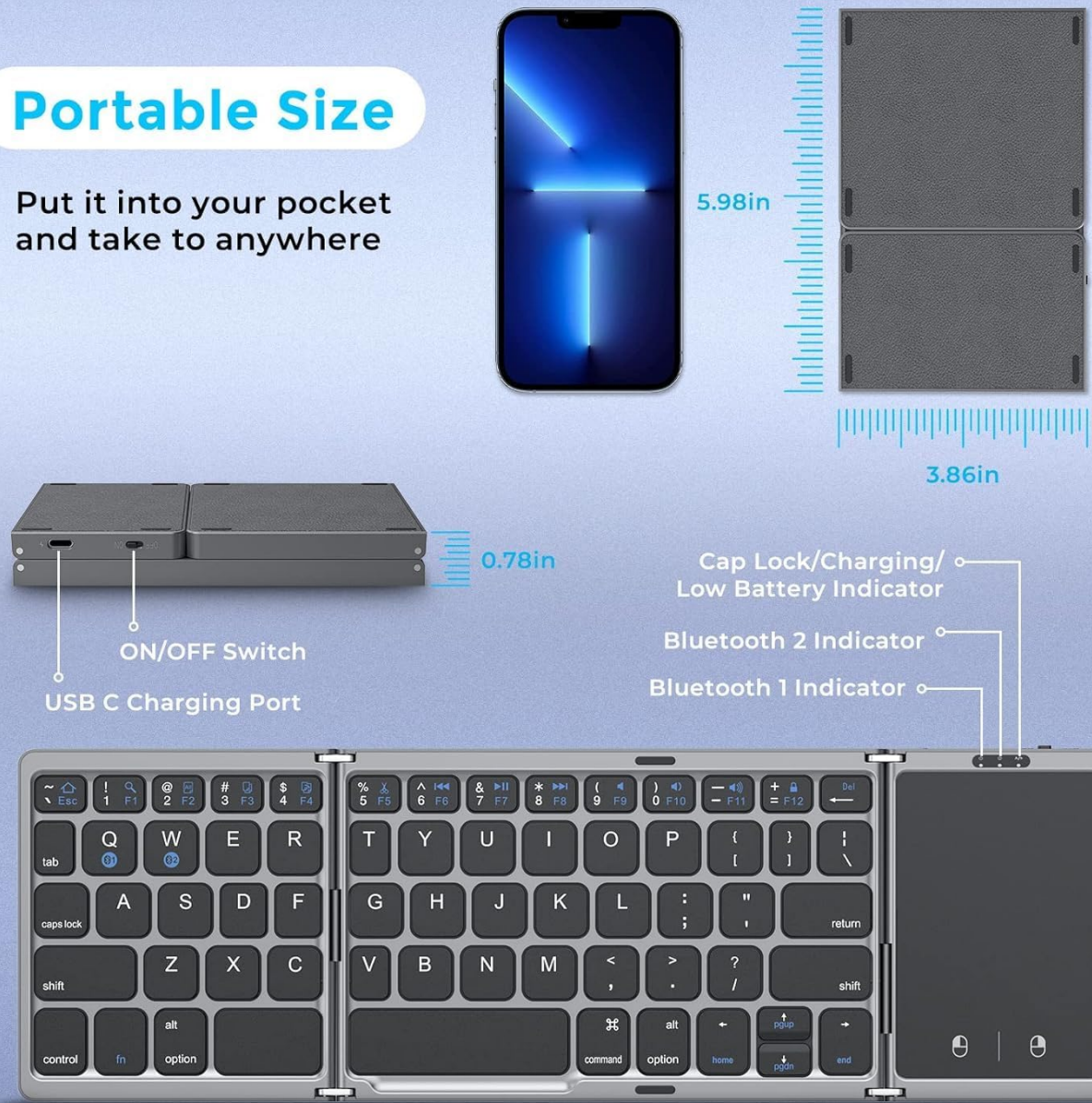
Image: A diagram illustrating the location of the ON/OFF switch, USB-C charging port, and various indicator lights (Cap Lock, Charging, Low Battery, Bluetooth 1, Bluetooth 2) on the keyboard.

Put it into your pocket and take to anywhere