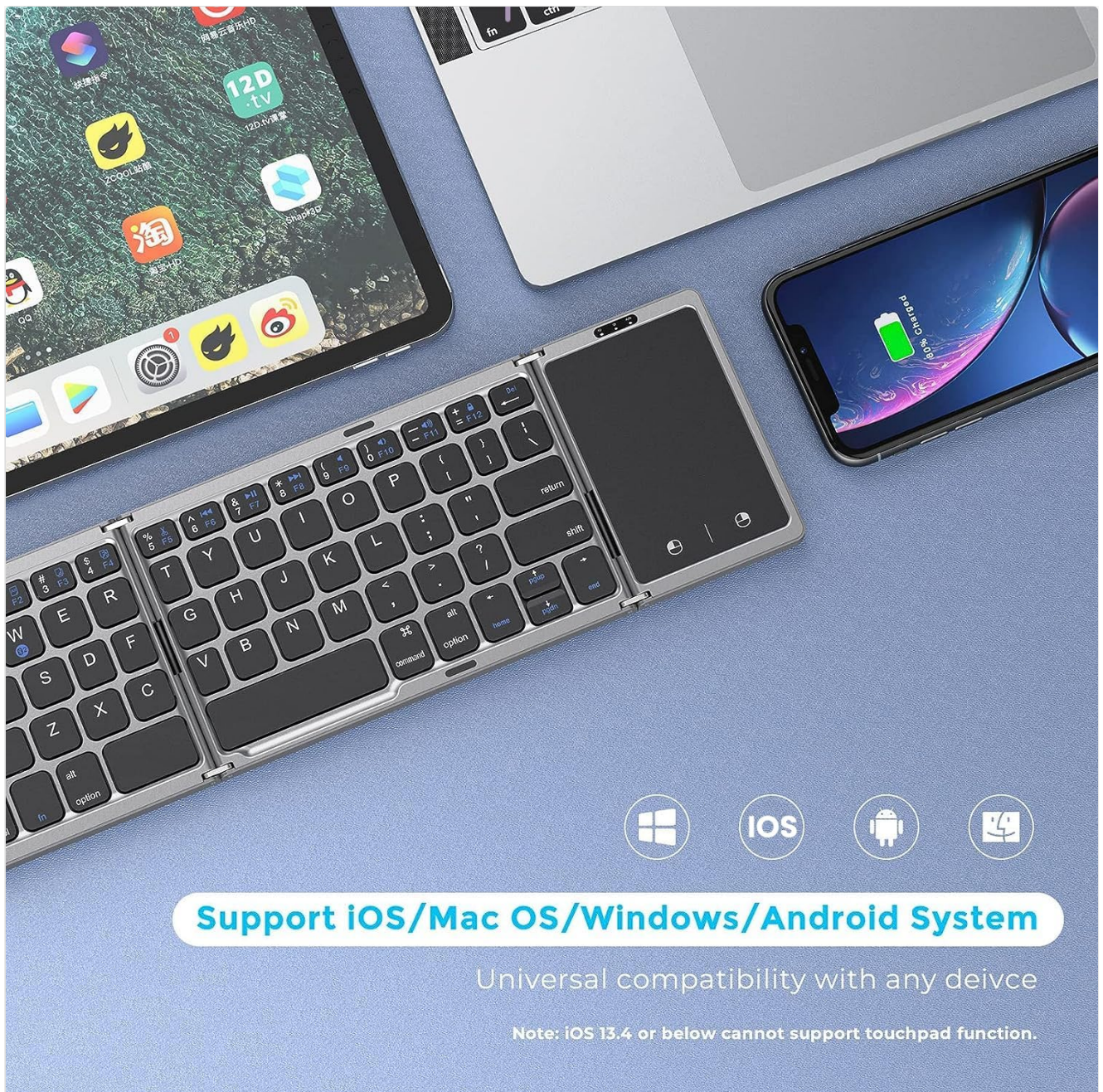
Image: Icons representing iOS, Mac OS, Windows, and Android operating systems, indicating the keyboard's broad compatibility across different platforms. A note about iOS 13.4 touchpad support is also visible.