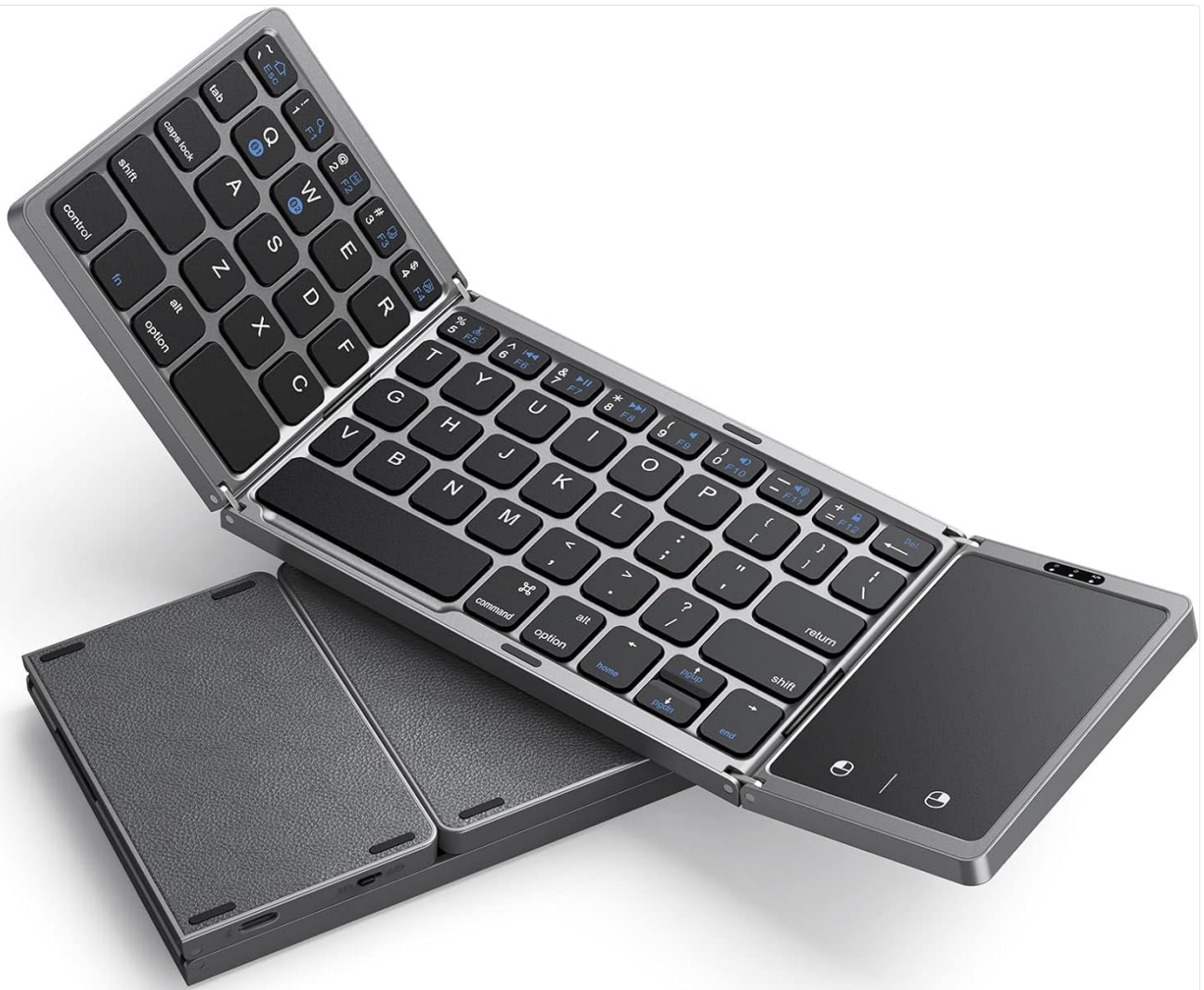
Image: The seenda foldable Bluetooth keyboard shown both unfolded, ready for use, and folded, demonstrating its compact design for portability.