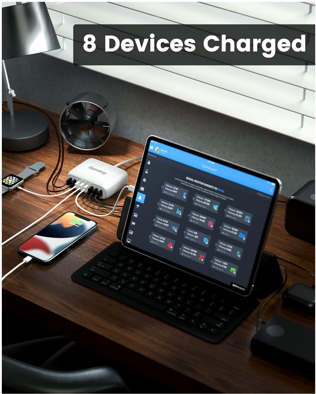
Image 5.3: The 8-Port USB Charging Station in use, charging various devices on a desk.