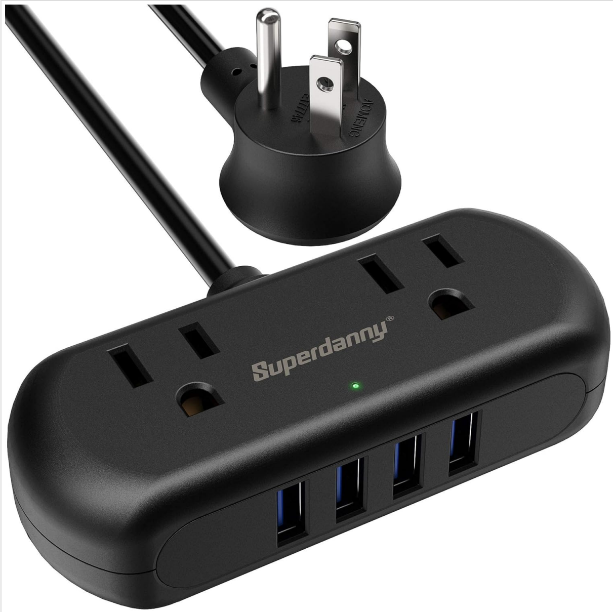
Image 4.1: The SUPERDANNY USB Power Strip with its plug, ready for connection to a wall outlet.