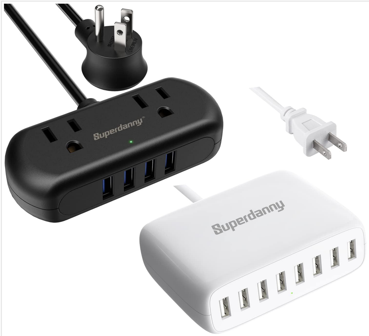
Image 3.1: Contents of the SUPERDANNY package, showing both the power strip and the 8-port USB charging station.