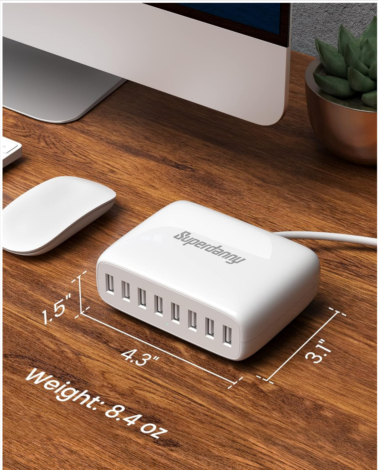
Image 5.4: A close-up view of the 8-Port USB Charging Station with multiple devices connected and charging.