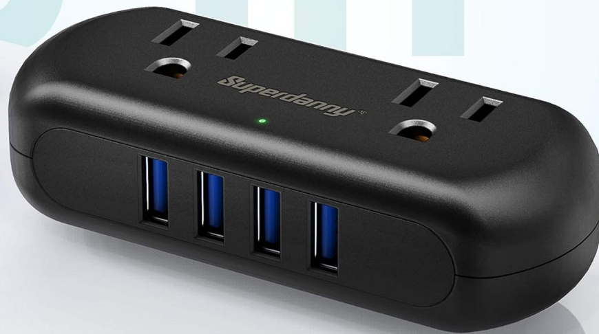
Image 5.1: The SUPERDANNY USB Power Strip highlighting its 2 AC outlets and 4 USB ports.