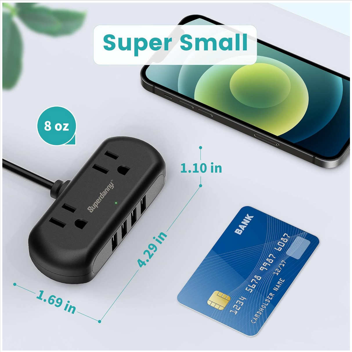
Image 8.1: Visual representation of the SUPERDANNY USB Power Strip dimensions.