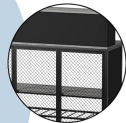
Eye-Catching Metal Mesh Front