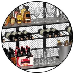
3-Tier Wine Storage Shelves