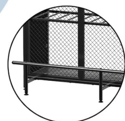
Sturdy Metal Footrest