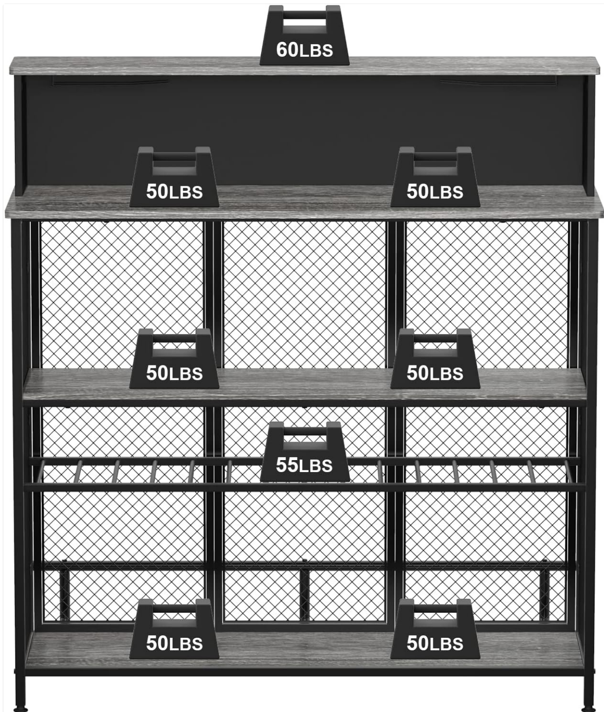
Image: Diagram illustrating the maximum weight capacities for the top surface and various shelves of the bar unit.