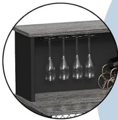
Stemware Racks on top for easier Access