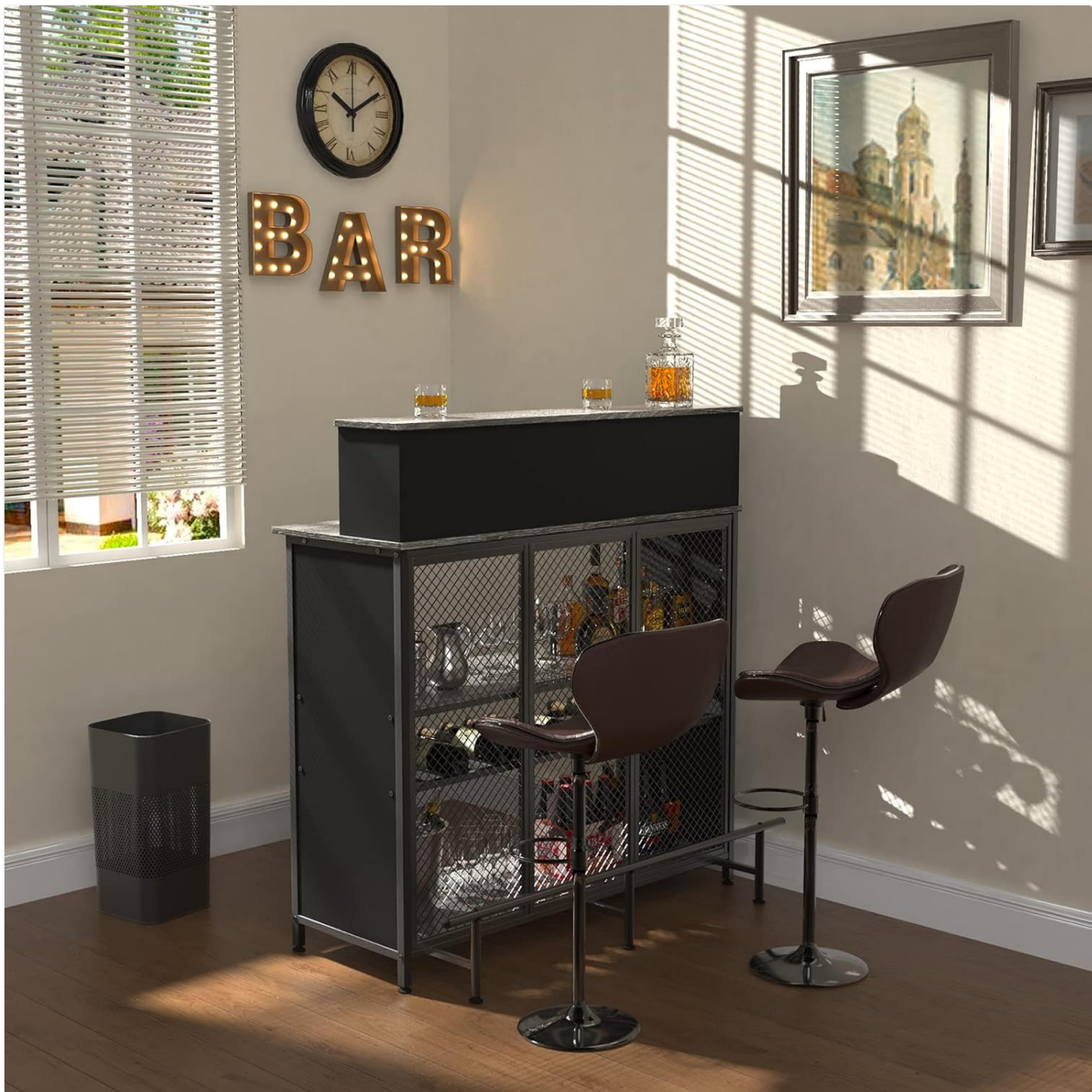
Image: The GDLF Home Bar Unit positioned in a room, demonstrating its integration into a home environment with accompanying bar stools.