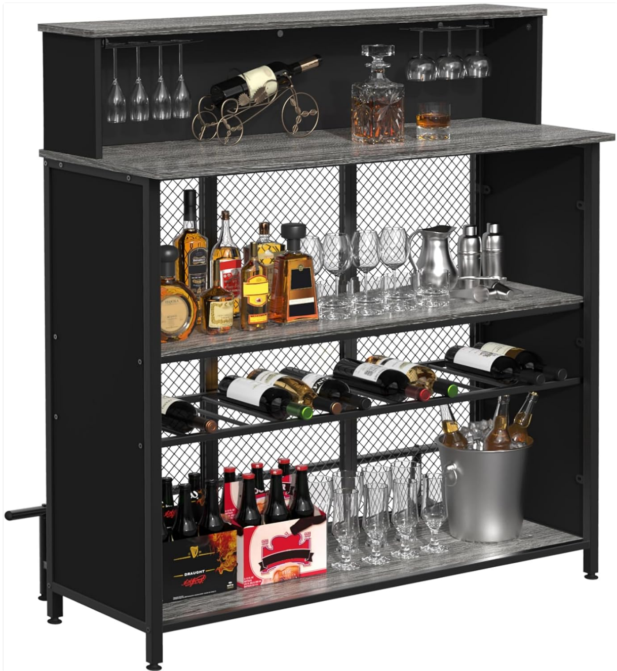
Image: Fully assembled GDLF Home Bar Unit in Grey, showcasing its storage capabilities for bottles, glasses, and accessories.