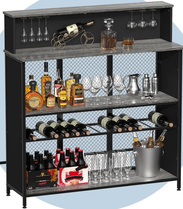
Image: A detailed display highlighting key features such as the 3-tier storage shelves, stemware racks, metal mesh front, adjustable feet, and the sturdy metal footrest, providing visual guidance for assembly and function.