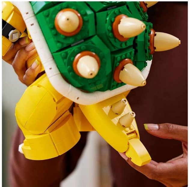
Image: Close-up of Bowser's articulated arms, spiked bracelets, and detailed shell construction.