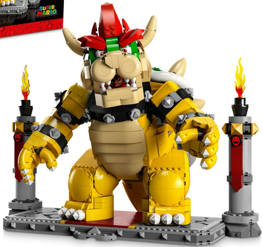
Image: The Mighty Bowser 71411 box art, showcasing the assembled model on its battle platform.

The assembly process is designed to be engaging and may take several hours to complete due to the high piece count and intricate details. Take your time and enjoy each stage of the build.