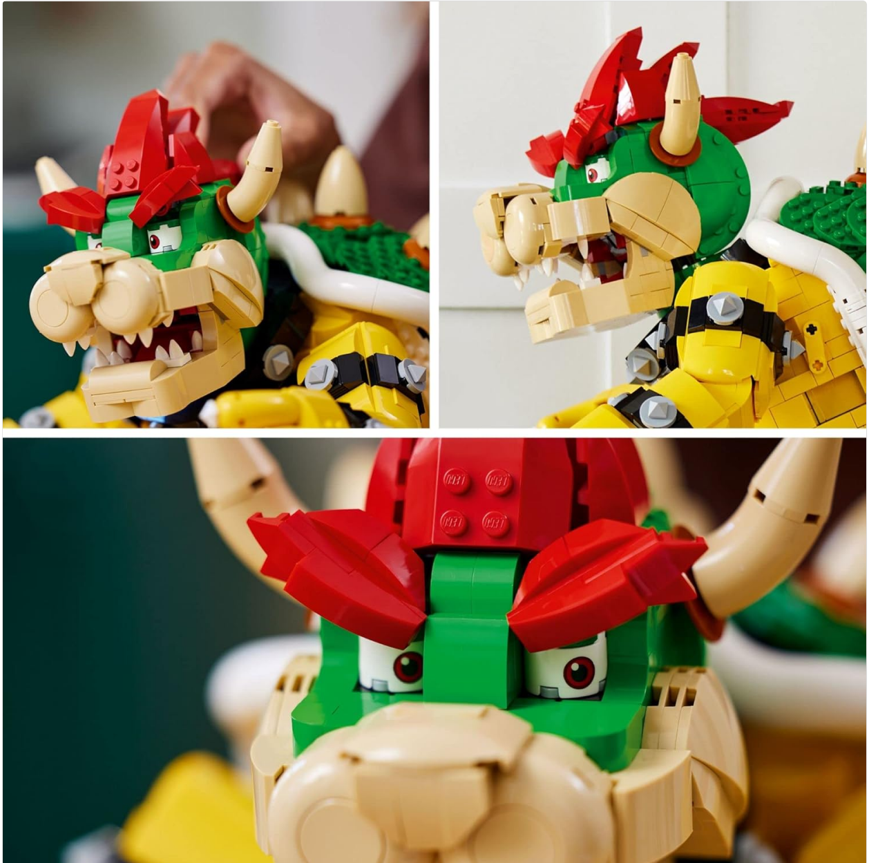
Image: Detailed view of Bowser's head, highlighting the posable jaw and rotating eyes.

LEGO Peach figures (sold separately) from LEGO Super Mario Starter Courses (71360, 71387, or 71403) for enhanced play experiences.