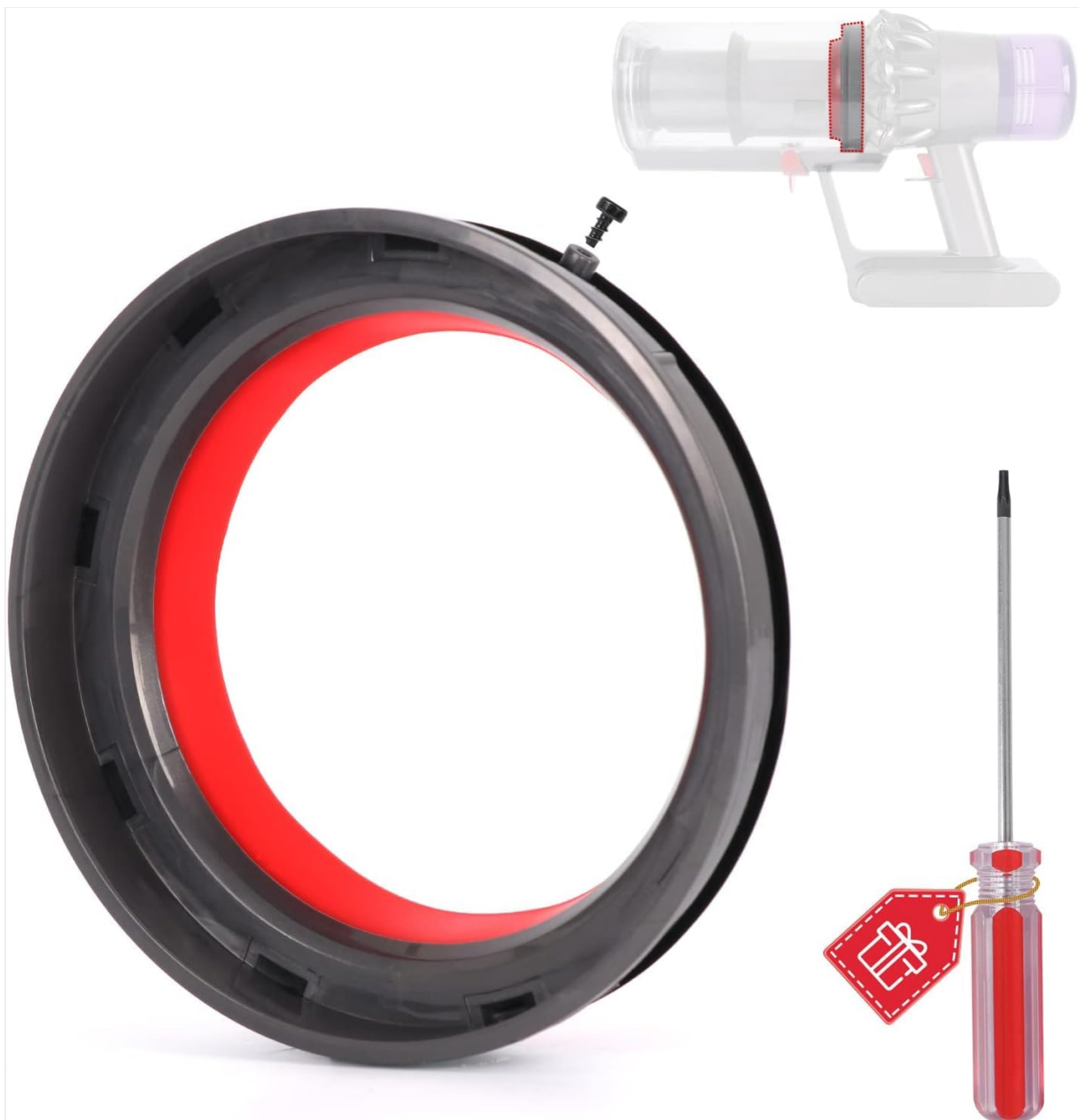
Image 3.1: The replacement sealing ring assembly and the required T8 Torx screwdriver.