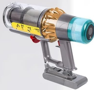
V15 SV22 Click-in Battery Vacuum Cleaner