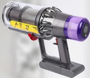
V11 SV14 Screw-in Battery Vacuum Cleaner