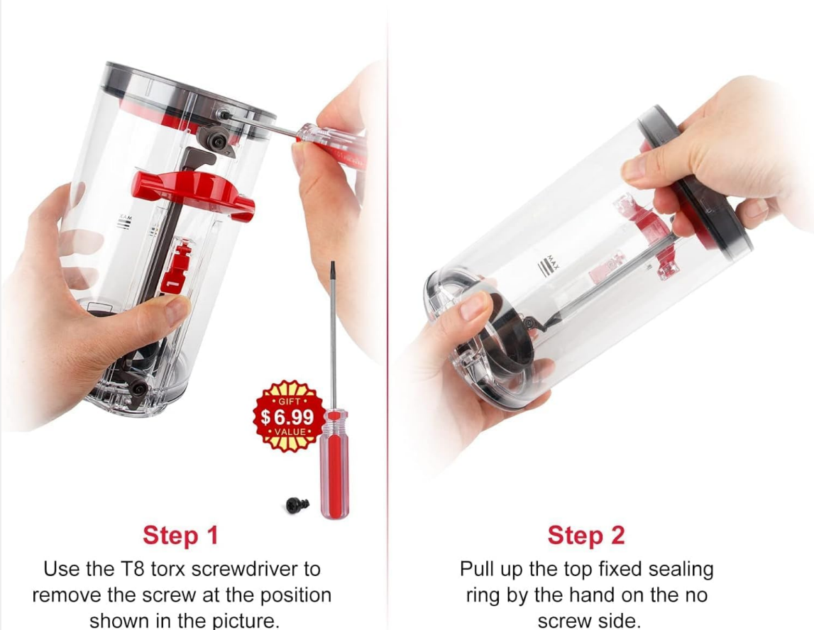
Image 4.1: Removing the retaining screw from the dust bin using the T8 screwdriver.