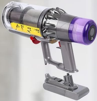
V11 SV15 Click-in Battery Vacuum Cleaner