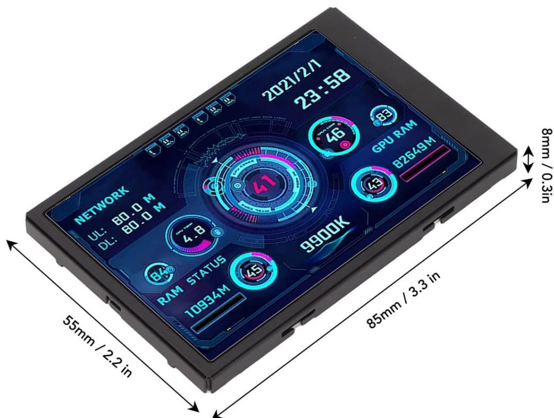
Figure 3: Physical dimensions of the 3.5-inch display, measuring approximately 85mm (3.3in) by 55mm (2.2in).