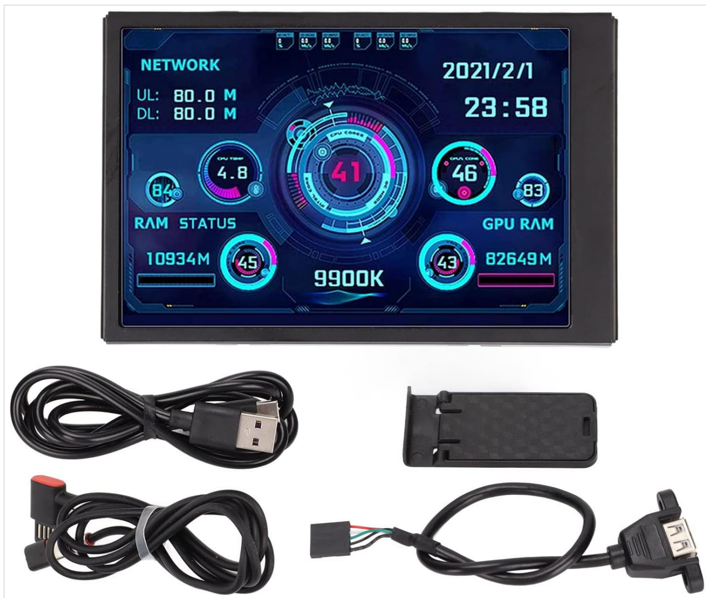
Figure 5: Example of comprehensive system data displayed on the screen, including CPU, RAM, HDD, network, date, and time.