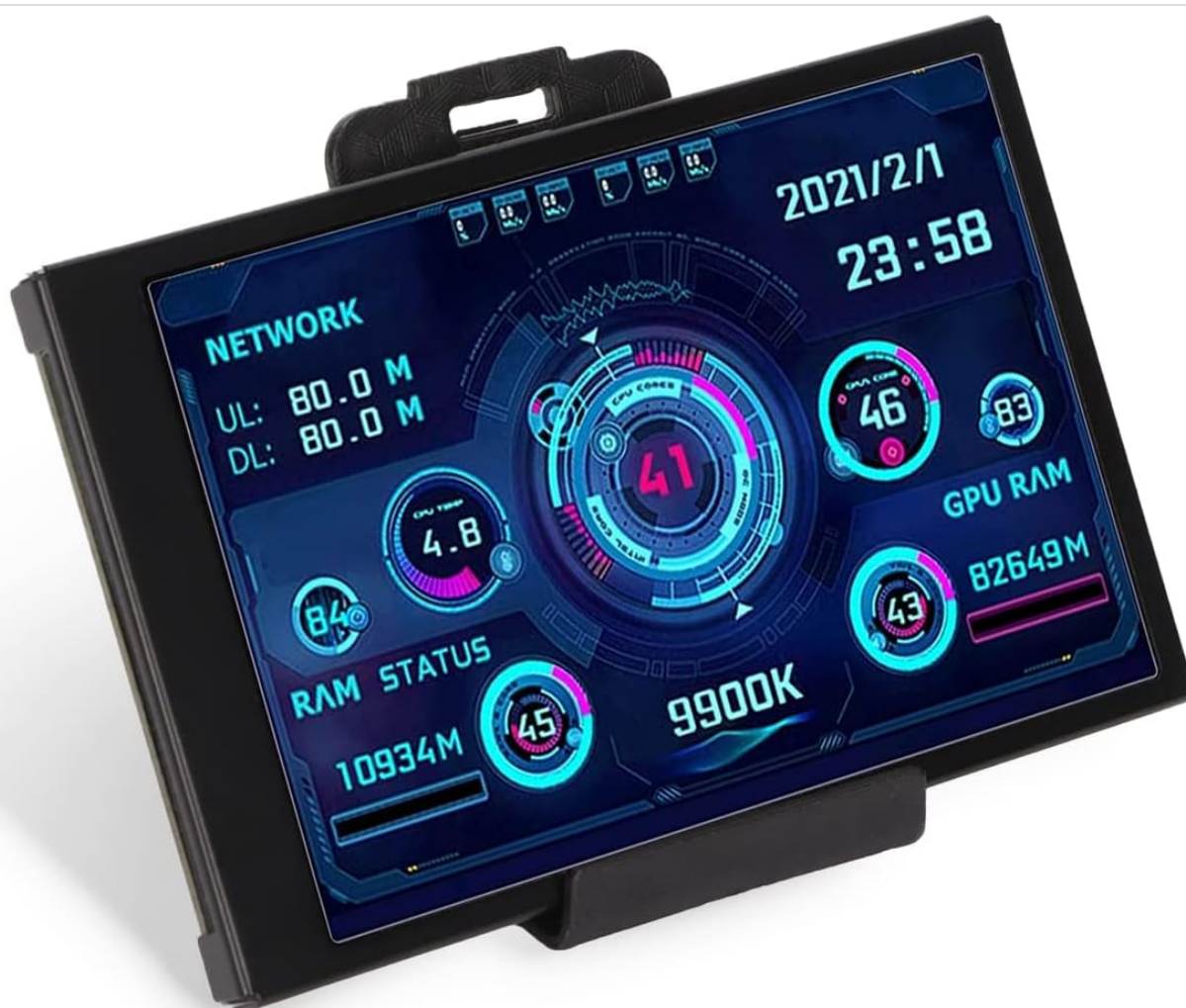
Figure 1: GOWENIC 3.5in Mini IPS Screen in operation, showing various system metrics.

The GOWENIC 3.5in Mini IPS Screen is a compact and versatile display designed to monitor your computer's vital statistics in real-time. It can display CPU, GPU, RAM usage and temperature, network speed, date, time, volume, and weather forecasts. This device is an extended display for your host, primarily used for temperature monitoring, and is compatible exclusively with Windows operating systems.