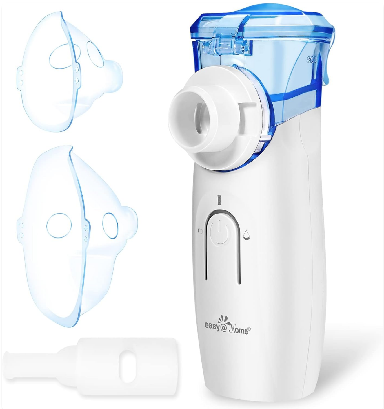
Image: The Easy@Home Portable Nebulizer, shown with its included adult mask, child mask, and mouthpiece.