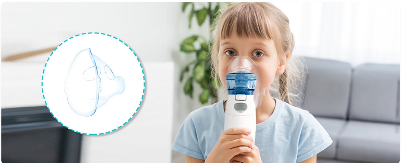
Image: A child demonstrating the proper use of the nebulizer with the child-sized mask.