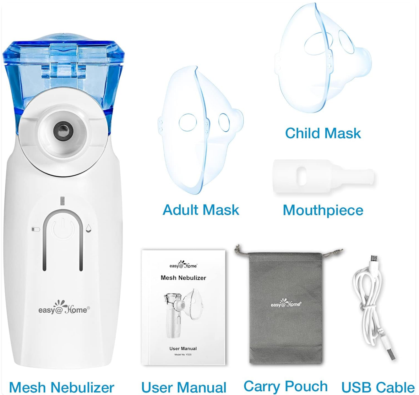
Image: A complete set of Easy@Home Portable Nebulizer components, including the main unit, masks, mouthpiece, USB cable, and carry pouch.