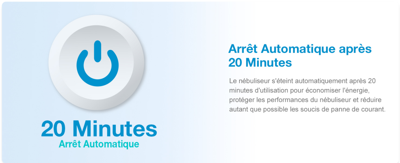
Image: The nebulizer automatically turns off after 20 minutes of use to save energy and protect the device.