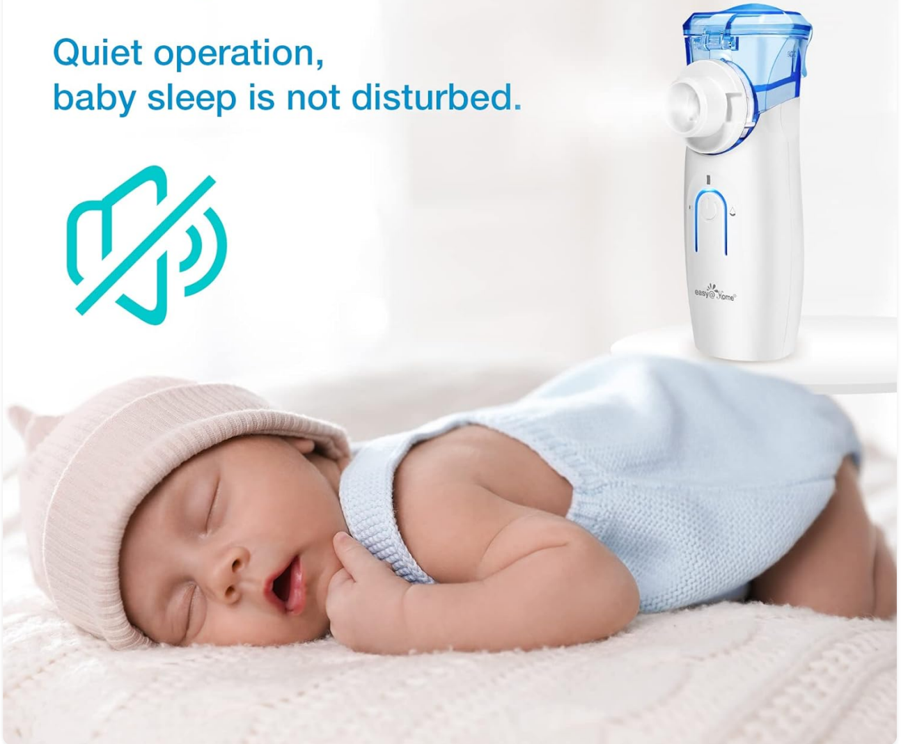
Image: The nebulizer's super quiet operation ensures that even a sleeping baby is not disturbed during use.