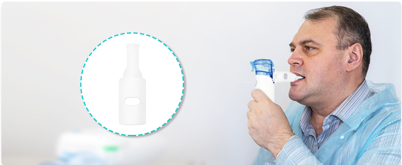
Image: An adult demonstrating the proper use of the nebulizer with the mouthpiece.

Image: An adult demonstrating the proper use of the nebulizer with the adult-sized mask.