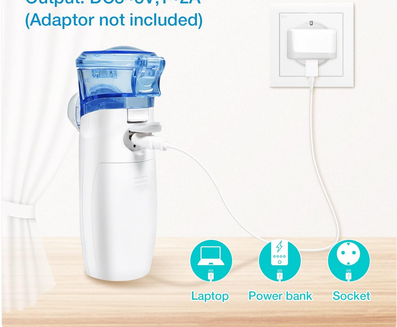
Image: The nebulizer being charged via USB, illustrating various compatible power sources like laptops, power banks, and wall sockets.

Output: DC3~5V,1~2A (Adaptor not included)