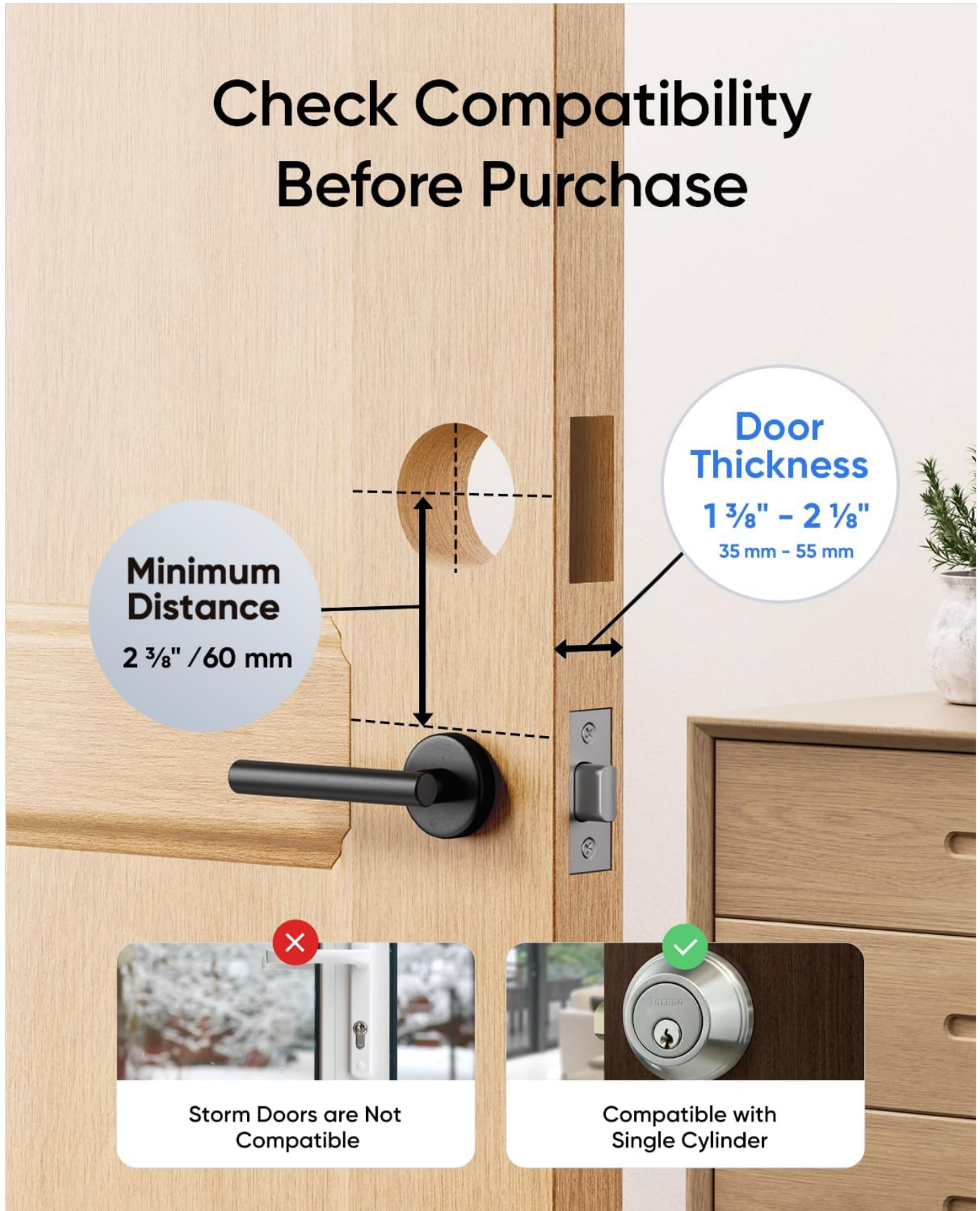
Figure 3: Key dimensions for door compatibility, including minimum distance from door edge and acceptable door thickness.

The S330 is compatible with most standard US and Canadian deadbolt spacings. It requires a minimum distance of 2 3/8" / 60 mm from the door edge to the center of the deadbolt hole. The door thickness should be between 1 3/8" – 2 1/8" (35 mm - 55 mm). Storm doors are generally not compatible. It is compatible with single cylinder deadbolts.