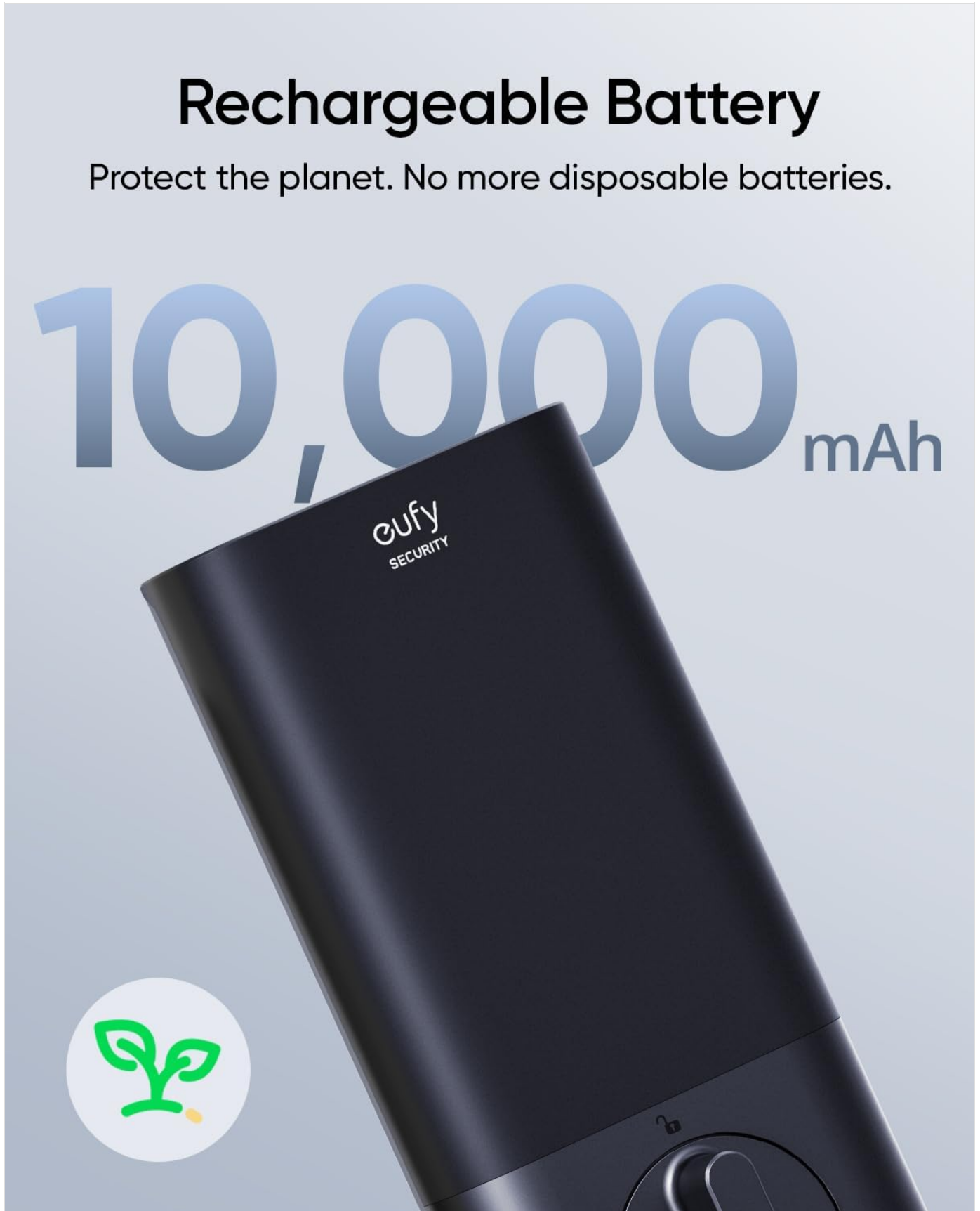
Figure 4: The high-capacity 10,000 mAh rechargeable battery for the S330, emphasizing its eco-friendly design.