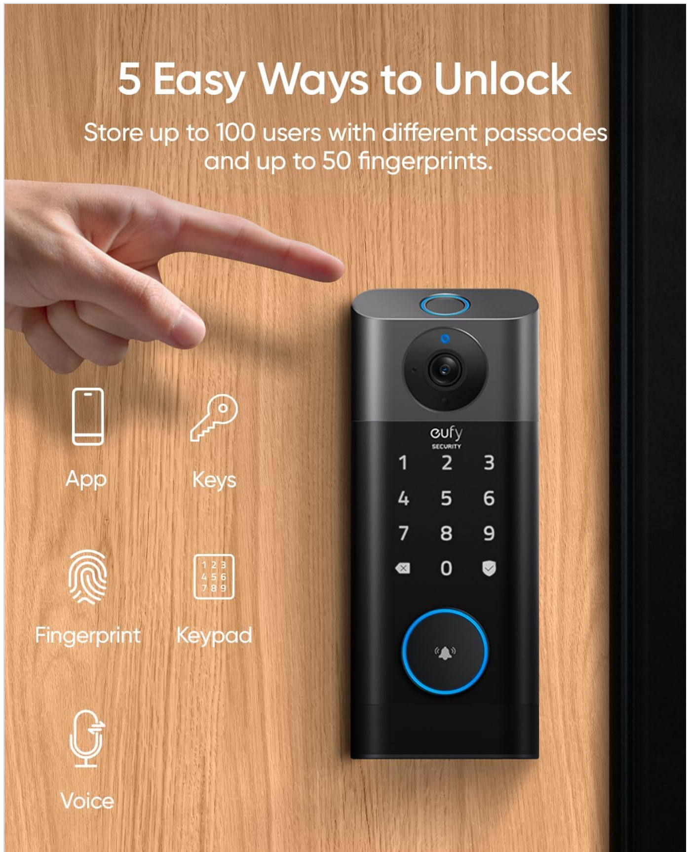
Figure 6: The 2-way audio feature allows real-time communication with visitors through the app.

and manage access for visitors or service providers.