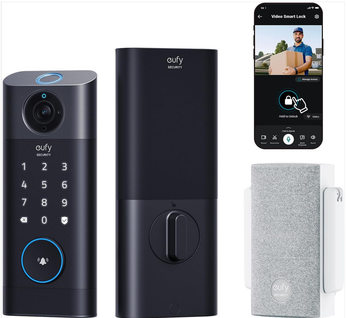
Figure 1: Overview of the eufy Security Video Smart Lock S330 components, including the exterior keypad/camera unit, the interior lock unit, and the included chime.