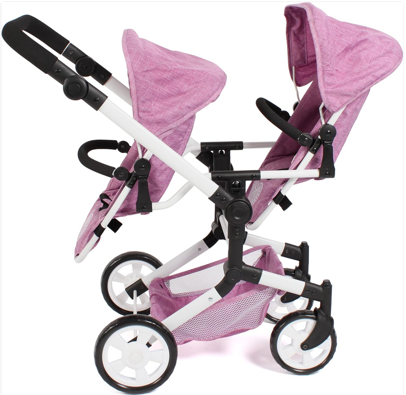
Image 5.2: The doll stroller with both seats configured in a rear-facing position, allowing the child to interact with their dolls.