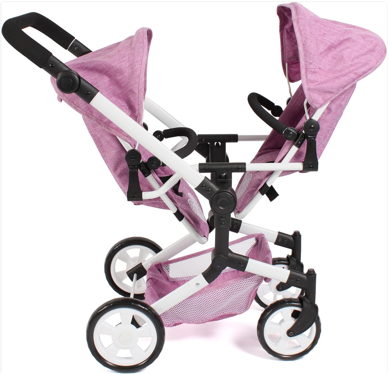
Image 5.3: The doll stroller with seats configured face-to-face, enabling dolls to interact with each other.