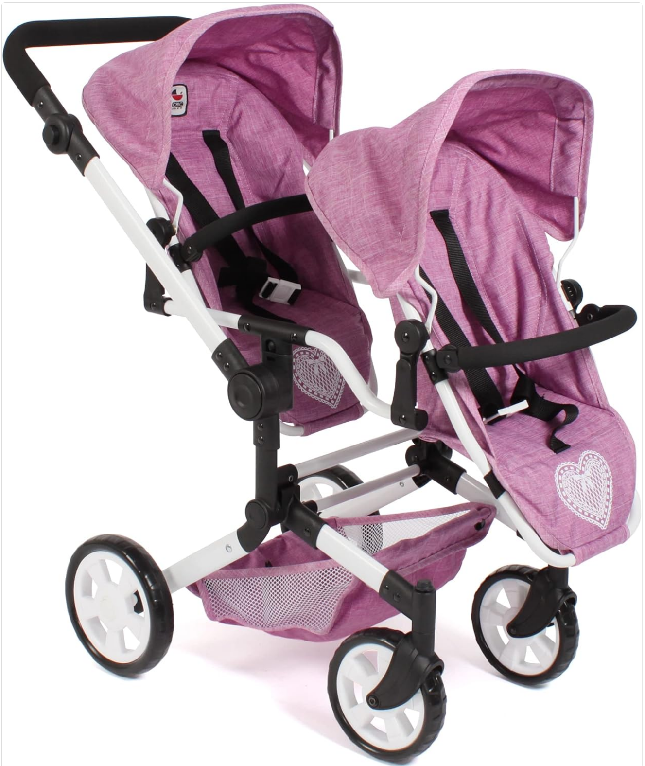
Image 4.1: A fully assembled Bayer Chic 2000 Linus Duo Doll Stroller, showcasing its overall structure and design with both seats in a forward-facing configuration.