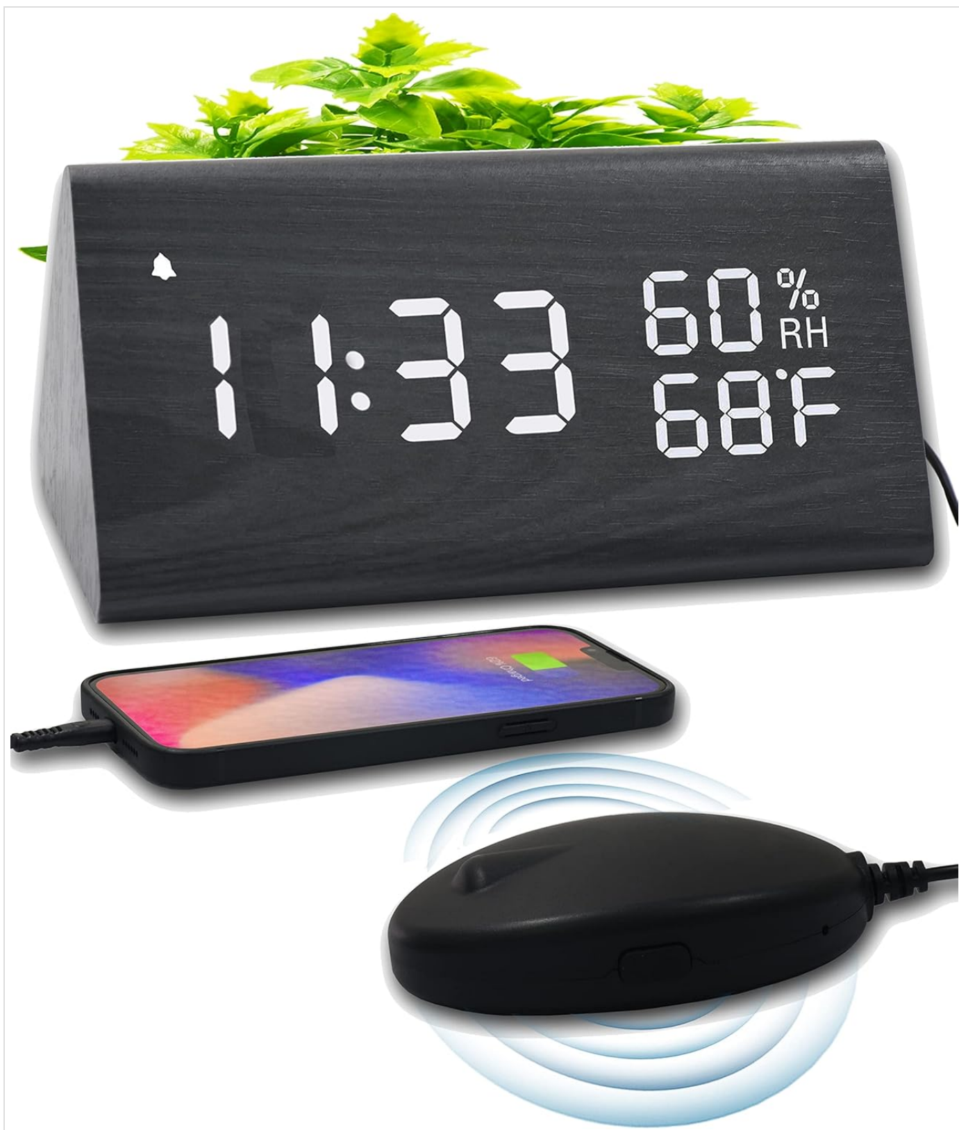
Image: The Coolfire Wooden Vibrating Alarm Clock, its vibrating shaker, and a phone connected for charging. The clock displays 11:33, 60% RH, and 68°F.