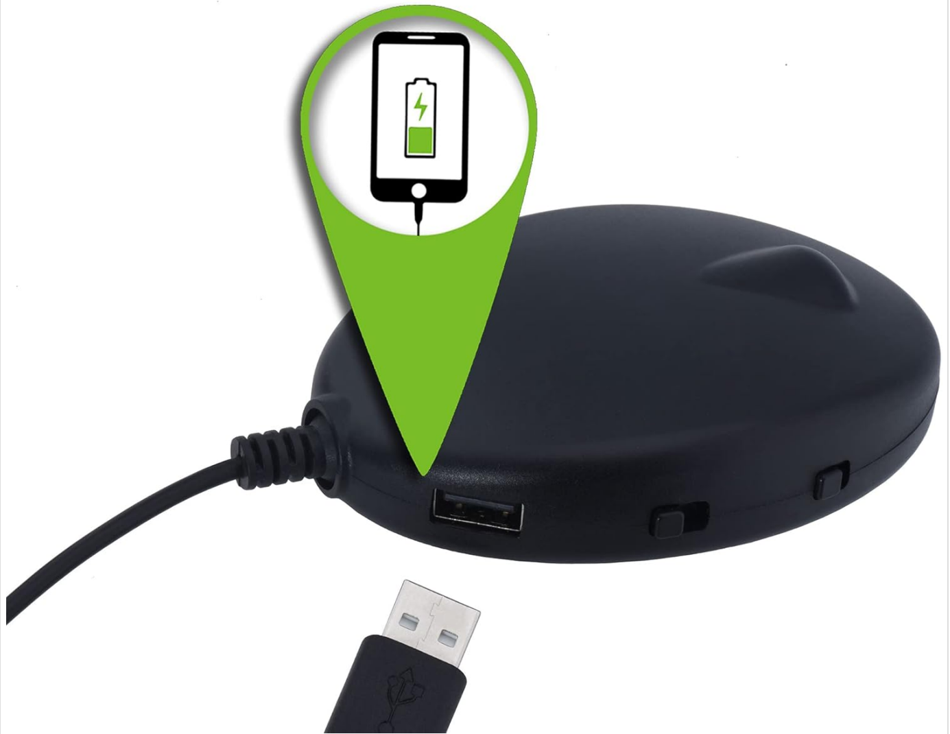
Image: The underside of the vibrating shaker showing a switch for selecting three wake-up modes: 1. Vibrate Only, 2. Sound Only, 3. Both Vibrate & Sound. A USB port is also visible.