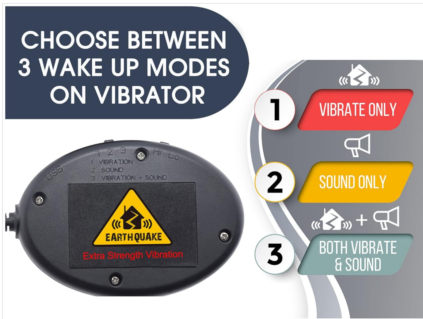
Image: A close-up view of the vibrating shaker, highlighting its "Earthquake Extra Strength Vibration" feature. The shaker is black and oval-shaped. The USB port is visible on the side.