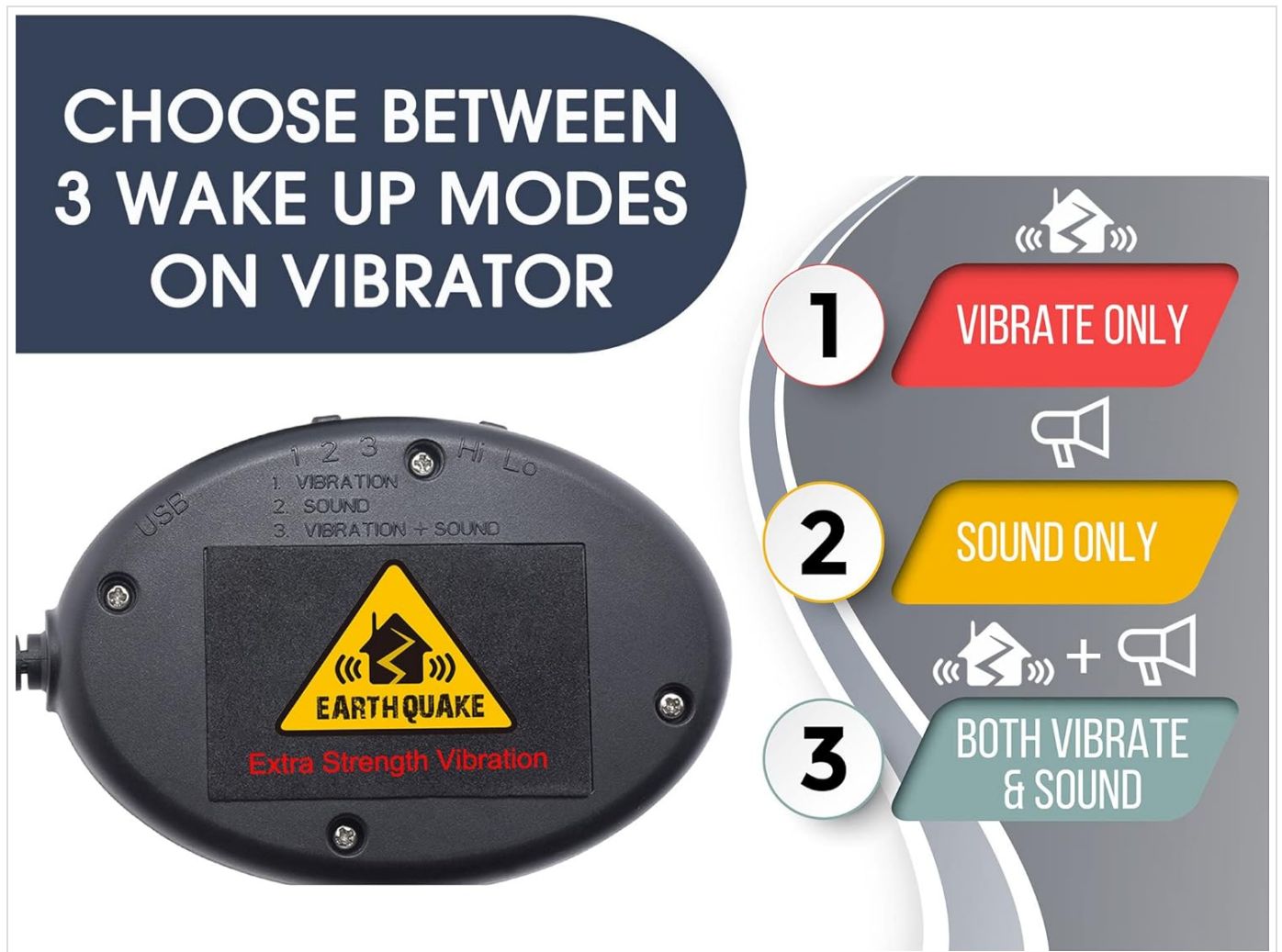
Image: A close-up view of the vibrating shaker, highlighting its "Earthquake Extra Strength Vibration" feature. The shaker is black and oval-shaped.