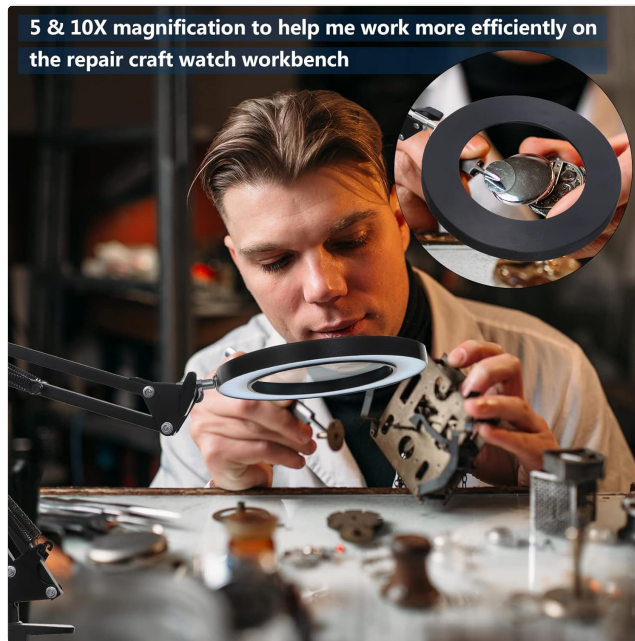
Image: A detailed view of the magnifying lens, highlighting the clear 5X main lens and the smaller, more powerful 10X insert for extremely fine details.