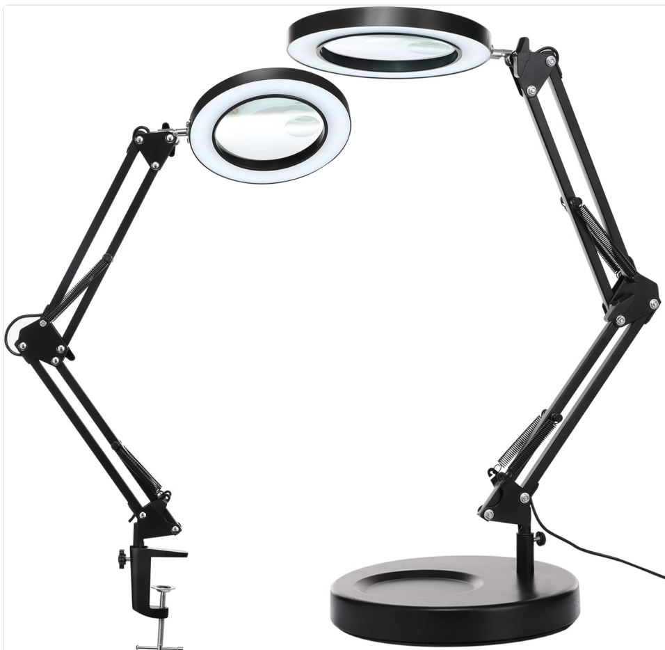
Image: The KIRKAS Magnifying Lamp, illustrating its dual functionality with both the heavy-duty desk base and the adjustable clamp attachment.

Thank you for choosing the KIRKAS 5X & 10X Magnifying Lamp. This versatile 2-in-1 LED desk lamp with clamp is designed to provide enhanced visibility and illumination for detailed tasks such as close work, repair, reading, and various crafts. It features adjustable magnification, multiple color modes, and stepless dimming to suit your specific needs and environment.