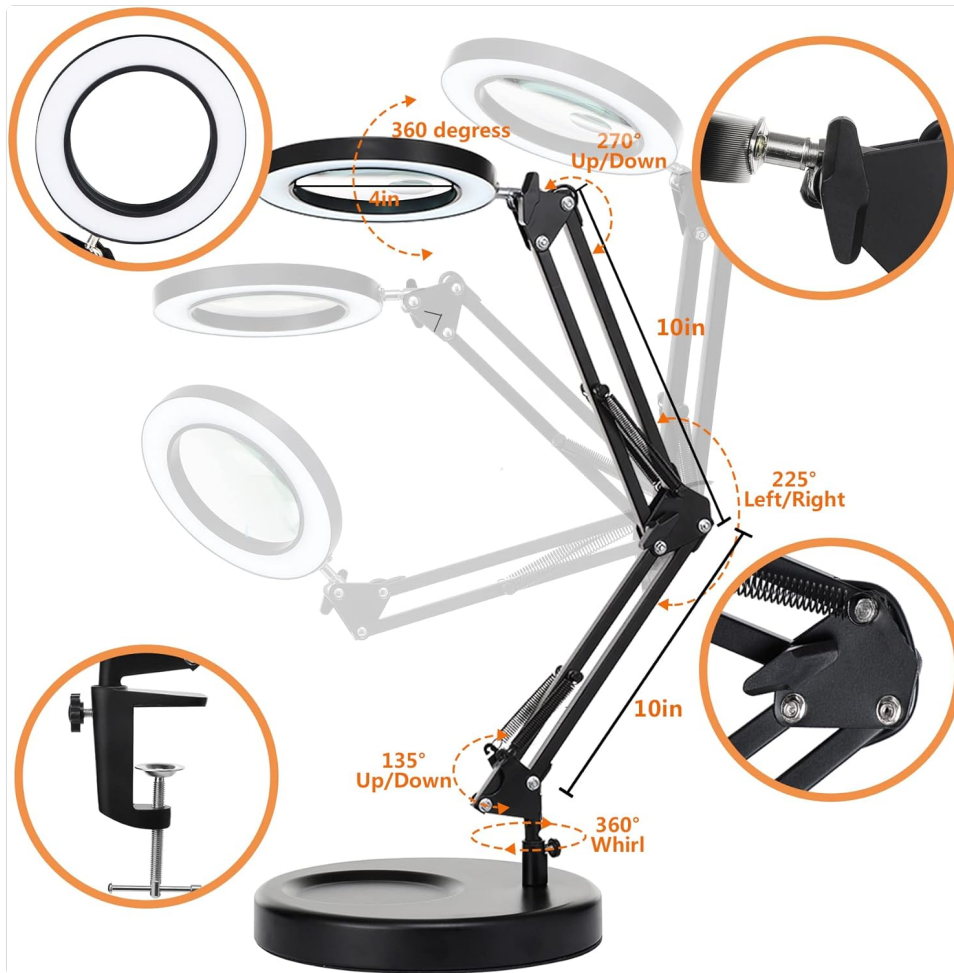
Image: A diagram illustrating the various adjustable angles and dimensions of the lamp's arm and head, including 360-degree rotation, 270-degree up/down tilt, and 225-degree left/right swivel.