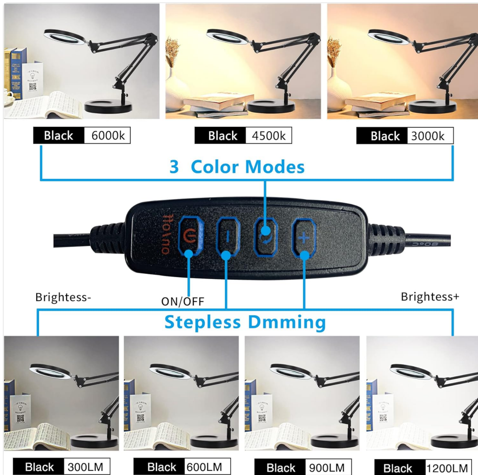
Image: The magnifying lamp securely mounted on its heavy desktop base, ready for use.