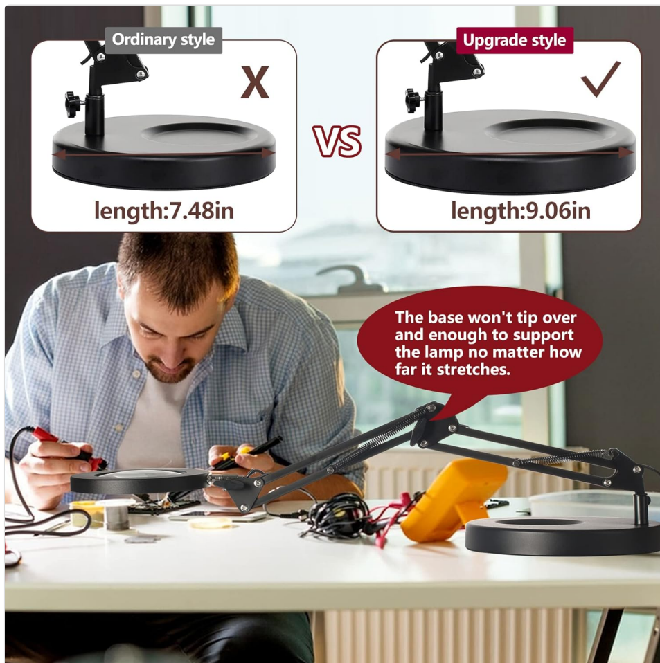
Image: A visual comparison demonstrating the larger, more stable 9-inch base (Upgrade style) compared to a smaller 7.48-